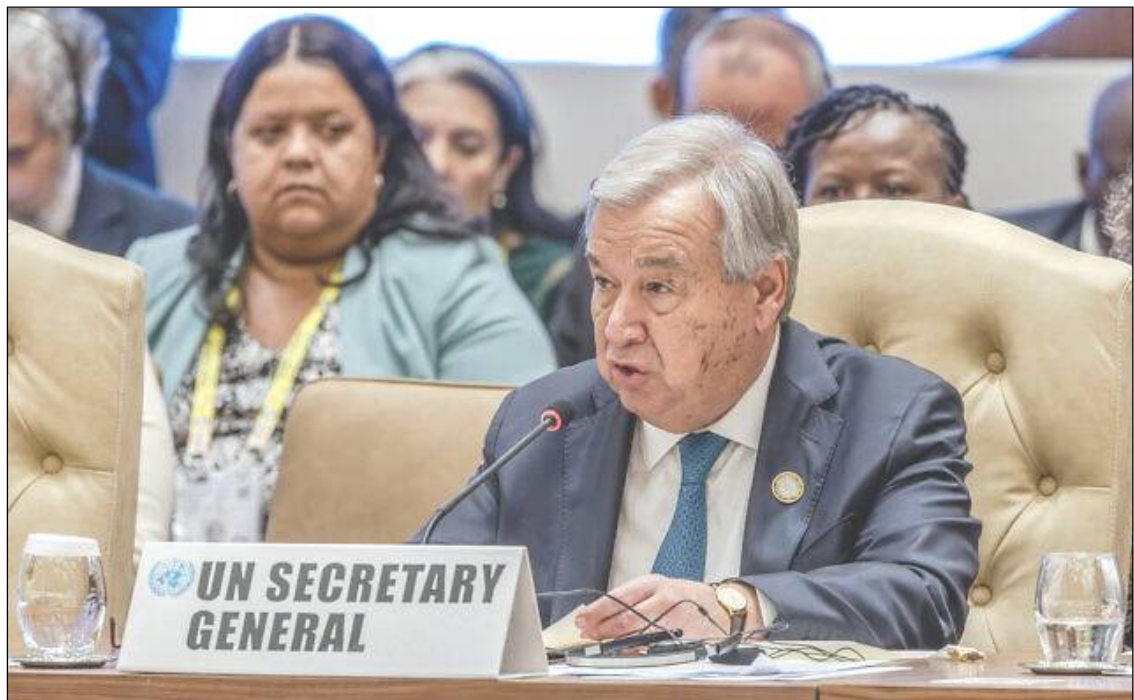
Kampala nung January 20, 2024 nü Non-Aligned Movement (NAM) indang 19th Summit of Heads of State and Government tembangba sentong nung United Nations Secretary-General Antonio Guterres-i jembidang tangokba noksa nung angur.

Kampala, Aenjeti/January 21 (Agencies): UN Secretary-General Antonio Guterres-i Honibarnü Uganda nung Non-Aligned Movement summit nung o jembiba mapang, state yangertsü atema Palestine nungertem temeden ajaki agizüktsüla, ta ashi. "Israel aser Palestine nunger atema two-state solution agizüktsü memulungba aser Palestine nungertem nem statehood magütsünübaji agizüktsü makok," ta UN lenir yagi Uganda yimtiba Kampala nung jembiba mapang ashi. "Iba amala tangatetba ajanga mangatetep tali atsülangyonga aotsü, koba alima yimjung aser security asoshi amokmeren tulu ka kumogo. State yangertsü atema Palestine nunger temedenji ajaki agizüktsüla," ta Guterres-i ashi. October 7 nü Hamas teloki Israel amakba sülen Gaza nung rara tenzüka liasü. Iba anogo Hamas puri Israel nunger 1,140 shi tepset aser asürtem