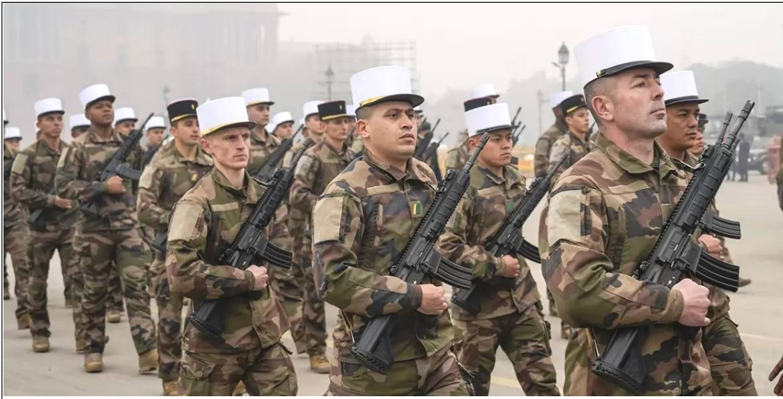
January 21, 2024 nü New Delhi nung taruba Republic Day Parade nung shilem agitsü atema France nungi sepaitem renemshidang tangokba noksa nung angur.