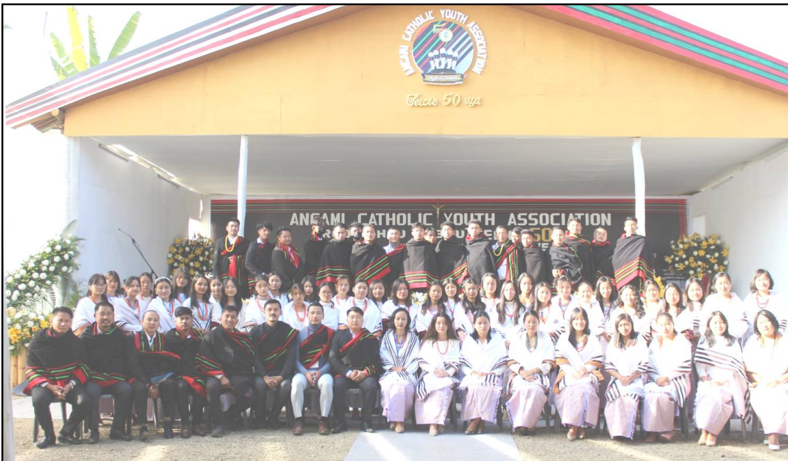
January 20, 2024 nü 33buba Angami Catholic Youth Association (ACYA) mungdang aser Golden Jubilee nung tangokba noksa nung angur