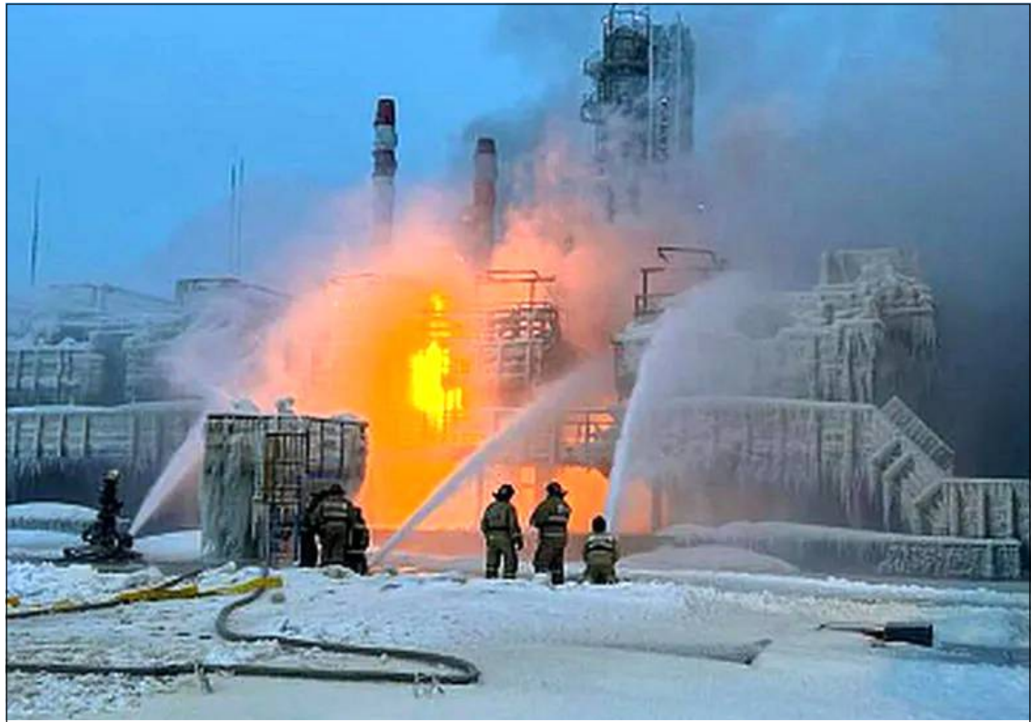
Russia nung St Petersburg yimti anasa gas export terminal nung mi adoka apokba sülen ketdangsurtemi mi remsepba noksa nung angur. Iba mi ya remsepogo aser nisung yiruba mali. Iba mi adokba kuli memetet, saka iba tesem anasa drones kar angu ta yangji aliba osangbener temi ashir. Ukraine-i kodanga iba ama lendong agütsüba menanzüker, saka Kyiv-i inyak ta Ukrainian media ajanga ashir. Tang rara nung Russia aser Ukraine nati drones amshir.

Gaza nung nüburtem talitsü jenjang kanga mejungi kümer aliba lemsatepogo aser Guterres-i Honibarnü meimchir temeden dak ajemdaker Gaza nung ceasefire benoktsü ayongzükogo. Israel nem teyari agütsür tongtiba United States-ia Palestine nunger atema state balaka kümtettsütsü aspshi pusema jembio. Tawa Israel Ato Kilonser Benjamin Netanyahu-i Palestine nunger atema state balaka mamenoktsütsü ta shiogo, koba Ameica-i aitsüogo. Rara tembangba sülen Gaza ya kechi koda achaayangtsü ta asüba dak sendakba nung mangatetep adoker aliba mapang ka nung Biden aser Netanyahu na Hokolbarnü jembio. Washington-isa, Palestine nungertem civilian tem kümzüka toktsütsü aser Gaza nungi Hamas pur raktoktsü merangba mapang tashiyim amshiba ya ajemshitsü ayongzükogo.