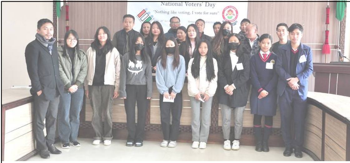
January 25 nü DC Conference Hall, Mkg nung NVD sentong agiba mapang DC Thsuvisie Phoiji den ketdangsürtem, BLO tem aser voter tasen tem tangokba noksa nung angur.

Dimapur, Aenjeti/January 25 (TYO): Linük ajunga den jangyu medema Mokokchung district nunga "Nothing like voting, I vote for sure" omen nung ajemdaker January 25 nü DC Conference Hall, Mokokchung nung 14buba National Voters 'Day mungogo. Iba sentong nung Mokokchung Deputy Commissioner (DC) Thsuvisie Phoiji alakteta jaoker liasü.