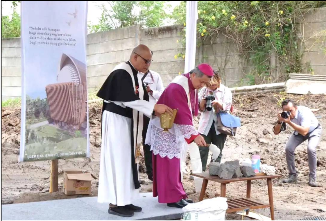
January 22, 2024 nü Indonesia kübok Padalarang sub-district nung St. Benedict Arogo Tenla ki asütsü atema kimong meshitetba sentong agidang tangokba noksa nung angur.

January 25, 2024: Indonesia nung Arogo kati küm 15 tejaklen Tenla ki ka asü tenzüka liasü, ajisüaka Muslim nunger kari ashishiba ajanga Tenla ki asütsü license ji thinenja liasü.