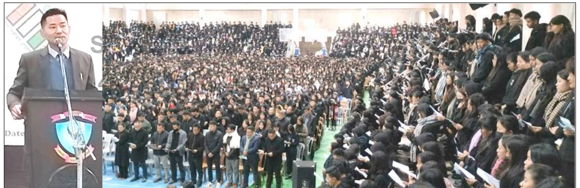
St. Joseph's College Jakhama nung January 25, 2024 nü State Level 14th National Voters Day amungba mapang tesemdanger tongti, Kesonyu Yhome, IAS (abelen)-i o jembidang tangokba noksa nung angur. (Achichi) St. Joseph's College Jakhama nung State Level 14th National Voters Day amungdang National Voters Day Pledge agiba noksa nung angur.

Dimapur, Aenjeti/January 25 (TYO): Nagaland indang Election department ajanga St. Joseph's College Jakhama den lungjemer January 25, 2024 nü Indoor Stadium St. Joseph's College Jakhama nung "Nothing like voting, I vote for sure" omen kübok State Level 14th National Voters Day munga liasü.