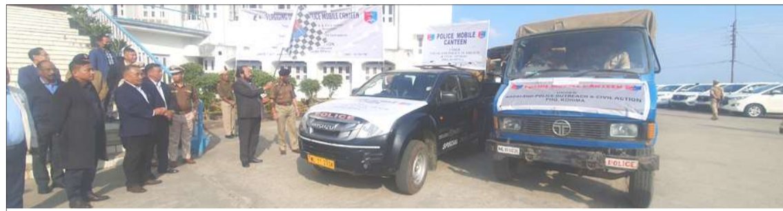
January 22, 2024 nü PHQ Kohima nung Deputy Chief Minister Y Patton-i Nagaland Police indang mapatong aika tenzüksü dang agiba noksa angur.

Kohima, January 22, 2024 (TYO): Nagaland Police kanga tejakleni ogo aser law & order tiptema ayuba den nübor tenzüksü temsüa kümogo ta Deputy Chief Minister Y Patton-i ashi.