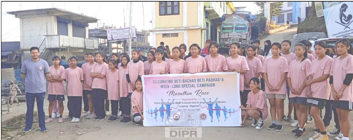
District Administration aser District Hub for Empowerment of Woman (DHEW), Longleng ajanga January 22, 2024 nü ayongzükba marathon race nung shilem agirtem den DC Longleng, Dharam Raj, IAS noksa nung angur.

Dimapur, Aenjeti/January 22 (TYO): National Day of the Girl Child nungtem nung District Administration aser District Hub for Empowerment of Woman (DHEW), Longleng ajanga January 22, 2024 nü "I Came, I Ran, I Finished" omen nung ajemdaker Longleng nung marathon race ka ayongzükba liasü.