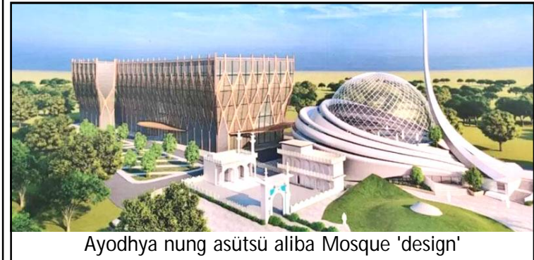
Ayodhya nung asütsü aliba Mosque 'design'

New Delhi, January 22 (Agencies): Ayodhya nung Muslim nungertemi May ita nungi mosque ka asütsü sentong renemdar; ajüsüaka iba mosque dang Babri Masjid majatsü.