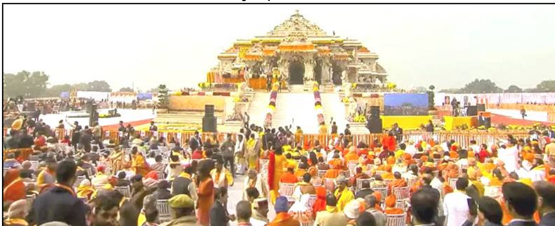
January 22, 2024 nü Ayodhya nung Ram Mandir semzüksü lia tangokba noksa nung angur.

Ayodhya, Aenjeti/January 22 (Agencies): Hombarnü Ato kilonser, Narendra Modi-i, temeshi yimti Ayodhya nung Ram tekülem kidang Ram Lala sünyanglu meshitetba ya khenyongi balaka aser kodanga mamatetsü mapang ka, ta ashi. Ayodhya nung lokti den jembidang Modi-i, "Tanü linük tesem ajaklen aser alima tesem balala nung Ram tsüngrem külemertemi puti otsü mapang ya mamatetsü, ta ni amanger. Iba mapang ya ajak rongnung temeshitiba mapang lir," ta ashi. Modi-isa, "Putu aika ataba, aremzüka aser tenlaba sülen tanü kibuba Ram aruogo. Iba ya putu tasen ka tenzüker, joko Ram Lalla süki nung malitsü,"