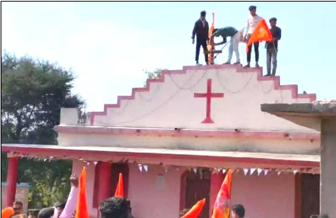
January 21, 2024 nü Madhya Pradesh state kübok Jhabua district nung aliba Protestant Shalom Arogo Tenla ki kolak nung Hindu nungertemi 'saffron' wako songa yutsü dang tangokba noksa nung angur.

January 22, 2024: Madhya Pradesh nung Hindu yimsü alia amanger teloktemi Khristantem Tenla ki pezü nung 'saffron' wako songa yutsüba sülen Khristantemi Hindu nunger aibelenertem nemji temerenshi agütsütsüla, ta takhangba agütsü.