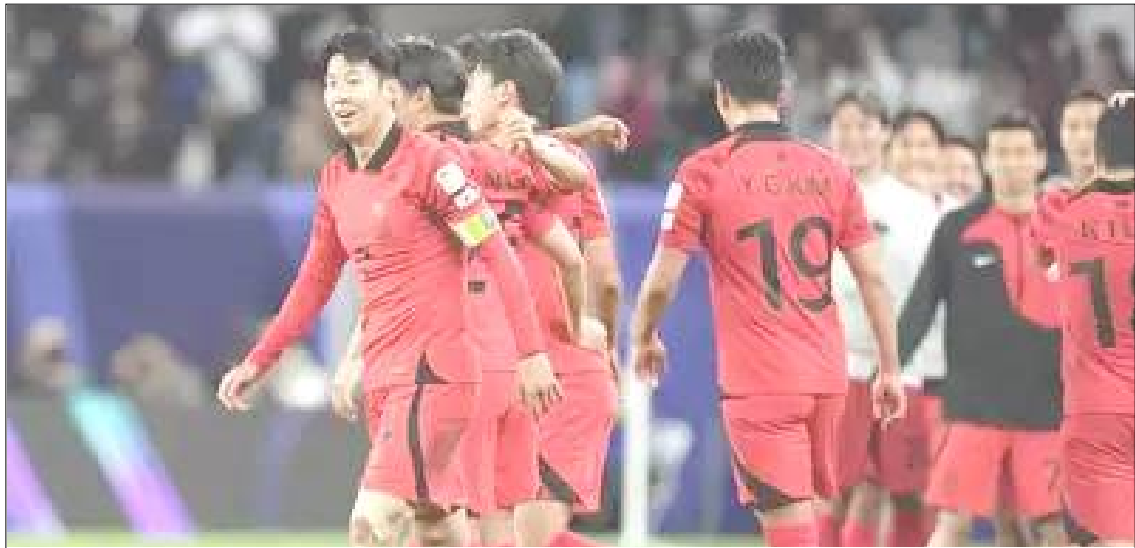
South Korea asayar Son Heung-min-i (abelen) tanabuba goal agütsür pelatepba yangi noksa nung angur.

Tsüklai/February 3, 2024 (Agencies): Tang asaya aliba Asian Cup nung Honibarnü South Korea aser Australia na asayaba mapang Son Heung-min-i mapang apuloktsür asayadang free-kick ka kanga junga idakja South Korea semifinal-i iogo aser parnok Jordan den asayatsü.