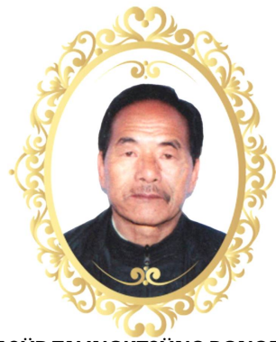
ASÜR TALINOKTSÜNG PONGEN 04.02.2023 – 04.02.2024