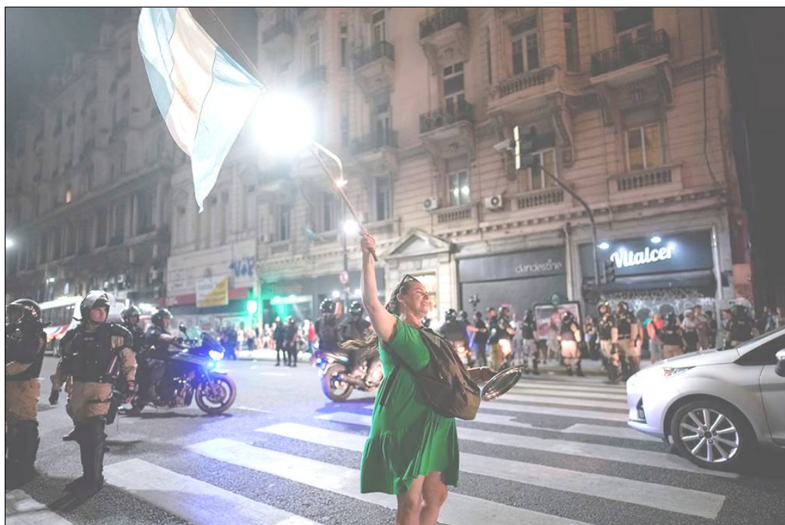
Buenos Aires, Feb. 03: Argentina Tir Javier Milei-i bill ka benokba Congress nung jembidang sorkar anemer temi kima national flag ka ayipshiba noksa nung angur. Iba bill nungya rongsenketzung, administrative, mapa tamajung inyakba aser lipajen temelenshi indang sentong balala lir.