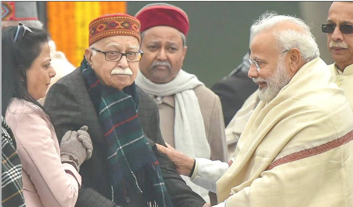
Tamalen tangokba noksa nung Ato kilonser, Narendra Modi aser BJP lenir tain, L K Advani na noksa nung angur. February 03, 2024 nü Modi-i BJP lenir tain aser taoba mapang Deputy Ato kilonser, Advani nem Bharat Ratna agütsütsü, ta sangdongogo.

ajaki health facilities mangu tashi ni kü nem lemzüksüba tesem nung nüburtem tenzüksü, ta telemtetba agir," ta Union Minister-isa meetdaksü. Rajasthan kübok Thar lisem lima nung doctor tem aikati alitsü memelunger, aser iba dak sendakba nung Health minister-i doctor tem dang Rajasthan nung lisem aliba kanga tezülen tesem nung primary health centres (PHC) nung küm anabosa tenzüksü melungtetang, ta ayongzük. "Asenoki iba mangdangji yur inyakra 2047 küm tashi nungbo asen linük ya terenlok linük ka kümdaksütsü nükjidong yua aliba ya atangji ataloktsü," ta paisa shisem.