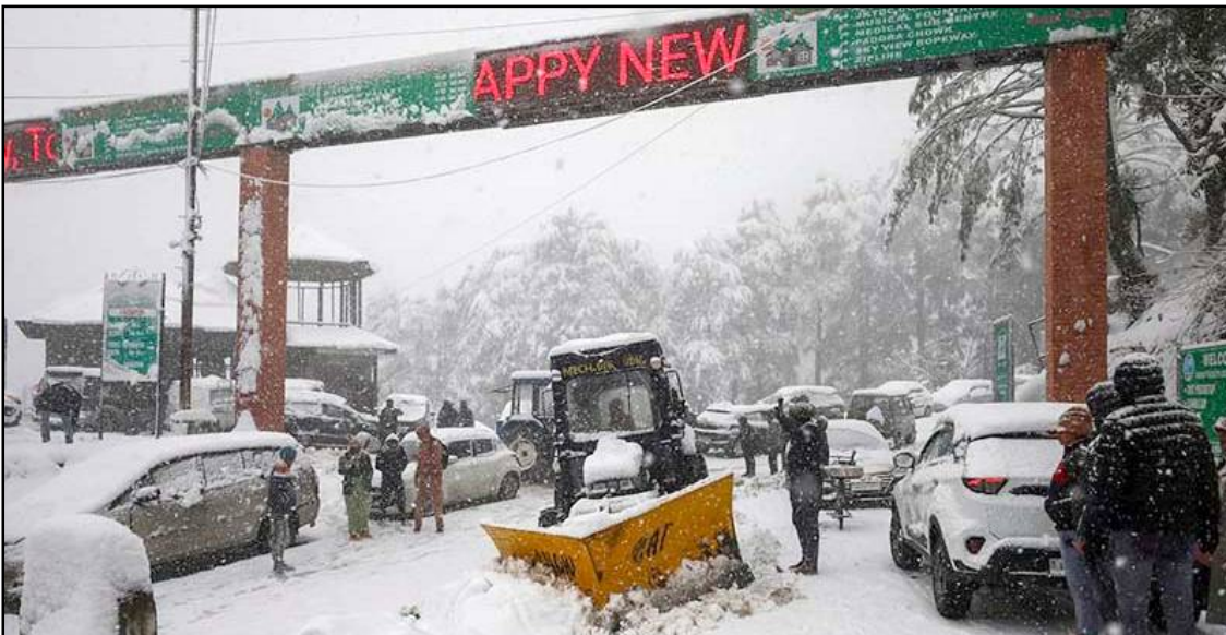
February 04, 2024 nü Patnitop nung aliba Jammu-Srinagar national highway nung rürjep merüktetba noksa nung angur.

Union Home Minister, Amit Shah-i linük tesem ajak Uniform Civil Code benoktsü, ta sabang balala nung aiben jembia lir.