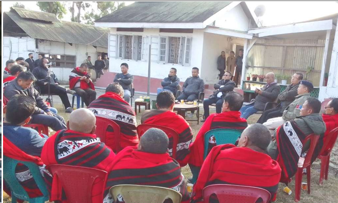
(Abelen) Mokokchung Municipal Council Shopping Complex rongtokker aliba noksa. (Achiji) Mokokchung Municipal Council Shopping Complex rongtokba dak sentakba nung February 4 nü Mokokchung Deputy Commissioner Thsuvisie Phoji-er kidang shisa lemsatepba senden ka jatepa amenba mapang tangokba noksa.

Mokokchung, February/ Tsüklai 02 (TYO): February 03 aonung ajungbena Mokokchung Municipal Council, Shopping Complex nung mi adoka arongba dak sentakba nung Mokokchung Deputy Commissioner Thsuvisie Phoji-er tanü February 4 nikongdang 2 ako nung par kidang Ao Senden, Watsü Mungdang, Ao Kaketshir Mungdang, All Ward Union Mokokchung, Mokokchung