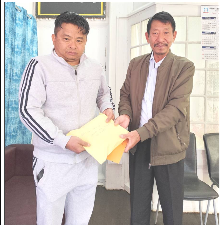
Feb 3 nü Mokokchung nung MMC complex arungdang takoksa ajururtem nem RD & SIRD Minister, Metsübo Jamiri teyari sen lakh 5 bener yokba 27 Mokokchung town assembly constituency NDPP tir, Tiameren ajanga Mokokchung DC nem amoktsüba mapang tangokba noksa nung angur. Mokokchung, 5th February, 2024

Maneni state nung law and order wazüka amshitsü mechi bendanga agütsür meranga inyakba atema team ajanga dang pelaba lemsateper, ta sangdong ajangasa ashi.