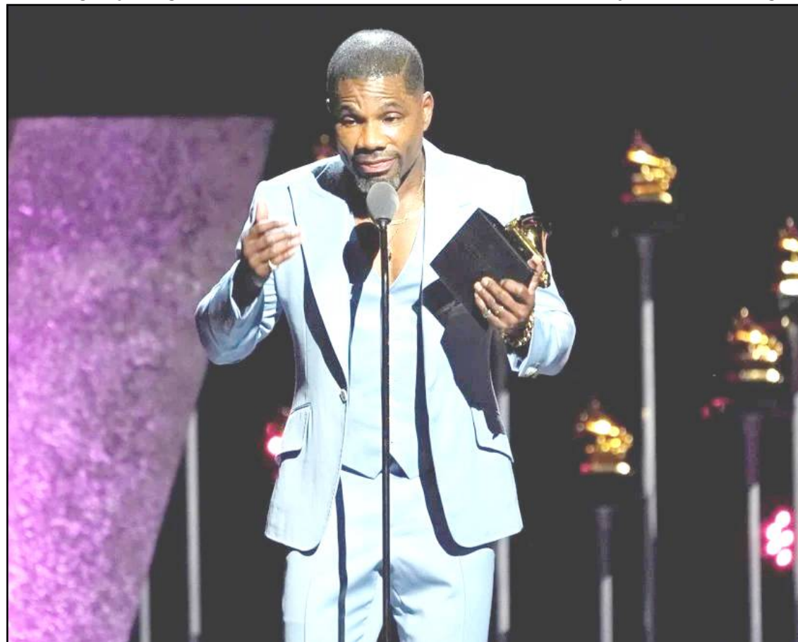
February 04, 2024 aonung Los Angeles, California nung 66buba GRAMMY Awards sentong nung osangtajung kentener, Kirk Franklin-i Best Gospel Performance/Song award agizükba sülen o jembidang tangokba noksa nung angur.

February 05, 2024: Khrista osangtajung kentener nungtu, Kirk Franklin-i Grammy Award 20buba nguogo; Amongnü (February 4) Grammy Award sentong nung pai 'All Things' ken ajanga Best Gospel Performance/Song award angu.