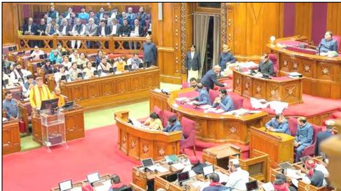
February 05, 2024 nü Lucknow nung Uttar Pradesh assembly nung Finance Minister Suresh Kumar Khanna-i Budget 2024-25 benokdang tangokba noksa nung angur. Kasa noksa nung Uttar Pradesh Chief Minister, Yogi Adityanath-a angur.

Mayor election nungji AAP aser Congress nati longjemer külem candidate ka toktepdakja liasü. Parnoki election inyakyim ashishia Punjab Haryana High Court nung ken o benok saka court-i magizükba ajanga maneni parnoki Supreme Court nung kasa ken o benoka liasü.