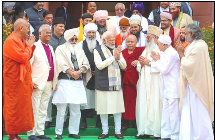
New Delhi, February 05, 2024: India nung yimsü balala nungi lenirtemi Parliament House kima Ato kilonser, Narendra Modi ajurudang tangokba noksa nung angur.

At Aoyim Village (middle of the village) near 4th Mile, Chümoukedima @300 per sq.ft. (negotiable) No broker, any size land available. Contact : 8974754265 / 8787392096