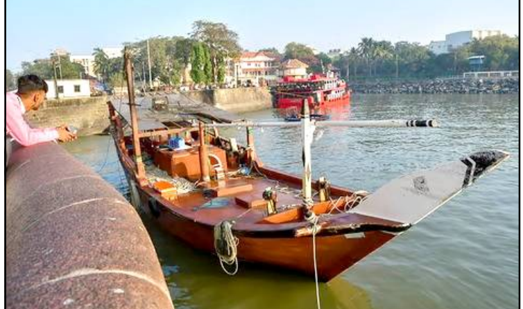
Mumbai, February 07, 2024: Nisung aseme Kuwait nungi anir aruba rong ka noksa nung angur. Kuwait nungi nisung aseme ozüng alema Mumbai tashi rong nung aruba sülen par asemprongla puogo, ta Bodhbarnü ketdangser kati metetdaksü.

nunga Kejriwal jaoka liasü saka pai ED matsüngdangi maoba sülen ED-i Kejriwal anema Delhi court ka nem temepishiba ken o agüja liasü. AAP-i, ED-i Kejriwal jaokba ya yimtenren tsütsülen nungi lir, iba denji külemi Ato kilonser, Narendra Modi nükjidongji Delhi nung AAP sorkar chirepdaksütsü asoshi Arvind Kejriwal pudaksütsü atema lir, ta tai tongloksür. Tamalen (yaküm April ita nung) excise policy ken o dak sendakba nung Central Bureau of Investigation (CBI)-i Kejriwal dang ghonda 9 tashi asüngdangyaa liasü. Tang tashi nungbo iba ken o nung pa nem tai tongloksü mali. Iba mapang nungji Kejriwal-i, "CBI-i tasüngdangba 56 asüngdanga liasü (saka) ajakji tailla. Parnok ket nung kuli ka danga mali, ta ni metetogo," ta metetdakja liasü. Kasa ken o dak sendakba nung yaküm AAP lenir ana-taoba mapang Delhi Deputy Chief Minister Manish Sisodia aser Rajya Sabha MP, Sanjay Singh nabo puogo.