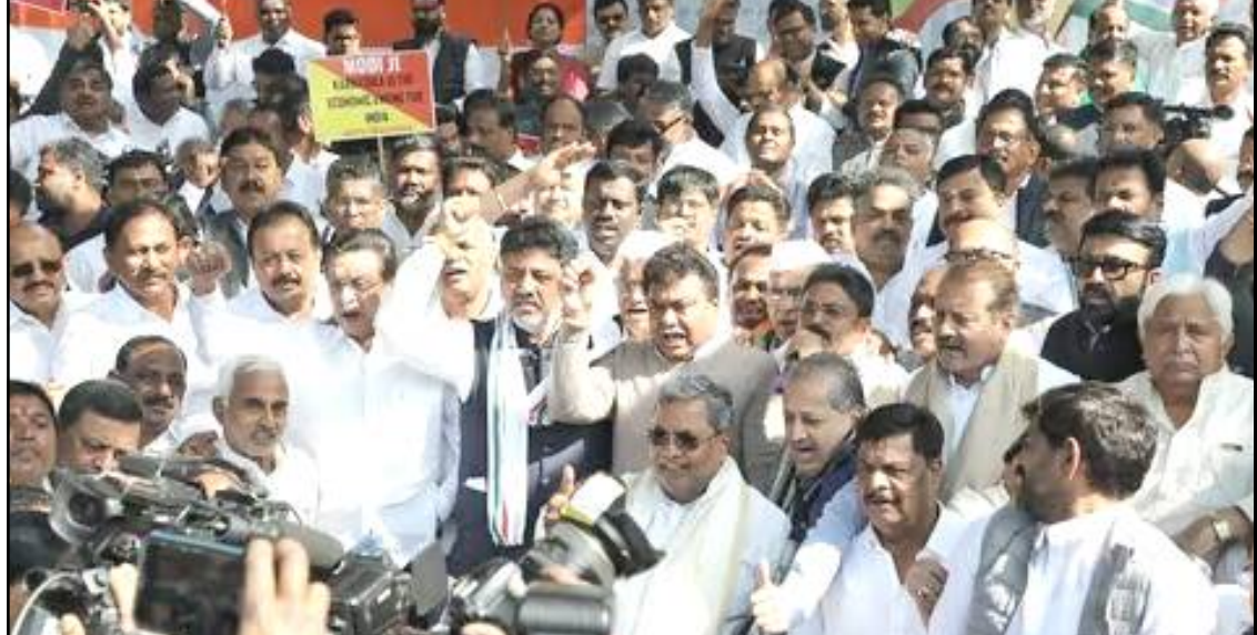
February 07, 2024 nü Jantar Mantar, New Delhi nung Karnataka Deputy Chief Minister, DK Shivakumar leniba nung party nung lenirtemi Centre sorkar anema longkak aيتدang tangokba noksa nung angur.

yanglurtemi mapang tetemsü nung UCC benoktsü atema Arrla 44 ajanga state tem nem tashi agüja liasü. Iba ozüng dak sendakba nung nüburtem terata lir. Linük temzüng nung aliba ama onoki iba ozüng renem," ta metetdaksü. Lok Sabha election agitsü ita ishika dang lia Uttarakhand nung Uniform Civil Code agizükör. Union sorkaria iba ama ozüng ya linük jenjang nung benoktsü tebilemba lir. BJP-i yimsüsüba states Gujarat aser Assam-ia peipei state nung UCC agizüktsü atema inyakdar. 2022 küm Uttarakhand nung assembly election atema nüboyimba mapang nung BJP-i state nüburtem dang parnoki takok ngura UCC Bill agizüktsü, ta nangzuka liasü.