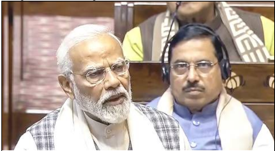
New Delhi, February 07, 2024: Bodhbarnü Ato kilonser, Narendra Modi-i Rajya Sabha senden nung jembidang tangokba noksa nung angur.

New Delhi, February 07 (Agencies): Bodhbarnü Rajya Sabha senden nung Congress party aija Ato kilonser Narendra Modi-i, akhidang nungi Congress-i Dalit nungertem, backward classes aser tribal nüburtem anemer, ta metetdaksü. Congress-i linük tesem ajaklen caste census agitsü akhangba dak sendakba nung Ato kilonseri, iba ama tesempa ajanga tribal tsür ka India Tir asütsüji Congress-i anema liasü, ta ashi. Paisa BJP-i aniba NDA sorkari dalit nungertem, tribals