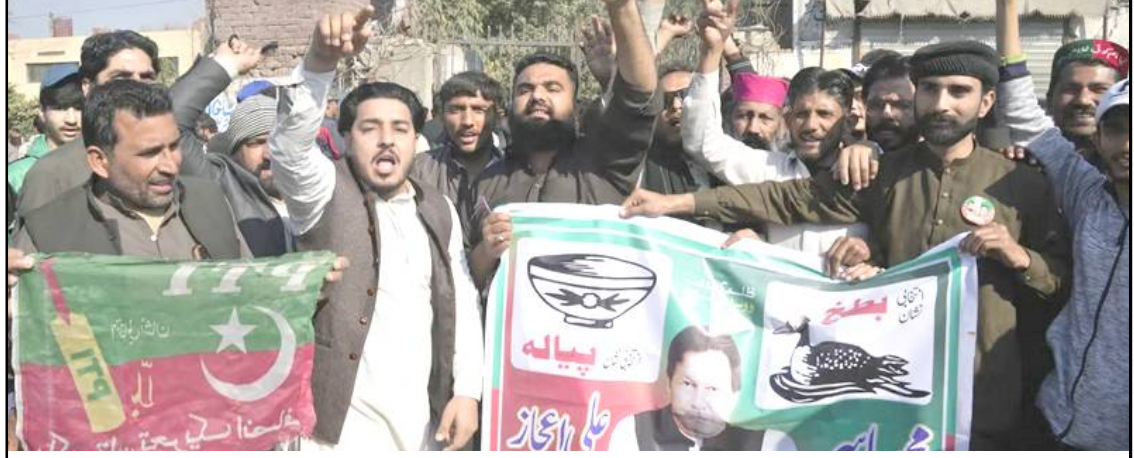
PTI bhukumer tem Pakistan nung longkak aitba noksa nung angur. Deobarnü Pakistan indang election commission ajanga sangdongba parliamentary elections osang nung taoba ato kilomser Imran Khan den sendaktepa aliba independent candidate temi menden timba nung takok angu.

Islamabad, Tsüklai/February 11 (Agencies): Deobarnü Pakistan indang election commission ajanga February 8 general elections indang osang sangdonggogo, kong tepuokdak yua alisang taoba ato kilonser Imran Khan'er party-i yariba independent candidate temi menden 101 ngua menden shilem tuluba nung takok angu. Election nung tim masüba mapa inyak ta Pakistan Tehreek-i-Insaf (PTI) workers temi linük tesem ajungalen longkak aitba mapang iba osang ya arur. Menden 265 nung toktepba nungi menden 264 indang osang Election Commission of Pakistan (ECP) ajanga sangdong. Ashikülak mapa inyak ta ashishitepba ajanga Punjab province kübok Khushab nung alina NA 88 indang result ECP-i soita lir aser metokmeperi bentetba sülen sangdongtsü. Candidate ka asüba sülen menden ka atema election thinena lir. Imran Khan'er PTI teloki yariba independent candidate temi menden 101 nung takok