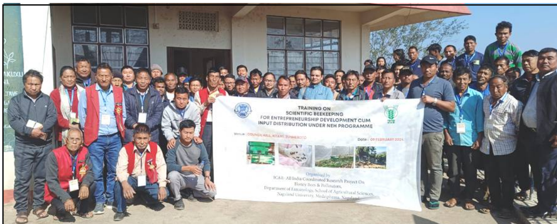
Kitami yimdak February 10, 2024 nü ninang metsüba training agütsü dang tangokba noksa ka nung training agirtem, iba training ayongzüker aser shisalen sayurtem angur.

Dimapur, Tsüklai/February 11 (TYO): All India Co-ordinated Research Project on Honey bees and Pollinators, AICRP (HB&P), ICAR, School of Agricultural Sciences, NU, Medziphema ajanga February 10, 2024 nü Zunheboto District kübok Kitami yimtsüing nung "Scientific Beekeeping for Entrepreneurship Development cum Input Distribution" nung ajemdaker anogo ka training agüja liasü.