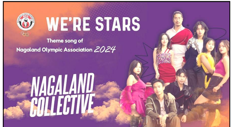
Nagaland Collective ajanga Nagaland Olympic Association 2024 asoshi mejemba "We're Stars" ken tanü sayaogo. Iba ken video ya YouTube https://youtu.be/pe6r5CH6Dyc?si=MC4XuLQoVQz-4SAf nung repringtetsü.

Tetsür, teintet rogo aser tanurtem densema iba camp nung nisung 150 shi dena teyari agia liasü.