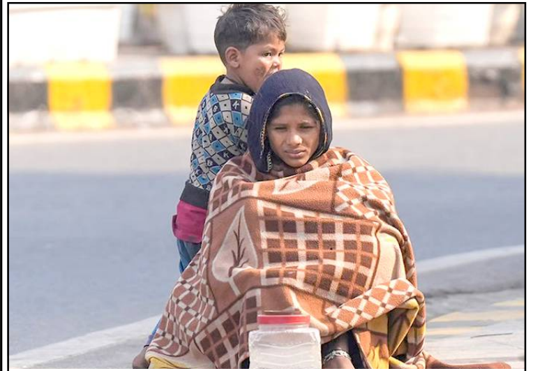
February 11, 2024 nü New Delhi nung aliba Connaught Place kima talidak malir tetsür ka aser lar jabaso na mena aliba noksa nung angur.

"Election Commission-i agiba telemtebaji taoksatsüka lir. Iba party tenteterem aser party yangerteterem ket nungi party rakzükogo. Onok meyong party ka tangar nem agütsüogo, linük nung yamai kodanga matalokdang. Nüburtemi iba telemtebaji (EC) kodanga pumasemtsü, ta ni bilemer. Hombarnü onok senden ka mena nungja tasenba aser election temaitsü atema jembitsü," ta paisa metetdaksü.