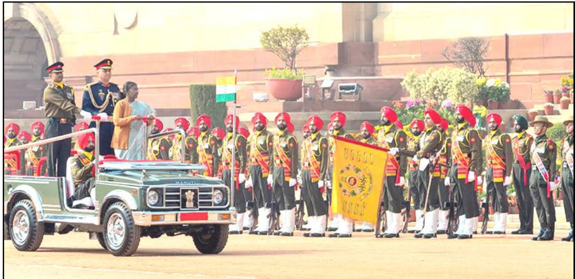
New Delhi, February 11, 2024: Amongnü Rashtrapati Bhavan nung Army Guard Battalion mapa melentepba sentong nung sepaitemi linük Tir, Droupadi Murmu agizükdang tangokba noksa nung angur. Sikh Regiment 6th Battalion kümsük abensaba sülen 5th Gorkha Rifles 1st Battalion nem mapa melenzüksüogo.

Aluyimertemi sorkar dang minimum support price (MSP) akhanger, Lakhimpur Kheri nung aluyimertem menüngsetba ken o nung aibelenertem nem temerenshi agüjang ta akhanger, aluyimertem anema benoka aliba ken o ajak agentsü akhanger aser arrshi küm 60 ser temapur aluyimertem nem ita shia pension 10,000 agüjang ta akhanger.