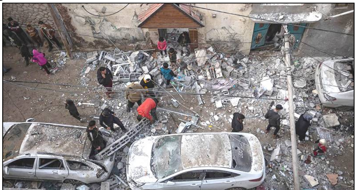
Israel-i tayimtsü amshia Rafah, Gaza Strip amakba sülen Palestine nungertemi ki o jen raksar aliba repringba noksa nung angur. Israel-i Palestine nunger aika jenoka aliba Rafah region nung tayimtsü amshia amak tenzükgoo, kong nüburttem timtem balala ajurua alir.

Jerusalem, Tsüklai/February 11 (Agencies): Gaza south tsütsü Palestine nunger refugee tem adenshia aliba Rafah yimti amaktsü Israel sentong aliba atema linük balalai tekum dangtsü ashir. UK Foreign Secretary David Cameron-i iba tesem nung Gaza nütsüng yongsük tesadang dak tema jenoka lir ta ashi, aser Dutch Foreign Minister Hanke Bruins Slot-ia civilian aika asütsü ta ashi. Rafah ya amak nungbo takoksa tulu ajurutsü, ta Saudi Arabia-i tekum dangtsü shiogo. Gaza nung yimsü asüba Hamas telokia civilian meyirijang aika asütsü ta ashi. Operation kar danga agira Gaza nung Israel nunger pua aliba chioktsü asoshi jembishinüba nung tetsükdaktsü ajurutsü, ta Hamas teloki Deobarnü ashi. October 7 nü Hamas teloki Israel south tsütsü nisung 1,200 dak tema tepseter ano nisung 240 shi pua bener aoba