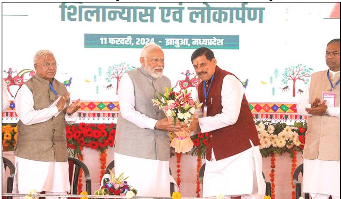
February 11, 2024 nü Jhabua nung terenlok projects balala semzüksüba sentong nung Madhya Pradesh Chief Minister, Mohan Yadav-i Ato kilonser, Narendra Modi agizükdang tangokba noksa nung angur. Kasa noksa nung state Angh, Mangu Bhai Patel-a angur.

Jhabua, February 11 (Agencies): Amongnü Ato kilonser, Narendra Modi-i, taruba Lok Sabha election nung BJP-i menden 370 dak tema angutsü, ta ashi.