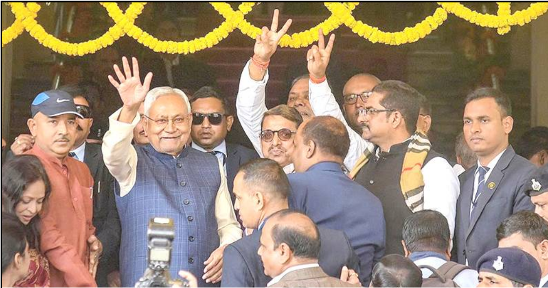
February 12, 2024 nü Patna nung floor test agitsü lia Bihar Chief Minister Nitish Kumar aser NDA MLA tem Bihar Legislative Assembly-i arudang tangokba noksa nung angur.