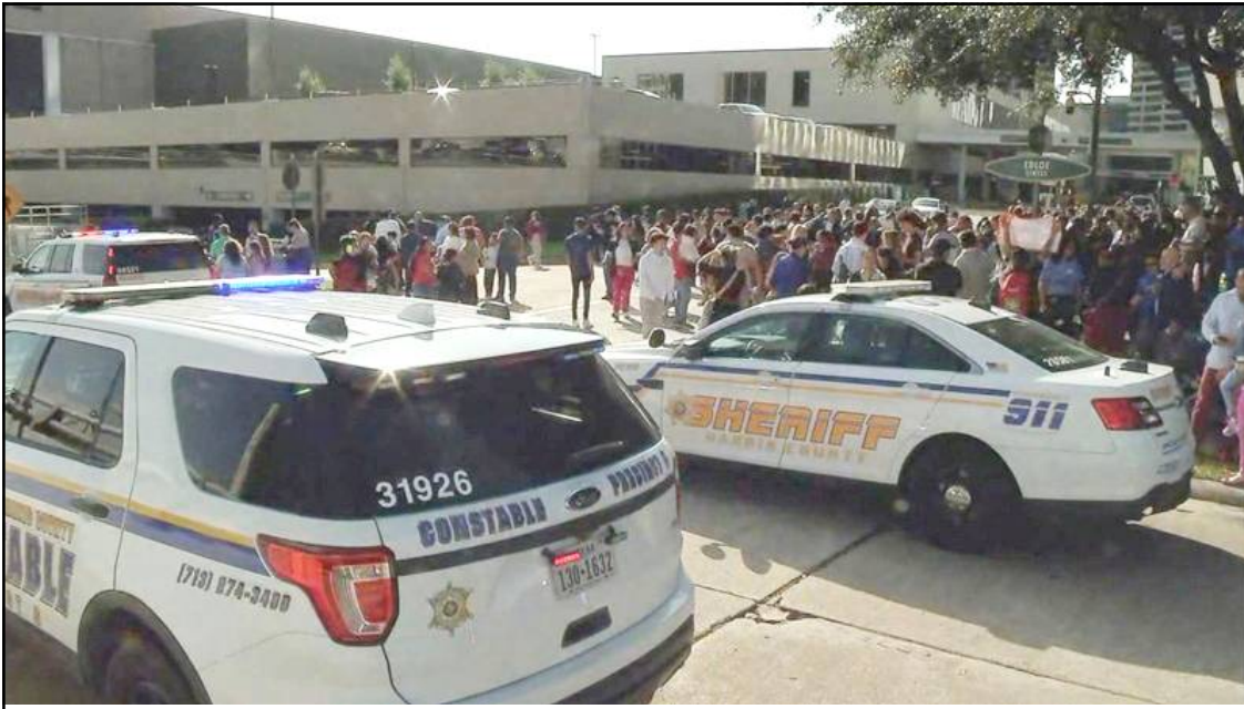
February 11, 2024 nikongdang Houston, Texas nung Pastor Joel Osteen-i aniba Lakewood Church nung lendong atalokba sülen tangokba noksa nung angur. Tenla ki telung nung tetsür kati ajungbena injang khaloktsüba sülen duty officers anati la khaset.