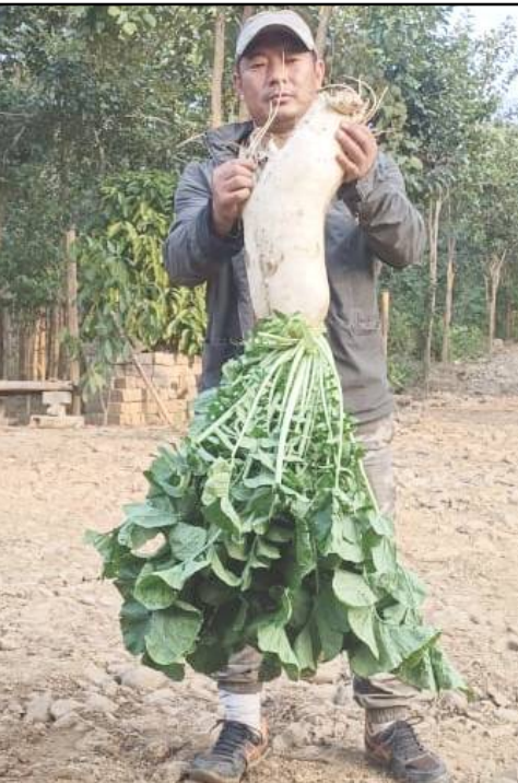
Mangmetong lushi, Nokjok lenden nung züsentetba gopi (cauliflower) ka agi seret (kg) 5 aser mola ka agi seret 8 noksa nung angur. (February 12, 2024).