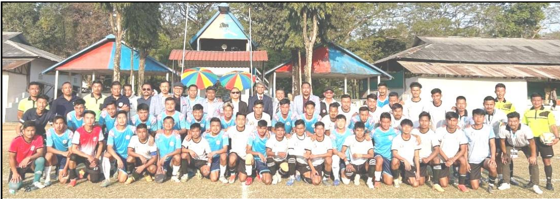
February 12 nü NOPG 2024 tebur football asaya quarter finals masaya tsüngda All India Football Federation Tir Kalyan Chaubey, den Kohima aser Chümoukedima team nungi asayartem, NOPG 2024 aser Nagaland Football Association züngsemtem tangokba noksa nung angur.

Dimapur, Tsüklai/February 12 (TYO): Khelo India University Games nung shilem ka ama Nagaland-i co-host süa February 22 nungi 26 tashi IG Stadium, Kohima nung wrestling asaya asayatsü.