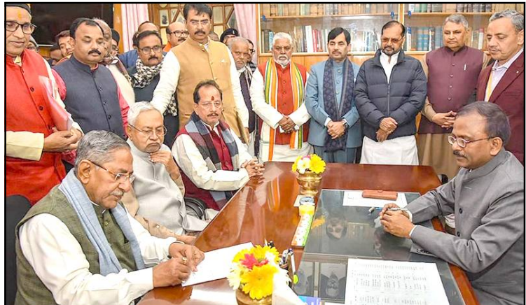
BJP lenir Nand Kishore Yadav, Bihar Assembly Speaker mapa atema Bihar Chief Minister Nitish Kumar aser Deputy Chief Minister Vijaya Kumar Sinha na matsüngdang nomination paper file asüba noksa nung angur.

Solar panels amenoktsü atema scheme ya Union finance minister Nirmala Sitharaman-i 2024-25 atema interim budget mapang sangdonga liasü.