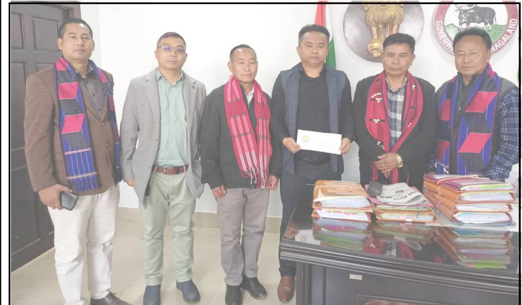
Mokokchung, February/Tsüklai 12(TYO): Eastern Nagaland Peoples Union Mokokchung, Eastern Nagaland Churches Fellowship Mokokchung teloki Mokokchung Municipal Council Shopping Complex February 3 aonung arongba nung kongshia alir timtemer kija aser kibongtem asoshi teyar sen 40,000/- tanu Mokokchung Deputy Commissioner nem amoktsüdang tangokba noksa nung angur.

agütsütsüba osangtsüsang ajak iba website nungya angütsü, ta sangdong ajanga ashi.