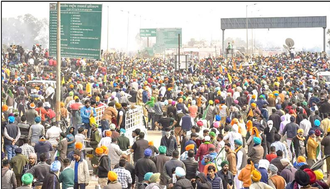
Delhi Chalo march sentong mapang Punjab-Haryana Shambhu arrtsü anasa aluyimertem adenshir aliba noksa nung ngur.

New Delhi, Tsüklai/February 13 (Agencies): Aluyimertem takhangba dak sendakba nung Union minister ana den sensaksem asema sülen parnok takhangba maneni nenshitsu atema Aluyimertemi Mongolbar anepdang 'Delhi Chalo' march longkak aitba sentong tenzükshigo.