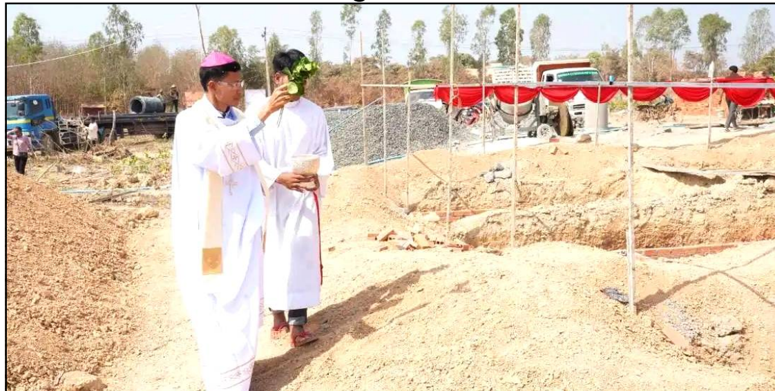
Cambodia anüdoklen Keo Seima natural reserve nung tribal Catholic nunger asoshi tekülem ki tasen ka yanglutsü tenzükba mapang Bishop Pierre Suon Hangly-i 'holy water' rükloktsüba noksa nung angur.