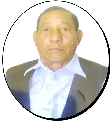
ANOGO : 17/02/2023

Na iba lima toktsür küm ka süitema aruaka nü temeim aser mapa tajung onoki teti bilemteter. Na onok den taküm meliaka nü shisatsü tajung aser temeim onok den teti lir, na teti asoshi anisüngzükdak Kibuba den Kodak nung lir ta onok tamang sarasadem aser teimla.