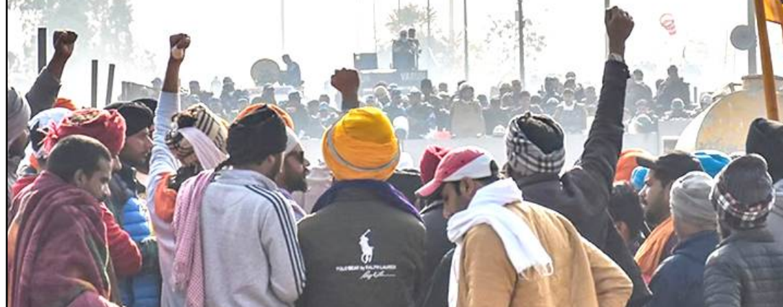
February 16, 2024 nü Patiala district anasa Punjab-Haryana Shambhu arrtsü anüker sepaitem matsüngdang aluyimertemi longkak aita yimyim ayimdang tangokba noksa nung angur. Hokolbarnü Samyukta Kisan Morcha (SKM) densema aluyimertem union aikati linük tesem ajaklen Gramin Bharat Bandh ayongzüka agiogo.