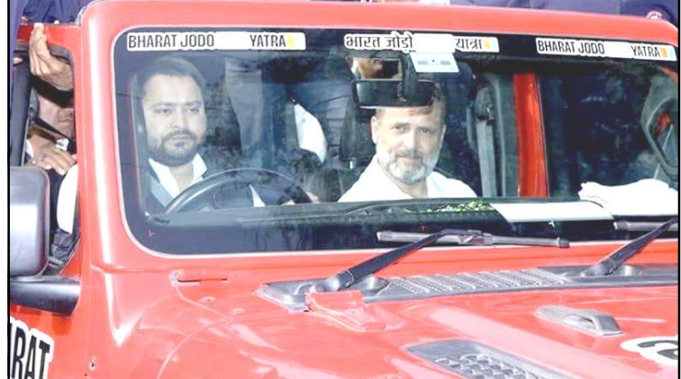
February 16, 2024 nü Bihar kübok Sasaram district nung RJD lenir aser taoba mapang Deputy Chief Minister, Tejaswi Yadav-i aniba gari ka nung Congress lenir Rahul Gandhi-i 'Bharat Jodo Nyay Yatra' agidang tangokba noksa nung angur.

Hokolbarnü iba sentong nung Modi-i sen crore 17,000 jenjang terenlok project aika semzüktsüba den külemi project tasen atema foundation lung azüngtsüogo. 'Viksit Bharat Viksit Rajasthan' programme ya district ajak nung tesem 200 nung ayongzüka agi aser tongti sentongji state yimtiba, Jaipur nung agi. Kasa sentong nung state Chief Minister den minister tem, MP tem, MLA tem aser lokti balala nungi lenirtem aika aden.