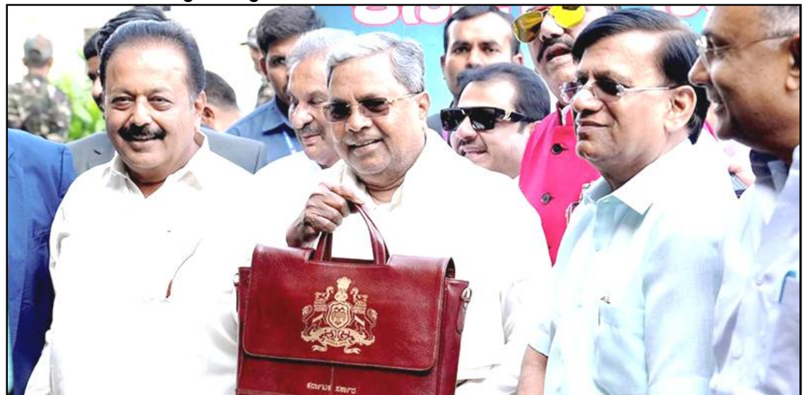
February 16, 2024 nü Bengaluru nung Karnataka Chief Minister, Siddaramaiah-i yangkhu ka nung budget papers bener state assembly-i aodang tangokba noksa nung angur.

Bengaluru, Tsüklai/February 16 (Agencies): Karnataka nung Congress sorkari budget nung waqf kiojen wazüka ayutsü, Mangaluru nung Haj ka Bhavan asütsü aser state nung Khristantem terenlok atema sen crore 330 lezmüksüogo. Chief Minister Siddaramaiah-i aniba state sorkari Waqf kiojen wazüka ayutsü atema sen crore 100 aser Khristantem terenlok atema sen crore 200 lezmüksü. Ajsüaka assembly nung opposition BJP-ibo iba