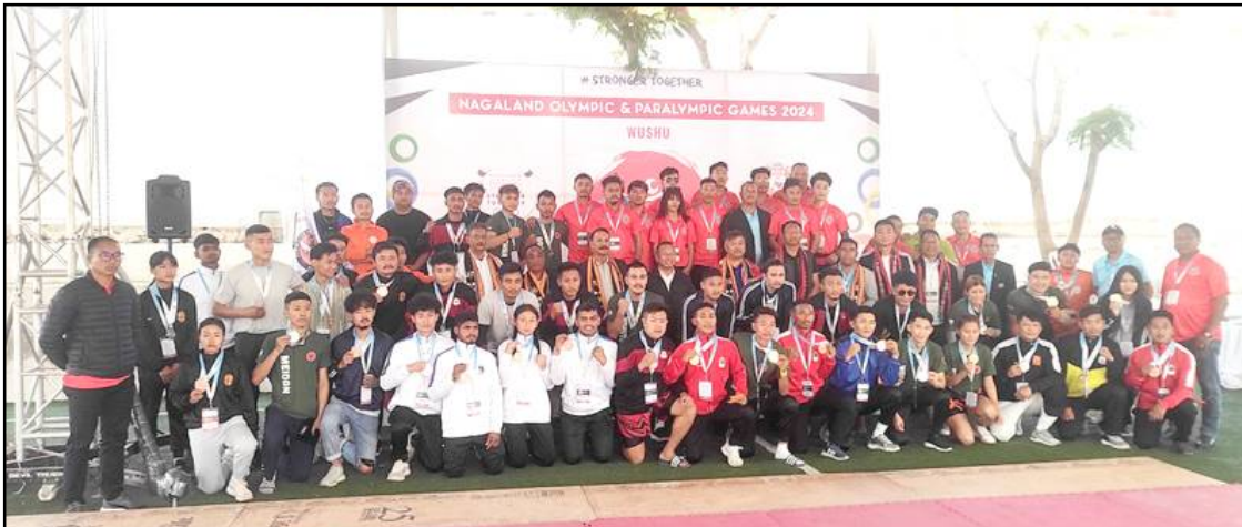
Wushu tetoktepba nung medal angurtem den NWA ketdangsürtem aser tongtipang nisungtem Hokulbarnü Arena E nung tangokba noksa ka yangi angur.

Kohima, Tsüklai/February 16 (TYO): 3rd Nagaland Olympics & Paralympic Games 2024 nung shilem ka ama Hokulbarnü Arena E, Chümoukedima nung Wushu competition aliba nung Zunheboto district-i overall champions benogo.