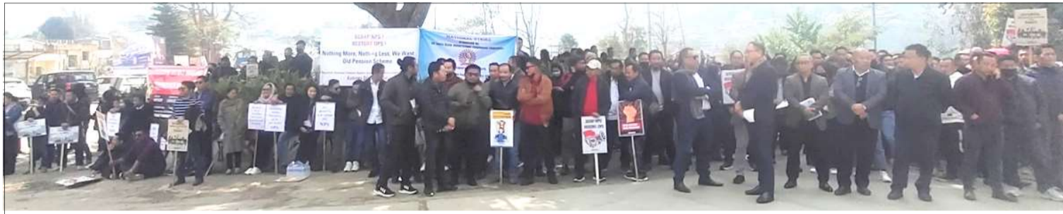
Civil Secretariat Kohima nung Nagaland sorkar mapa inyakertemi Old Pension Scheme (OPS) tenzüksü takhangba agüja lungkak aitba angur.

Kohima, February 16, 2024 (TYO): Nagaland sorkar mapang inyakertemi Hokolbarnü National Strike nung denogo aser parnoki New Pension System (NPS) agiener Old Pension Scheme (OPS) tenzüksü takhangba agütsü.