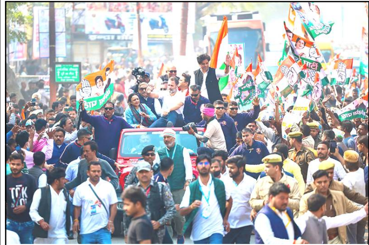
Congress lenir Rahul Gandhi aser pa pusemertem Pratapgarh district nung 'Bharat Jodo Nyay Yatra' sentong mapang tangokba noksa nung angur.

Stadium, Jammu nung lokti senden ka agiba mapang sen crore 30,500 alang project balala atema nüngshilong azüngtsütsü. Project tem ya health, education, rail, road, aviation, petroleum, aser civic infrastructure amala sector balala atema asütsü. Sentong nungsa Ato Kilonseri Jammu and Kashmir nung tang sorkar mapa nung anioker nisung 1500 nem appointment order agütsütsü. Paise, 'Viksit Bharat Viksit Jammu' sentong kübok sorkar scheme balala beneficiary tem den sensak asemtsü, ta PMO-isa metetdaksü. Maneni PM Modi-i, sen crore 13,375 alang project tem lapokba linük nung bendanga agütsütsü aser ano iba den project balala atema nüngshilong azüngtsütsü. Ato Kilonseri All India Institute of Medical Sciences (AIIMS), Vijaypur (Samba), Jammu semzüktütsü. Iba institute atema nüngshilong ya Ato Kilonseri 2019 küm February ita azüngja liasü aser iba ya Central sector scheme Pradhan Mantri Swasthya Suraksha Yojana kübok amenokogo.