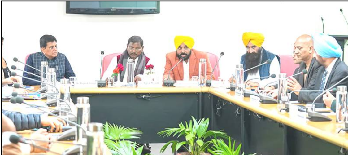
Union Minister; Arjun Munda, Piyush Goyal aser Punjab CM Bhagwant Mann nunger Chandigarh nung aluyimba lokti tentet lenirtem den sensaksemba mapang tangokba noksa nung angur.

New Delhi, Tsüklai/February 19 (Agencies): Union Ministers panel kati longkak aita aliba aluyimer lenirtem den Deobarnü Chandigarh nung ajurutepa sensaksemogo. Senden tembangba sülen Union Minister Piyush Goyal-i, Union Ministers aseme - Goyal den Agriculture and Farmer Welfare Minister Arjun Munda aser Minister of State for Home Affairs Nityanand Rai-aluyimertem ket nungi minimum support prices nung pulses, mendi aser kümba alitsü atema küm pongu asoshi sentong ka benokogo, ta ashi.