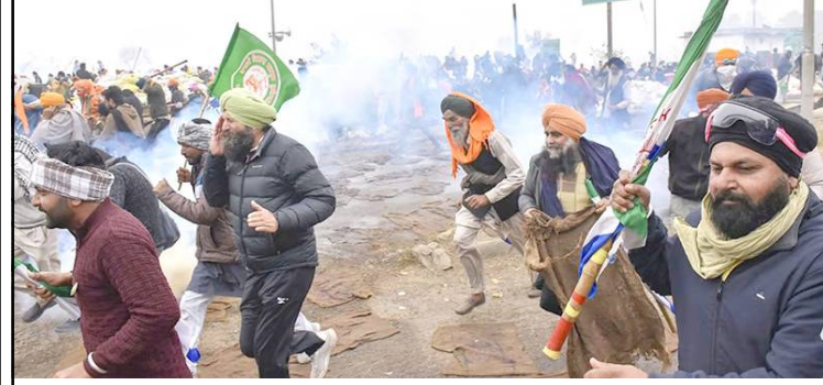
February 21, 2024 nü Patiala district kübok Punjab-Haryana Shambhu arrtsü anasa aluyimertem longkak aيتدang parnok senshidaktsütsü atema tear gas khaloktsüba ajanga parnok jenshidang tangokba noksa nung angur. Punjab aser Haryana arrtsülen aluyimertemi maneni asentenshir Bodhbar nungi longkak aitter.

Senden ghonda trok shi amenba mapang nung sorkari taruba küm pongu tashi alu nungi züsentedba chiyungtsü kar nung MSP (Minimum Support Price) agütsütsü benoka liasü, ajisüaka aluyimertemi ibaji magizük.