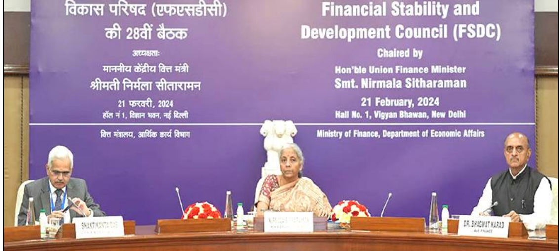
February 21, 2024 nü Vigyan Bhawan, New Delhi nung Union Finance Minister Nirmala Sitharaman, Reserve Bank of India (RBI) Governor Shaktikanta Das aser Union Minister of State for Finance Bhagwat Karad nunger Financial Stability & Development Council senden nung adendang tangokba noksa nung angur.

Anogo ishika tejaklen Akhilesh Yadav-i, Uttar Pradesh nung Congress-i menden 17 nungji tokteptsü melung nung ang Samajwadi Party-i Rahul Gandhi indang Bharat Jodo Nyay Yatra nung shilem agitsü, ta metetdakja liasü. Mongolbarnü Rahul Gandhi-i Raebareli nung iba yatra agiogo saka Yadav-i shilem magi.