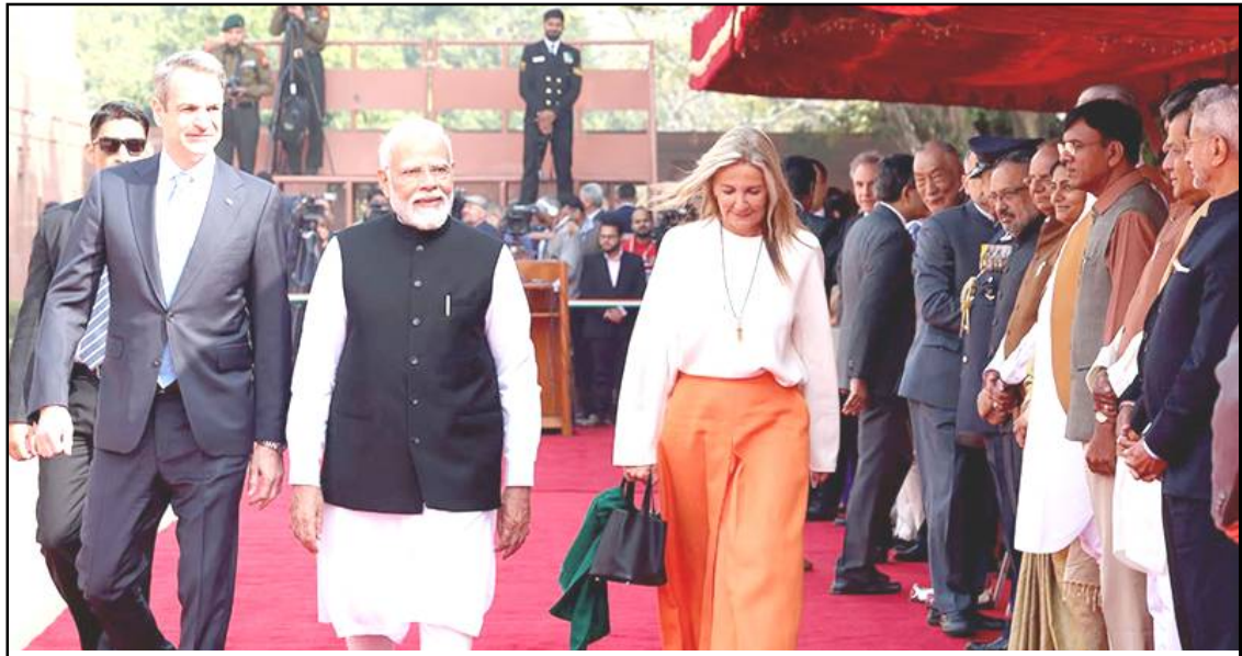
February 21, 2024 nü New Delhi nung Ato kilonser Narendra Modi, Greece Ato kilonser Kyriakos Mitsotakis aser pa kinüngtsü Mareva Grabowski-Mitsotaki nunger Rashtrapati Bhavan nung agizükdang tangokba noksa nung angur.

New Delhi, Tsüklai/February 21 (Agencies): Bodhbarnü Ato kilonser Narendra Modi-i, Greece Ato kilonser Kyriakos Mitsotakis-i India semdangba ajanga linük ana tsüngda asalentong tsütsü tesendaktep tashi itshitsü, ta metetdaksü.