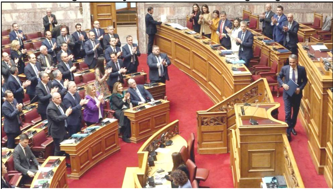
February 15, 2024 nü Athens nung Marriage Bill atema Parliament nung o entepba mapang Greek Ato kilonser, Kyriakos Mitsotakis-i jembitsü atema sabangi arudang tangokba noksa nung angur.

February 23, 2024: Tawa Greek Parliament nung tetsür o tetsür na mesüra tebur o tebur na kiyimtsü melatsü atema vote agütsütepba agizükba Arogoi aitsüogo.