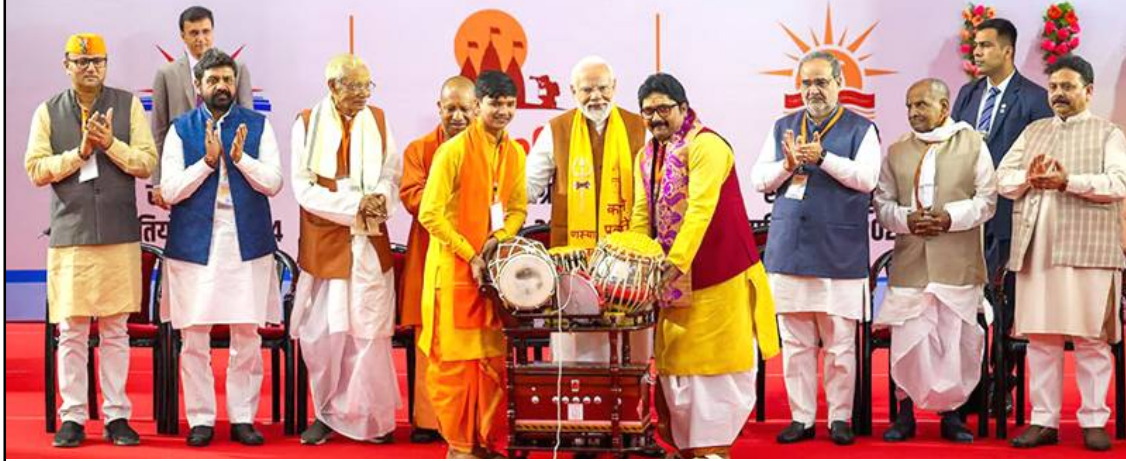
February 23, 2024 nü Varanasi nung aliba Banaras Hindu University nung sempet agütsüba sentong nung Ato kilonser, Narendra Modi adenba noksa nung angur. Kasa noksa nung Uttar Pradesh Chief Minister Yogi Adityanath-a angur.

स्वतंत्रता भवन काशी हिन्दू विश्वविद्यालय, वाराणसी