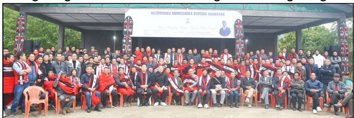
Mongsanger semchir mezüngbuba mungdang Ungma Tourist Centre nung akadang sentong nung shilem agirtem aser adenertem telok noksa tangokba angur. Mokokchung, 23rd, 2024.