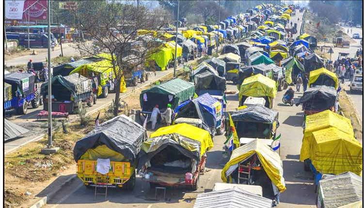
February 23, 2024 nü Patiala district kübok Punjab-Haryana Shambhu arrtsü nung aluyimertemi 'Black Day' ayongüka longkak aitdang tangokba noksa nung angur. Khanauri border arrtsü nung longkak aiter aluyimer ka khasetba anema parnoki Black Day sangdonga longkak ait.

ya tembangdaksütsü," ta metetdaksü. Osangbener den jembidang Congress lenir kati, March 2 nü Kamal Nath-i Gwalior nungi iba Yatra nung shilem agitsü aser March 6 tashi pai shilem agitsü, ta metetdaksü. Madhya Pradesh nunga iba yatra ya March 2 nü tenzüka Gwalior, Shivpuri, Guna, Rajgarh, Shajapur, Ujjain, Dhar aser Ratlam nung agiba sülen March 6 nü Rajasthan nung tenzüksü. Tawa Nath aser par jabaso nati Congress toktsür BJP nung adentsü ta osang proka liasü. Talisa BJP State otongdar, Narendra Saluja-i social media ajanga Kamal Nath aser Nakul Nath na noksa den 'Jai Shree Ram' ta lemsatepba sülen iba osang tali proka liasü. Kamal Nath aser par jabaso Nakul Nath nati BJP nung denra Congress MLA tem aser taoba mapang MLA tem 12-ia BJP nung adentsü, ta osang ka ajanga metetdakja liasü. Kamal Nath aser par jabaso nati BJP nung madenyonga Congress MLA tembo aikati BJP nung denogo.