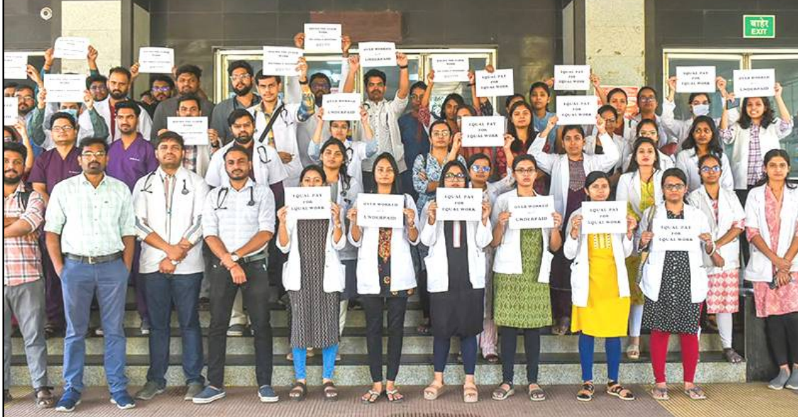
February 23, 2024 nü Solapur nung aliba Chhatrapati Shivaji Maharaj Government Hospital kima Maharashtra State Association of Resident Doctors (MARD) nung züngsemtemi 'allowance' atema takhangba agüja longkak aitdang tangokba noksa nung angur.

tazüng 7,000 atema Jagan-i longkak aita liasü," ta lai ashi. Andhra Pradesh Congress Tirisa, "Tang aliba sorkari taoba mapang nungbo sorkar mapa lakh 2.30 atema nisung shimtsü ta nangzüka liasü. Parnokisa küm shia job calendar agütsütsü ta nangzüka liasü. Parnoki tesayur 23,000 shimtsü atema DSC notification agütsütsü ta sangdonga liasü. Sorkar tasenba tentetba sülen küm pongu jungogo saka item tenangzükba ka danga mapa küma meinyak," ta metetdaksü. Jagan Reddy aser Kumbakarna na medemdanga Sharmila-i, "tesüiba küm pongu tashi pa amoi oa liasü asü?" ta asüngdang. Jagan Reddy kümsük mapang nung mapa lakh 1.20 atema dang nisung shima liasü, aser parnok teimbaka sorkar volunteers liasü, ta lai ashi. "Tangbo kaketshirtem aser mapa bushirtemi 'kechiba yamai ashioktsür?' ta asüngdang. Küm aika item exam atema nisung lakh aikati sen lakh aika indokogo," ta lai ashi.