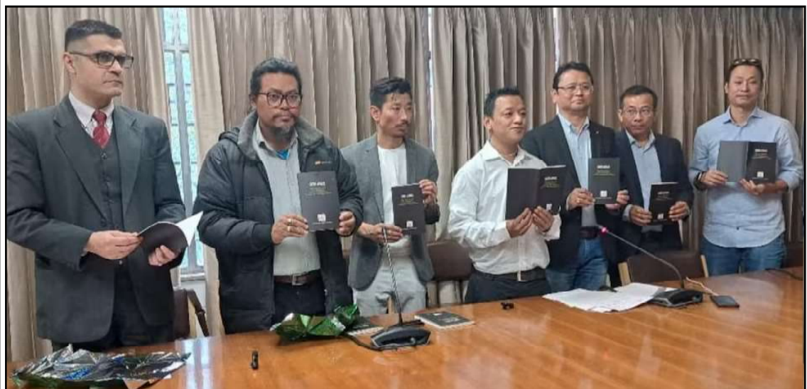
Alima nung Meitei nunger network Meitei Alliance-i Centre, state sorkar aser Manipur nung Kuki National Organisation (KNO) o United People's Front (UPF) Suspension of Operations Agreements (SoO) tsüingda sign sütepa aliba agientsü takhangba agütsüogo. Kuki nunger teloktemi SoO nung aliba Agreed Ground rules alema teti inyaksangshir ta Meitei Alliance-i metetdaksü.

Delhi University nung graduates-i Vasudhaiva Kutumbakam sobaliba benshia alima ajunga nung tenüing yanglutetsü ayongzük.