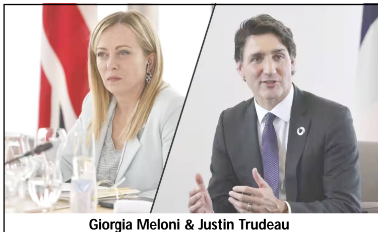
Giorgia Meloni & Justin Trudeau

Kyiv, Tsüklai/February 24 (Agencies): Russia aser Ukraine tsüngta rara tenzüker küm ana ajungdang Ukraine den dena lir ta sayutsü mechi Italy Ato Kilonser Giorgia Meloni aser Canada Ato Kilonser Justin Trudeau na Honibarnü Kyiv tongogo. European Union commission tekolak, Ursula von der Leyen-a Kyiv tongogo.