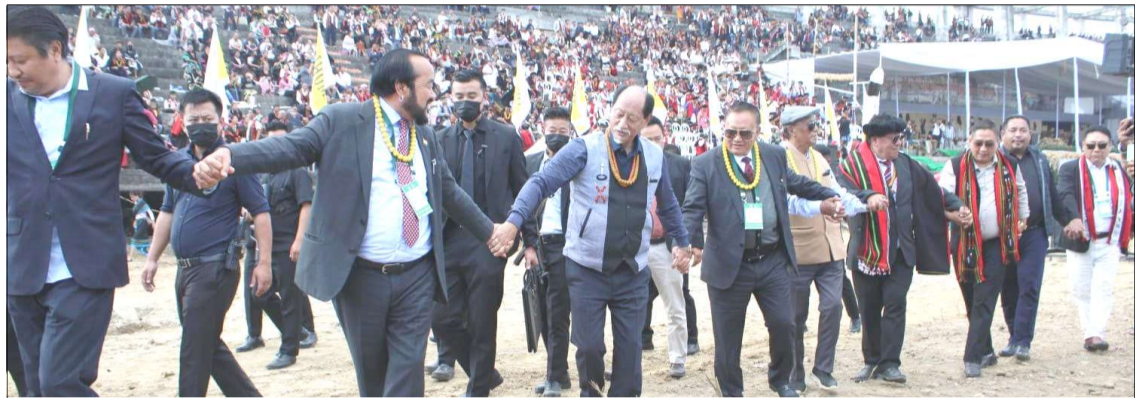
February 24, 2024 nü DDSC stadium nung Chief Minister Neiphiu Rio den Deputy Chief Minister tem- Y. Patton o T R Zeliang den külem MLA temi Sekrenyi benjung nung Unity dance tsüngsangba angur.

Dimapur, February 24, 2024 (TYO): Angami nungertem asoshi tongtipang benjung Sekrenyi tanü Dimapur nung kanga longsotepa mongogo.