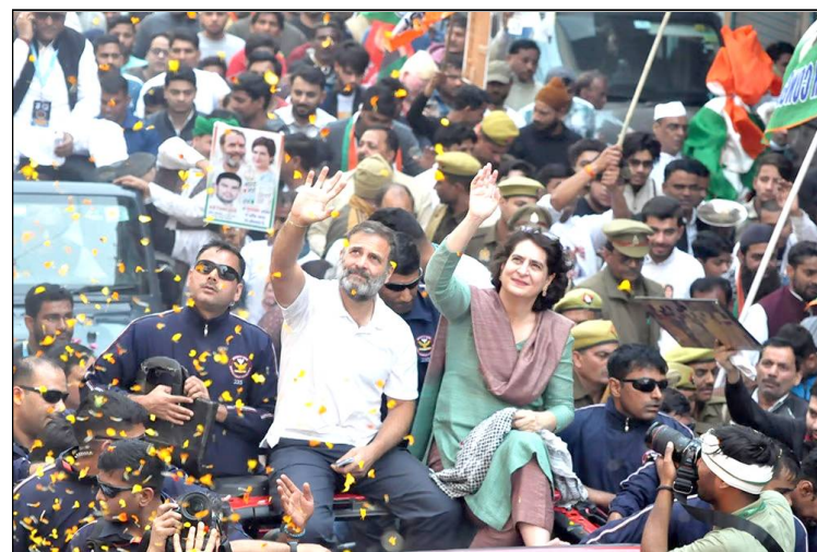
February 24, 2024 nü Maradabad nung Congress lenir Rahul Gandhi aser Priyanka Gandhi Vadra nati 'Bharat Jodo Nyay Yatra' nung shilem agidang tangokba noksa nung angur.

Tang Indian Penal Code nung Arrla 304A kübok gari agi nisung tsüksetra küm 2 tashi tepuokdak ayutsü akok aser senchi achitsü. Ajisüaka özüng tasenba kübokbo küm 10 tashi tepuokdak ayutsü.