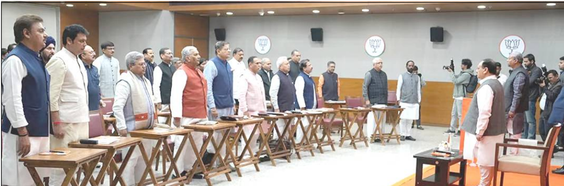
February 24, 2024 nü New Delhi nung BJP National Tir, J.P Nadda den party lenirtem taruba Lok Sabha elections atema ayongzükba senden ka nung tangokba noksa nung angur.

Uttar Pradesh nung Congress-i menden 17 nungi tokteptsü aser tanüingba menden 63 nungji Akhilesh Yadav-i aniba Samajwadi Party (SP) den INDIA teloktep nung densema aliba tanga party tem nungi candidates-i tokteptsü.