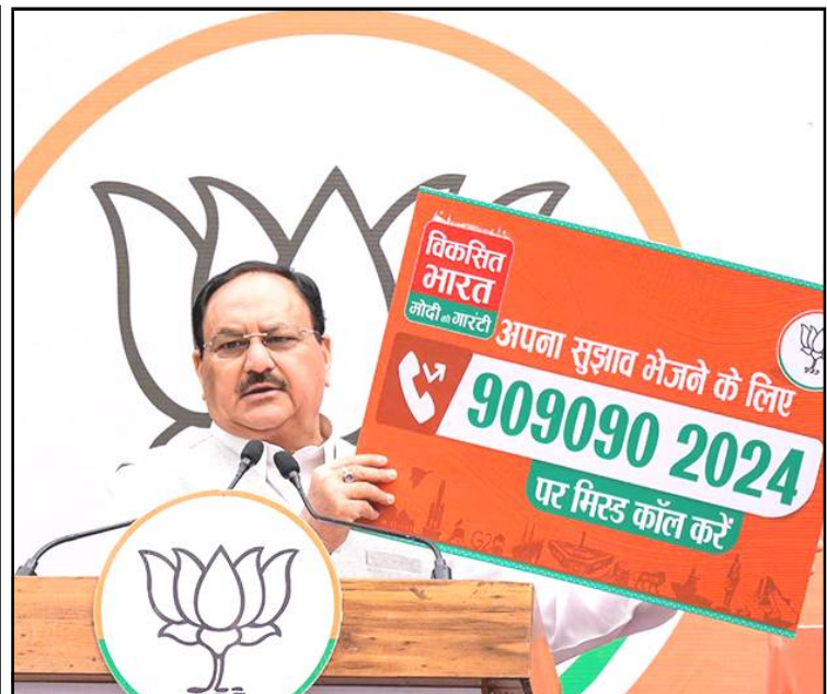
February 26, 2024 nü New Delhi nung BJP National Tir, J P Nadda-i 'Viksit Bharat Modi Ki Guarantee Rath' tenzüksüdüng tangokba noksa nung angur.

Lanurtem mangdangji pa nukjidong asütsü, ta shia pai, "Tangbo India-i mangdang tulu ayur aser item mangdang ataloktsü atema amang-sangwa methitemi inyaker. Nenok mangdang, meranga inyakba aser kü temelungtetbatemji Viksit Bharat tenangzükba asütsü," ta metetdaksü.