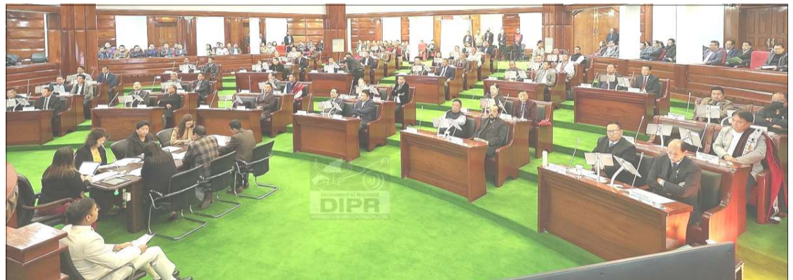
February 26, 2024 nungi 14 buba Nagaland Legislative Assembly indang session pezübuba tenzuka agiba noksa nung angur.

Kohima, February 26, 2024 (TYO): State sorkari Centre dang Indo-Myanmar arrtsü atsüdagtsüba lemtet meyipa reprangshitsü aser Free Movement Regime (FMR) magientsü mepishiogo ta Nagaland Governor La. Ganesan-i ashi.