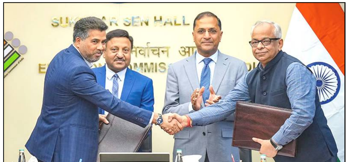
February 26, 2024 nü New Delhi nung Election Commission of India aser Postal department nati Voters awareness atema tezüngzüktep agiba sentong nung Chief Election Commissioner Rajiv Kumar aser Election Commissioner Arun Goel na den Deputy Election Commissioner Manoj Kumar Sahoo aser Department of Posts Secretary, Vineet Pandey nung tangokba noksa nung angur.

Kejriwal-isa, tanga state tem ama masü saka yangi Delhi nungbo nürburtemi power supply methitemi angur, ta metetdaksü.