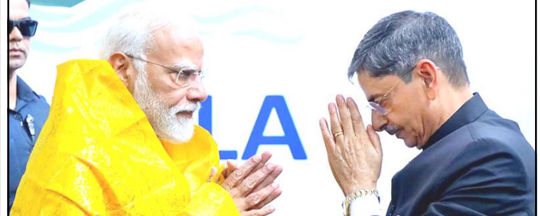
February 28, 2024 nü Thoothukudi nung Tamil Nadu Angh, R.N Ravi-i Ato kilonser, Narendra Modi agizük dang tangokba noksa nung angur. Bodhbarnü Thoothukudi nung Modi-i terenlok project aika semzüktsüogo.

Astronaut tem anünglaki meyok tsüngda space agency-i, parnok kechi timtem makai tur meyipa alutsü atema tetendangba balala agitsü.