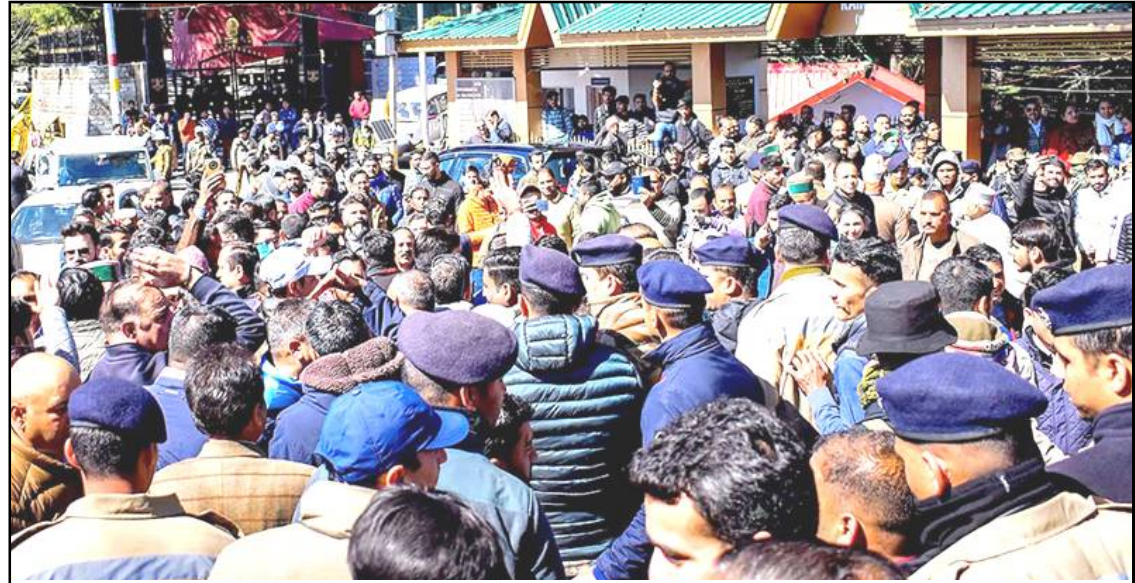
Shimla, February 28, 2024: Bodhbarnü Himachal Pradesh Legislative Assembly kima Congress aser BJP nung inyaktertem aika adenshiba sülen tensa azüoktsü atema security sepaitem yokba sülen tangokba noksa nung angur.

Shimla, Tsüklai/February 28 (Agencies): Himachal Pradesh nung Rajya Sabha election agidang Congress MLA temi tanga party nem vote agütsüba aser minister, Vikramaditya Singh-i anenba sülen Congress sorkar anokshi tenzükogo.