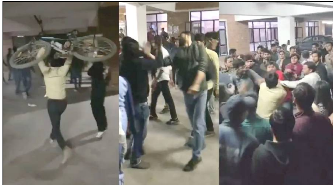
New Delhi, March 01, 2024: Brihostibar aonung Jawaharlal Nehru University (JNU), Delhi nung Election committee züngsemtem shimba nungi mangatettep adoka Akhil Bharatiya Vidyarthi Parishad (ABVP) aser Left pusemba teloktem nungi kaketshirtem raradang tangokba noksa nung angur.

Arunachal Pradesh, Punjab, Himachal Pradesh aser West Bengal tesem kar nungbo maximum temperatures ji normal range nung asütsü, ta IMD-isa metetdaksü. South India nung February ita talemtibaji taküm February ita liasü aser central India nunga February ita nung akhi ama masü saka takümbo talem liasü. IMD-isa, March ita tom süiba mapang nungi tenzüka India tesem aika, talisa Andhra Pradesh, Telangana, north interior Karnataka aser southern Maharashtra nung kanga tatsük asütsü, ta metetdaksü.