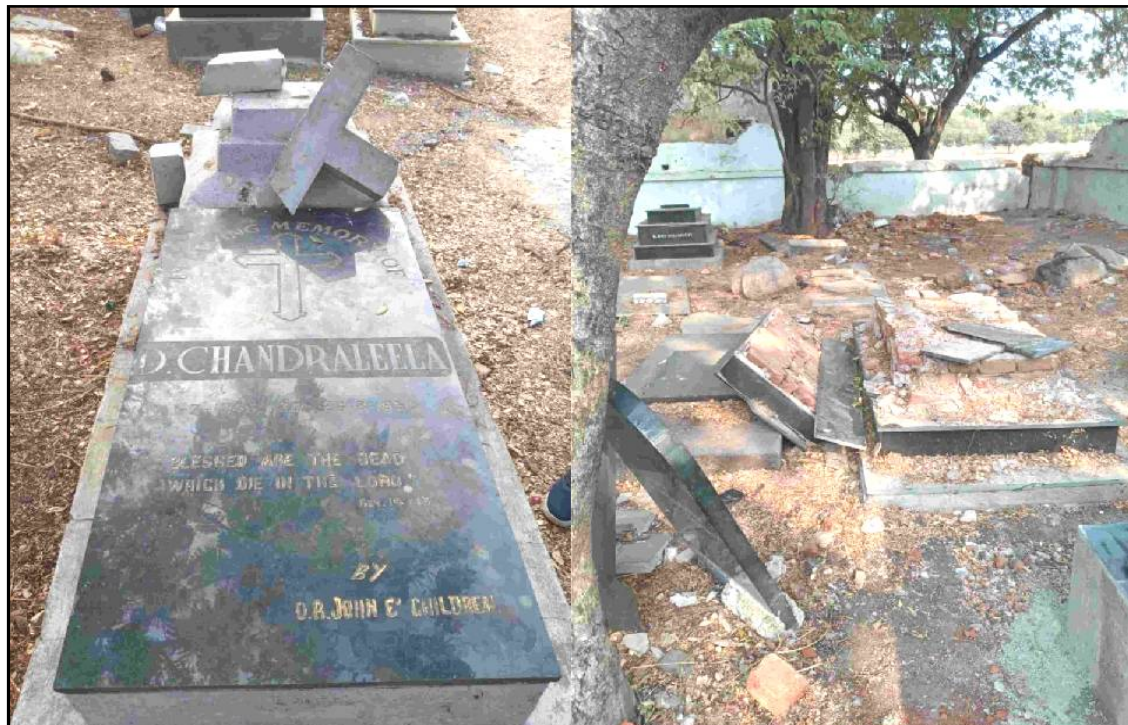
Telangana state kübok Secunderabad nung nisung kari Khristantem mang aremba leper ka nung mailung aika raksaja aliba noksa nung angur. February 21, 2024 nü mejangjaba nisung kari St. John Arogo cemetery raksatsüba tatalokba Khristantemi aitsüba den külemi ketdangsertem dang aibelenertem aputsü takhangba agütsüogo. February 13 nüa Hindutva telok kati Telangana kübok Rangareddy district nung Methodist Arogo Tenla ki ka raksaja liasü.