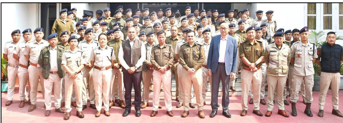
BPR&D, MHA kübok Nagaland Police ajanga New Criminal Laws asem - Bharatiya Nyaya Sanhita (BSN), Bharatiya Nagarik Suraksha Sanhita (BNSS) aser Bharatiya Sakshya Adhinyan (BSA), 2023 atema anogo pongu TOT course sentong ka Rhododendron Hall, Police Complex, Chümoukedima nung March 1, 2024 nü tenzükba liasü. Iba TOT course ya ASI nungi Addl, SP tashi police ktdangsur atema ayongzükba lir.

Iba osang nungya license indang kibur tenüing, License No, UIN No, type of Arms License No, License tesüsa renew asüba anogo aser injang kwi ali, itemji agütsütsü.