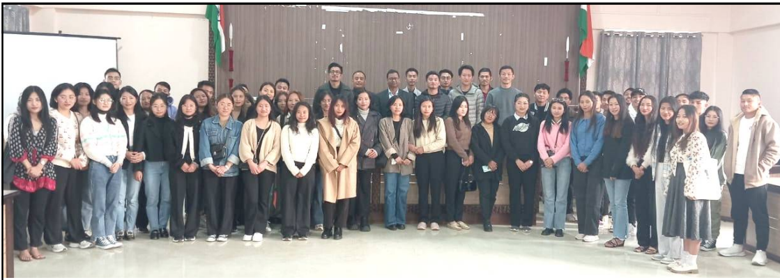
Shisalen Riji Coaching Center semzükba aser tejangrartem asoshi orientation sentong ka March 1, 2024 nü Deputy Commissioner, Mokokchung indang Conference Hall nung agia liasü.