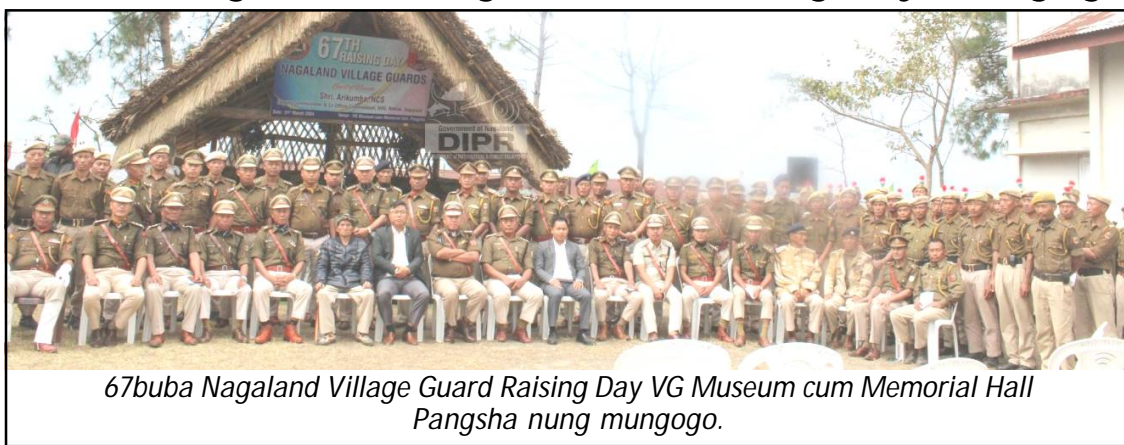
67buba Nagaland Village Guard Raising Day VG Museum cum Memorial Hall Pangsha nung mungogo.

Dimapur, Metsüremi/March 2 (TYO): 67buba Nagaland Village Guard Raising Day March 1 nü Noklak district kübok VG Museum cum Memorial Hall, Pangsha nung agiogo. Iba sentong ya 'the guardian of the frontier villages' omen nung ajemdaker agia liasü.