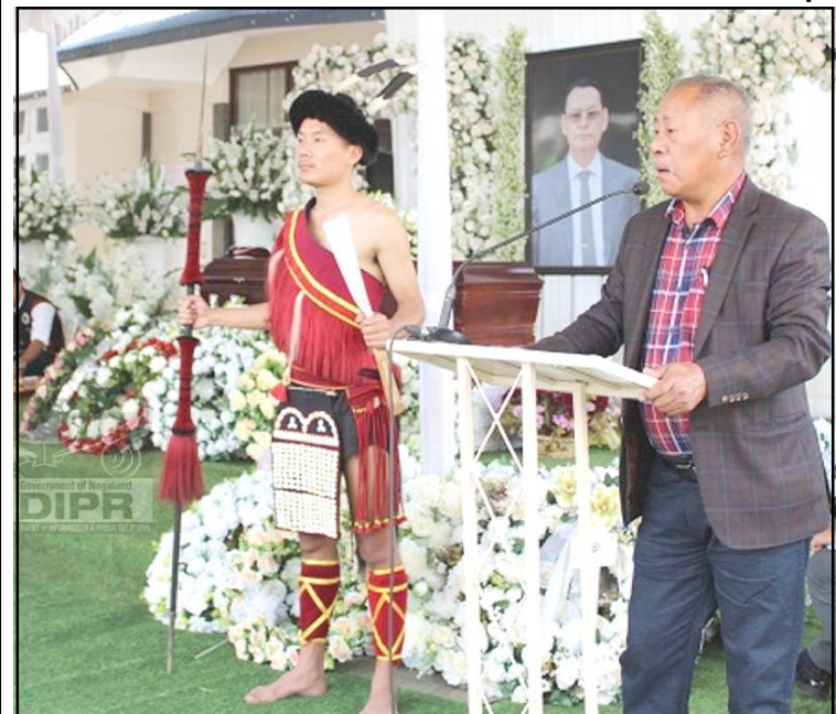
NSSB, mendenbuba, Sedevikho Khro-i o jembiba mapang tangokba noksa nung angur.

Dimapur, Metsüremi/March 2 (TYO): NSSB züngsem asür Er. Ghukhui Zhimomi den asüpila sentong March 2 nü Diphupar B Relkamenon nung pa kidang agiogo.