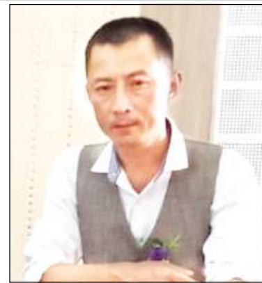
Late. Molodongba Ozükum 03 March 2021

Na iba lima toktsür küm asem süitema aruaka nü temeim aser mapa tajung onoki teti bilemteter. Na onok den taküm meliaka nü shisatsü tajung aser temeim onok den teti lir.