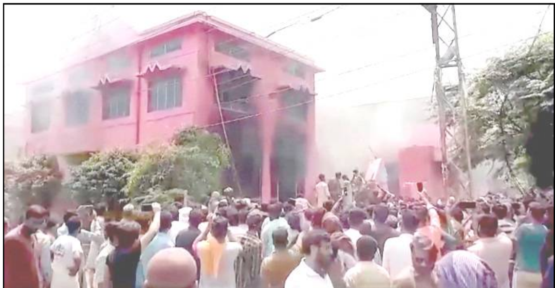
Pakistan kübok Jaranwala nung Muslim nunger longkak aiter temi Tenla ki ka rongdoktsü dang tangokba noksa nung angur.