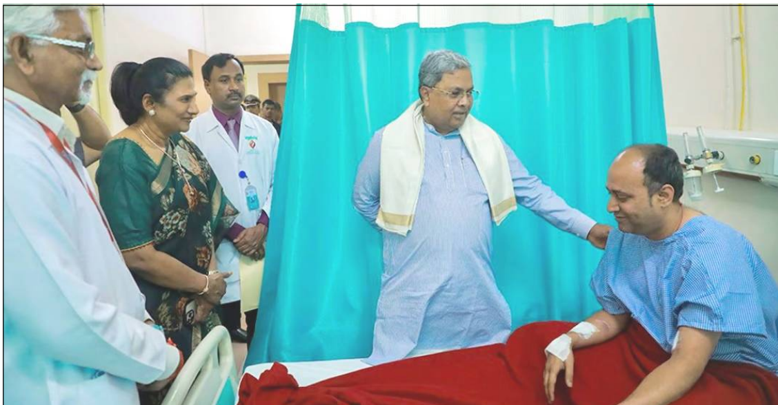
March 02, 2024 nü Bengaluru nung Karnataka Chief Minister, Siddaramaiah-i Rameshwaram Cafe nung bomb apokba lendong nung yirur ka semdangba mapang tangokba noksa nung angur. Hokolbar nikongdang bomb apokba lendong nungji nisung 9 yirua liasü.