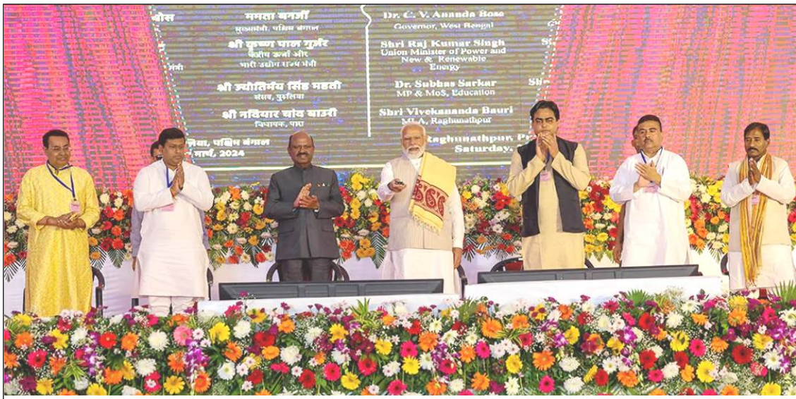
March 02, 2024 nü West Bengal kübok Nadia district nung Ato kilonser Narendra Modi-i terenlok project balala semzüksüdüang tangokba noksa nung angur.