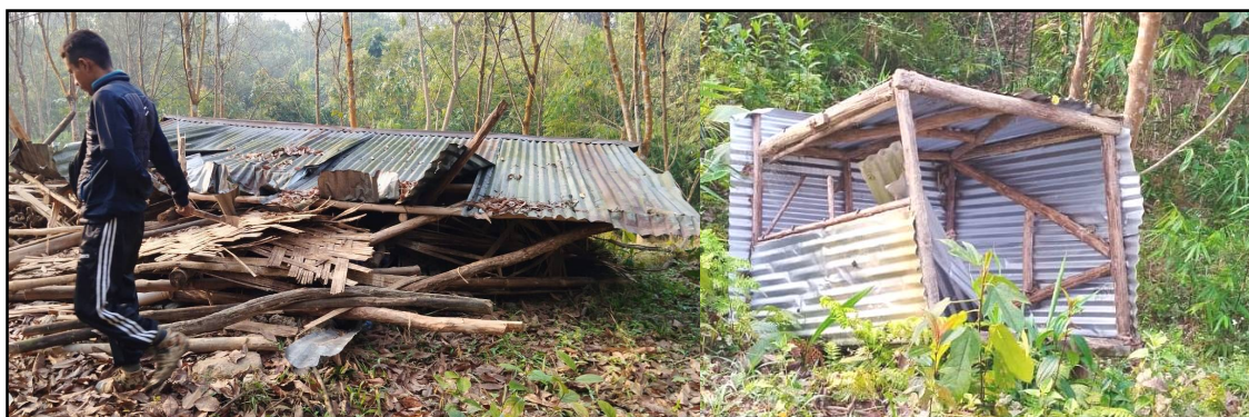
March 1, 2024 aonung Mokokchung district nung Longchem sub-division kübok Lizo yimdak arem shidi adoka farm aser ki o jen raksaja nübur rokongdar. Iba ama arem shidi mapang aben yimsüng aser farm ki o jen raksa dang sorkar-i nübur nem teyari agütsüsüla.

asütsü. Anungji iba ama temulung melemteti ali ayokba aser aliba lira tekeratiba nung ketdangsürtem dang revenue.dc.kohima@gmail.com ajanga metetdaktsüsü ayongzüker, ta sangdong ajanga ashi.