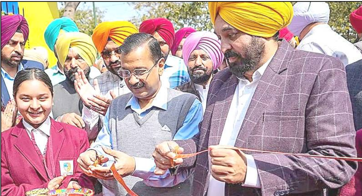
February 03, 2024 nü Ludhiana district nung Delhi Chief Minister Arvind Kejriwal aser Punjab Chief Minister Bhagwant Mann nati School of Eminence semzüksüsdang tangokba noksa nung angur.

BJP-i pa masü saka Praveen Khandelwal tenüng ang sangdong. Taoba mapang Union health minister, Vardhani, "Küm 50 tejaklen ni GSVM Medical College, Kanpur nung MBBS azüngba mapang nung sensakertem aser nüngdakbapurtem yaritsü tejangraba nung kü omenji 'meimchirtem tenzüksü' liasü," ta metetdaksü. MP, Vardhan-i, "Ni nüburttem tenzüksü jangraba ama tenzükogo, ta ni mesasai shiteter. Ni Delhi Health Minister-a inyakogo aser Union Health Minister anaben inyakogo," ta ashi.