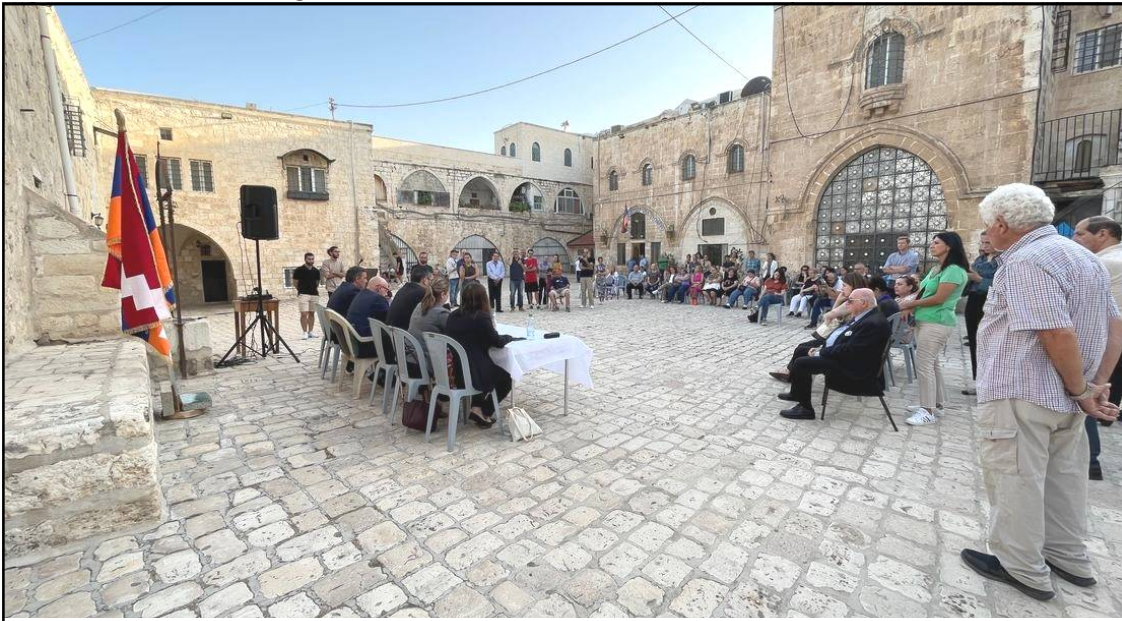
Jerusalem kübok Armenian Quarter nung sentong ka agidang tangokba noksa nung angur.

March 03, 2024: Yirusalem nung ali tezüngzüktep ka agiba ajanga Yirusalem yimti tejenba nung akhidang nungi aliba Armenia nung Khristantem meindoktsüa tensa ka nung lir, ta bilema Yirusalem nung Arogo balala nungi lenirtemi iba tezüngzüktepji anema nokdaker.