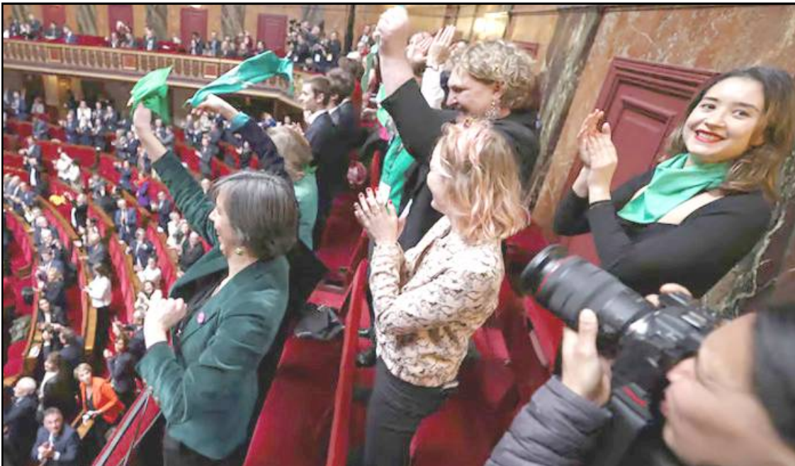
France indang constitution nung tetsür temi tanur raksa indoktsü asoshi temeden inoktsü bill ka agizüker Palace of Versailles, Paris nung March 4, 2024 nü pelatepba noksa nung angur. France nung abortion ya constitution agi melaba temeden ka Hombarnü kumogo.