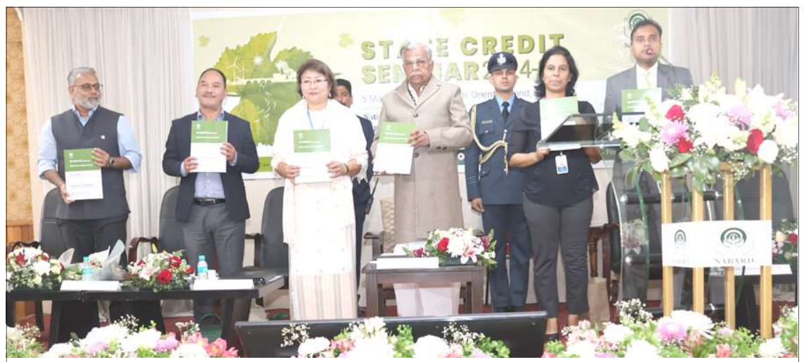
Hotel De Oriental Grand, Kohima nung NABARD-i ayongba State Credit Seminar nung Governor La Ganesan-i State Focus Paper 2024-25 sayatsüdang agiba noksa ka angur.

Kohima, March 5, 2024 (PRO Raj Bhavan): NABARD ajanga ayongzükba State Credit Seminar nung Nagaland Governor La Ganesan-i tetushi süa jaoker ka ama shilem agiogo.