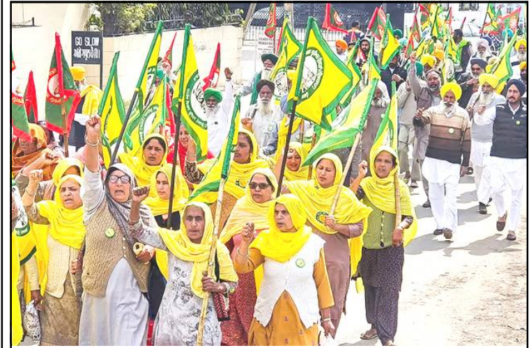
Patiala nung 'Delhi Chalo' longkak aitba sentong nung shilem ka ama Centre sorkar anema longkak aitba mapang tetsür aluyimertemi shilem agiba noksa nung angur.

jembiba mapang March 10 matong tsüngda India nunger sepaiem meyipa yoktsü ta shia liasü. Maldives nung humanitarian teyari aser medical evacuation service agütsütsü atema India indang sabang asem amenoka lir aser iba ya achaayangtsü asoshi military personnel 88 amenoka lir. Local media sangdong balala ajanga ashiba agi, Maldives-i taoba hopta medical evacuation atema tayimtsü amshitsü asoshi Sri Lanka den tenangzüktepba ka yangluogo aser iba ajanga India nunger sepaiem kechisüdir süaka mintoktsü atema jenjang agiba sayur. Tangar dak memetaloki alitsü ya pai kanga tongtibangsa agir ta shia Muizzu-i, Maldives nungi India nunger sepaiem mintokba den linük anüolentiplen maritime tesemtem meyipa agitsü kanga tongtibang ta ashi.