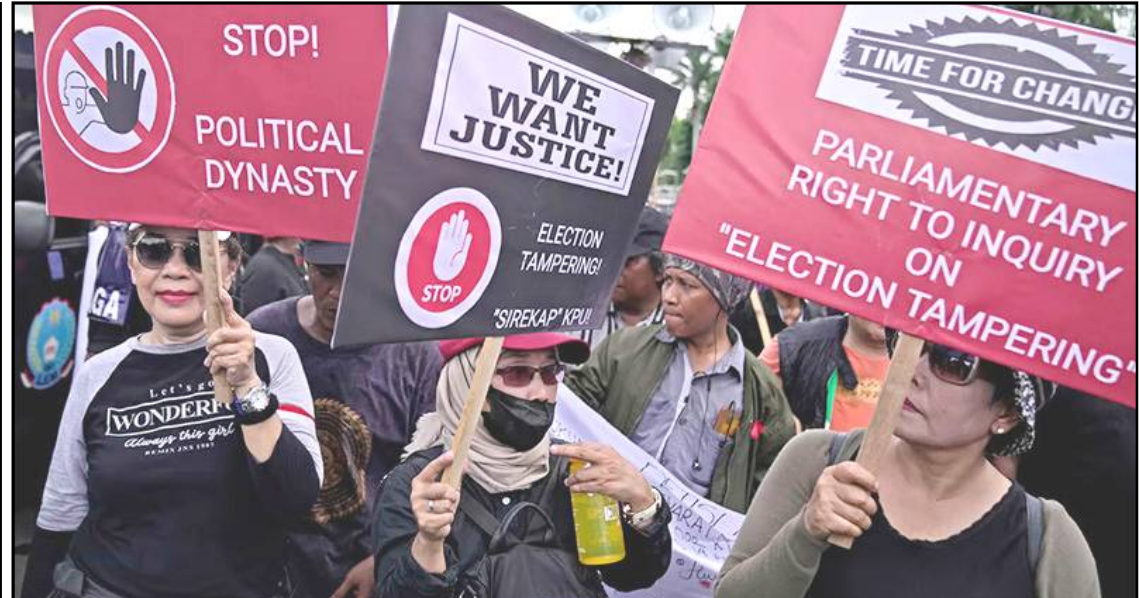
Indonesia yimtiba Jakarta nung aliba parliament jakdang nüburtemi zülu balala bener longkak aitba noksa nung angur. February 14 tir election nung tim masüba mapa inyak ta tai tonglokja aliba mechi nüburtemi Indonesia Tir Joko Widodo atsüingdoktsü takhangba agütsü longkak aiter.

Pa sübokrem agiba, nüburtem indang rongsen ochimeshi amshiba amala ken o balala nung aija bushisüingdangdar.