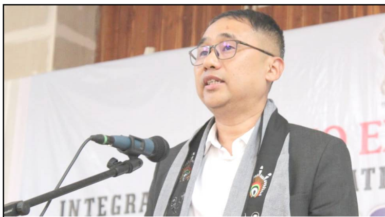
Dimapur Government College nung Photo Exhibition alidang Revenue Officer, Dimapur, Vinekho Tetso-i o jembiba noksa nung angur.

Dimapur, Metsüremi/March 05 (TYO): Seva Sushasan & Garib Kalyan kum toku aser Systematic Voters Education and Electoral Participation (SVEEP) indang sentongtem temaba jenjangi ajungkettsü nukjidong nung Photo Exhibition sentong ka March 5, 2024 nü Dimapur Government College nung agia liasiü. Iba sentong ya Central Bureau of Communication, Field Office Kohima, Ministry