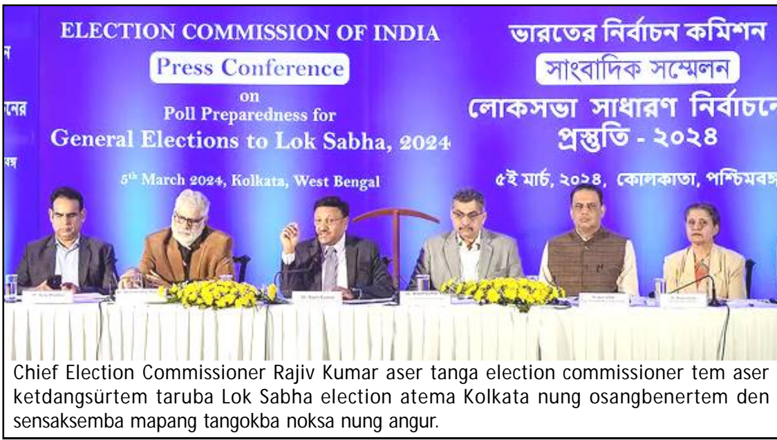
Chief Election Commissioner Rajiv Kumar aser tanga election commissioner tem aser ketdangsürtem taruba Lok Sabha election atema Kolkata nung osangbenertem den sensaksemba mapang tangokba noksa nung angur.