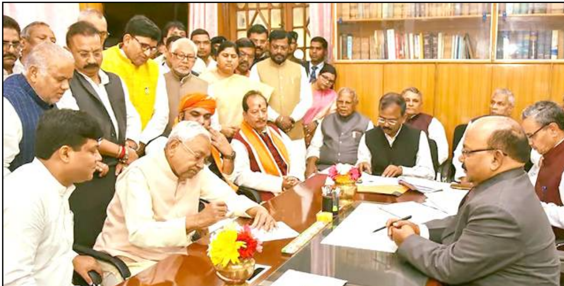
Bihar Chief Minister Nitish Kumar-i Patna nung MLC election atema nomination file asüba noksa nung angur.

Shankar Chaudhary nem Gandhinagar nung Hombarnü nikonksütsü agütsüogo. Speaker indang office-i resignation agizükba jangjatsüogo. Modhwadia ya Gujarat nung yimden yimsüsürtem rongnung tejentiba ka aser opposition lenirtem rongnung ajak dang tongtibangtiba ka liasü, shiba Congress party den küm 40 shi sendaktepa aruogo. Pa ya opposition lenir aser state unit Tir liasü. 2022 küm election nung pai BJP lenir Babu Bokhria tsükdakja liasü. Chirag Patel aser CJ Chavda na December aser January ita mapa nungi anenba sülen Modhwadia ya taoba ita pezü tsüngda MLA mapa toktsüba Congress lenir tasembuba kümogo.