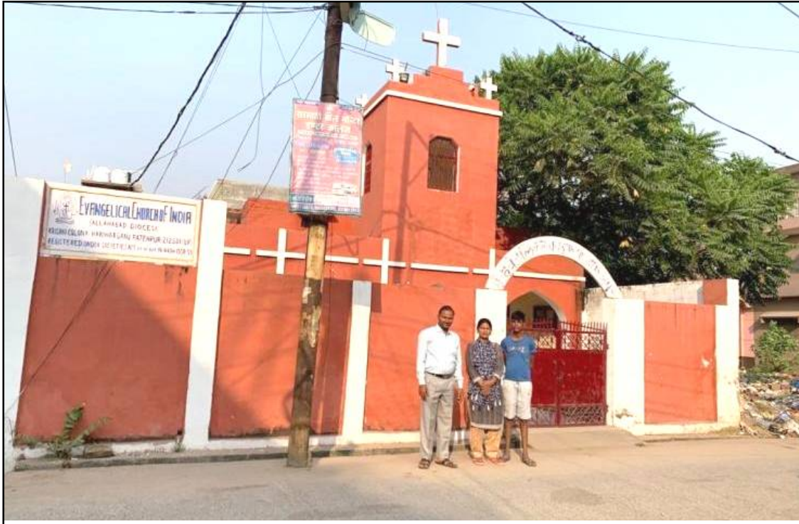
Uttar Pradesh kubok Fatehpur district nung aliba Evangelical Church of India (ECI) Tenla ki noksa nung angur.

March 06, 2024: Article 14 teloki sangdong ka ajanga Uttar Pradesh nung police-i tesüiba küm ka tsüingda Fatehpur district nung aliba Khristan reju pezü anema First Information Reports (FIRs) aika benokba aser nisung 200 dak tema apuba metetdaksü.