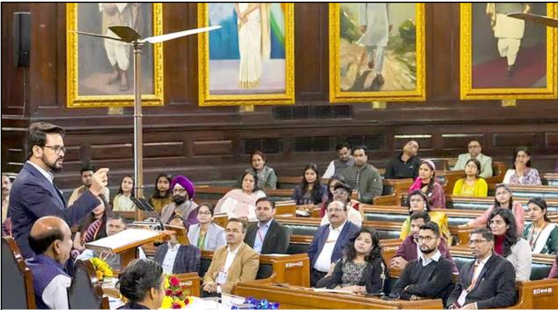
March 06, 2024 nü New Delhi nung National Youth Parliament Festival nung Union Minister for Youth Affairs & Sports, Anurag Thakur-i jembidang tangokba noksa nung angur.