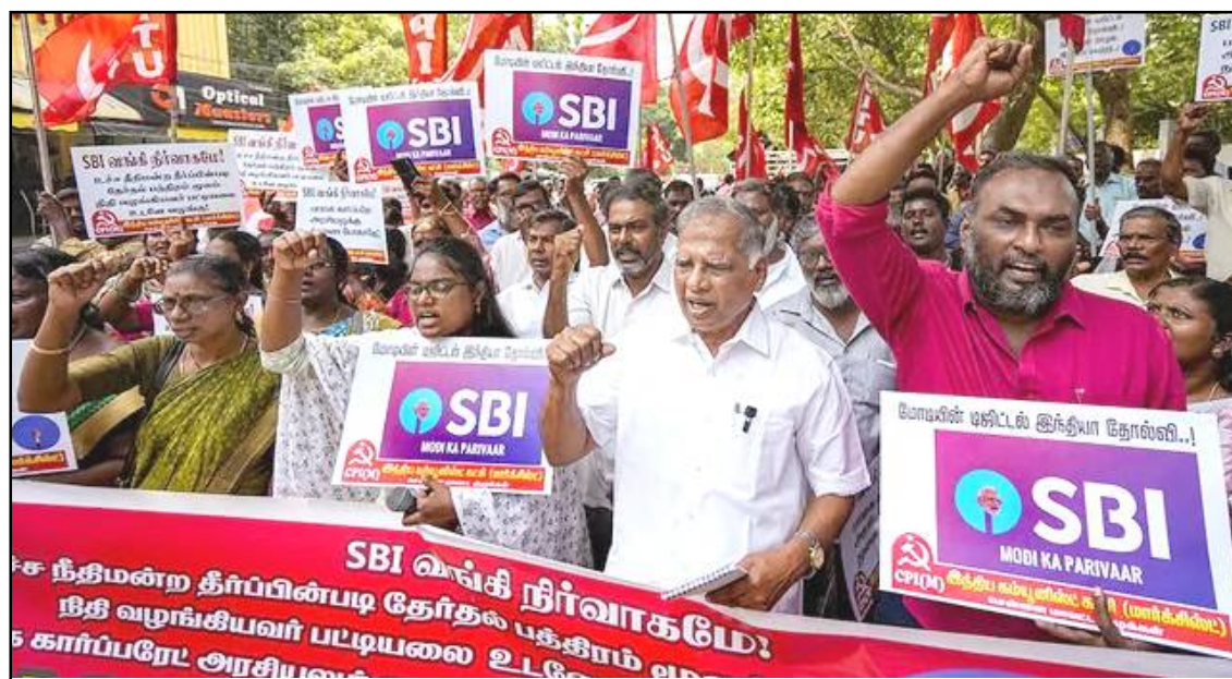
Chennai, March 06, 2024: State Bank of India (SBI)-i electoral bond osang sangdongtsü atema Supreme Court dang mapang tali meshisemba anema Bodhbarnü Chennai nung CPI(M) nung inyakertermi longkak aيتدang tangokba noksa nung angur.