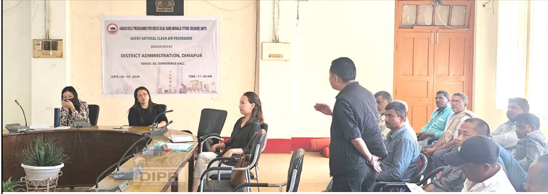
Longru yanglur, litem ayoker aser longsang menüngertem den Deputy Commissioner, Dimapur indang Conference Hall nung March 6, 2024 nü awareness sentong ka agidang tangokba noksa nung angur.

Dimapur, Metsüremi/March 06 (TYO): National Clean Air Programme kübok longru yanglur, litem ayoker aser longsang menüngba unit tem asoshi awareness sentong ka District Administration, Dimapur ajanga Deputy Commissioner, Dimapur indang Conference Hall nung March 6, 2024 nü ayongzükba liasü.