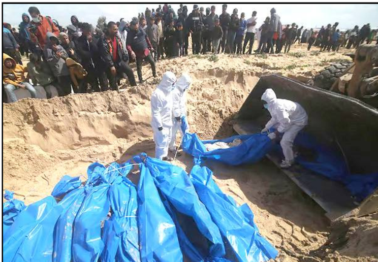
Gaza Strip kübok Khan Younis nung Israel sepaitemi amakdang asürtem aremba sentong nung Palestine nunger dena aliba noksa nung angur.

shimtsü atema mapang kanga petdaka akümtsü. Tenokdangba agütsür liaka lai maneni nüboyimba sentong nung shilem agidar aser election nung tokteptsü mulungteter lir. 2023 küm sorkar aser opposition nati tenangzüktepa ka yangluogo aser iba ajanga 2024 atema telok anapronglai agizüktetba inyakyim kar benokogo. Iba tenangzüktepa yangluba sülen US-i Venezuela indang oil sector nung tenokdangba agütsür aliba kar aginja liasü. 2018 küm election ya ozüng alema lir ta shia Washington-i tenokdangba agüja liasü. January ita Venezuela nung SC-i opposition candidate Machado nem tenokdangba agütsüba agüzükba sülen US-i ano tenokdangba agütsüshitsü amokmerena liasü.