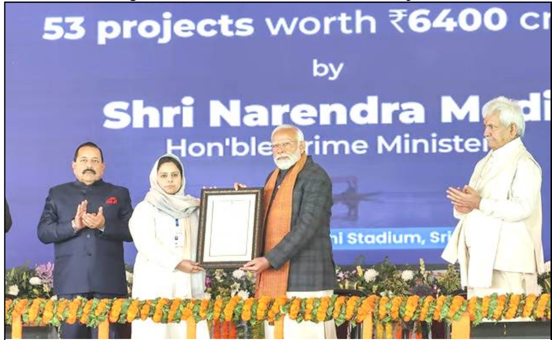
March 07, 2024 nü Srinagar nung 'Viksit Bharat, Viksit Jammu & Kashmir' sentong nung Ato kilonser Narendra Modi, Union MoS for Science & Technology Jitendra Singh aser J&K Lt. Governor, Manoj Sinha nunger tangokba noksa nung angur.

New Delhi, March 03 (Agencies): Brihostibarnü Jammu & Kashmir kübok Srinagar nung lokti senden ka nung jembidang Ato kilonser, Narendra Modi-i, Kashmiri nunger melungjang koktettsü atema sorkari maneni inyaktsü, ta metetdaksü.