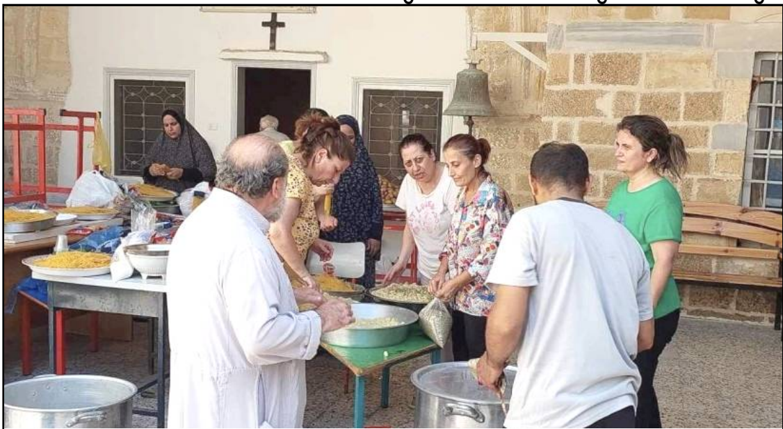
Gaza nung Saint Porphyrius Arogo indang storeroom nung Archbishop Alexios aser volunteer temi Tenla kidang jenoka alirtem atema chiyungtsü renemtsüdang tangokba noksa nung angur.

March 07, 2024: 2005 küm Gaza Strip nung Khristan nütsüng 5,000 liasü saka Israel-i Gaza Strip toktsüba sülen tangbo Khristan nütsüng 1,000 shi dang kümogo.