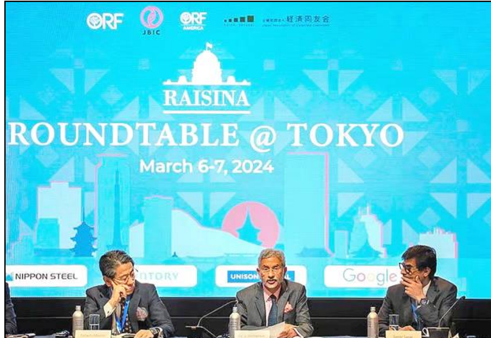
March 07, 2024 nü Tokyo nung Raisina Roundtable senden nung External Affairs Minister, S. Jaishankar adenba noksa nung angur.

March 2 nüa sentong ka nung jembidang External Affairs Minister-i kasa oji jembia liasü. India aser China na tsüngda tesendaktep ajungba akümtsü atema tezüngzüktep agia aliba ama shidak inyaktsüla aser Line of Actual Control (LAC) nung yimjung alitsü nüngdak, ta pai jembia liasü.