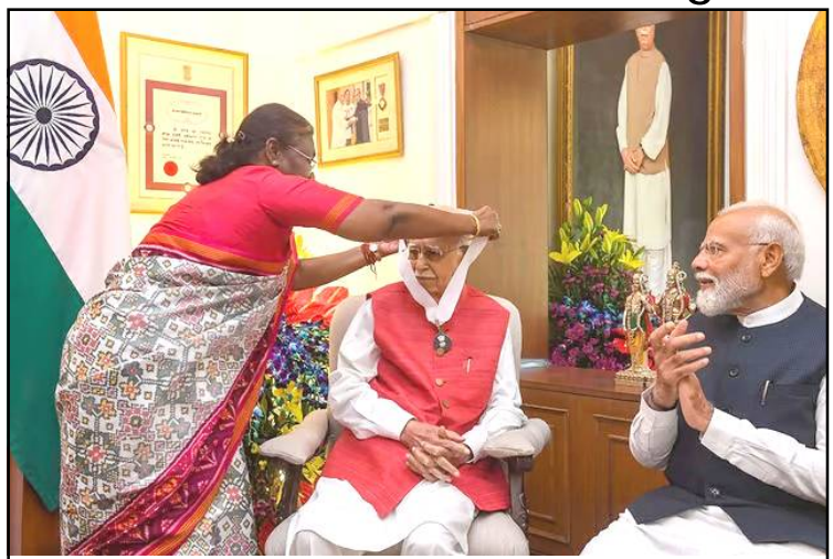
March 31, 2024 nü New Delhi nung linük Tir, Droupadi Murmu-i BJP lenir tain, L K Advani nem Bharat Ratna award agütsüdang tangokba noksa nung agur. Kasa noksa nung Ato kilonser Narendra Modi-a angur.

New Delhi, March 31 (Agencies): Amongnü linük Tir, Droupadi Murmu-i BJP lenir tain aser taoba mapang Deputy Ato kilonser, LK Advani'er ki tsüngdong oa pa nem Bharat Ratna award agütsüogo.