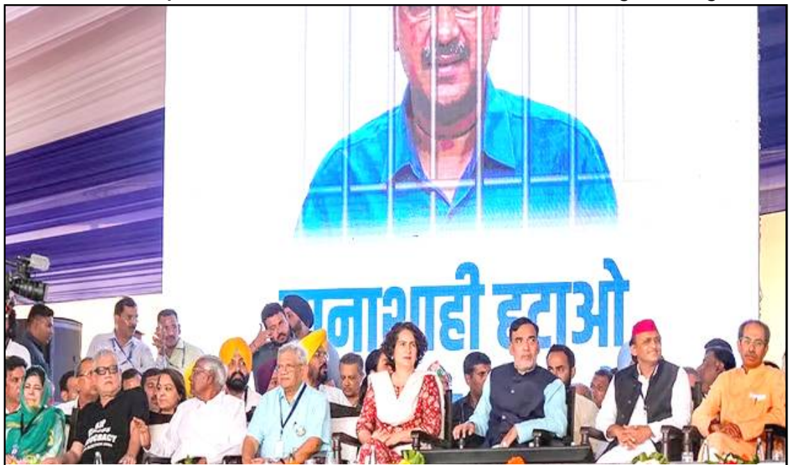
March 31, 2024 nü Ramleela Maidan, New Delhi nung opposition INDIA teloktepi ayongzükba 'Loktantra Bachao Rally' nung Shiv Sena (UBT) tongti Uddhav Thackeray, SP tongti Akhilesh Yadav, AAP lenir Gopal Rai, Congress leni Priyanka Gandhi Vadra, CPI(M) General Secretary Sitaram Yechury, TMC MP, Derek O'Brien aser PDP tongti Mehbooba Mufti nunger adenba noksa nung angur.

New Delhi, Metsüremi/ March 31 (Agencies): Amongnü opposition INDIA teloktep nung dena aliba party balala nungi lenirtemi Delhi nung aliba Ramlila Maidan nung adenshia 'Loktantra Bachao Rally' (Save Democracy Rally) agiogo.