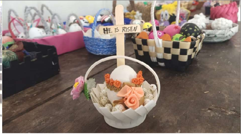
(Abelen) Kohima Baptist Pastors Fellowship (KBPF)-i The Heritage, Old DC Bungalow nung Sunrise Service ayonga agidang Kohima Ao Baptist Arogo tenüng nung ken atenba angur. (Achiji) Deobarnep Dimapur Ao Baptist Arogo kübok Yinsem Fellowship nung Christian Education Ministry tanurtemi Easter nüngtem nung entsü tobur junga renema bener aruba angur.

Kohima, March 31, 2024 (TYO): Kohima nung aliba The Heritage, Old DC Bungalow nung Deobarnep tamangertemi Sunrise Service nung kanga longsoa denogo.