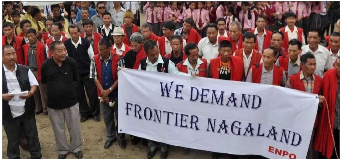
Eastern Nagaland Peoples' Organization (ENPO)-i lungkak aitba sentong ka agidang tangokba noksa angur. (File)

Dimapur, April 1, 2024 (TYO): April 19, 2024 nü Nagaland nung Lok Sabha elections nung Eastern Nagaland Peoples' Organization (ENPO)-i shilem magitsü lemtetogo.