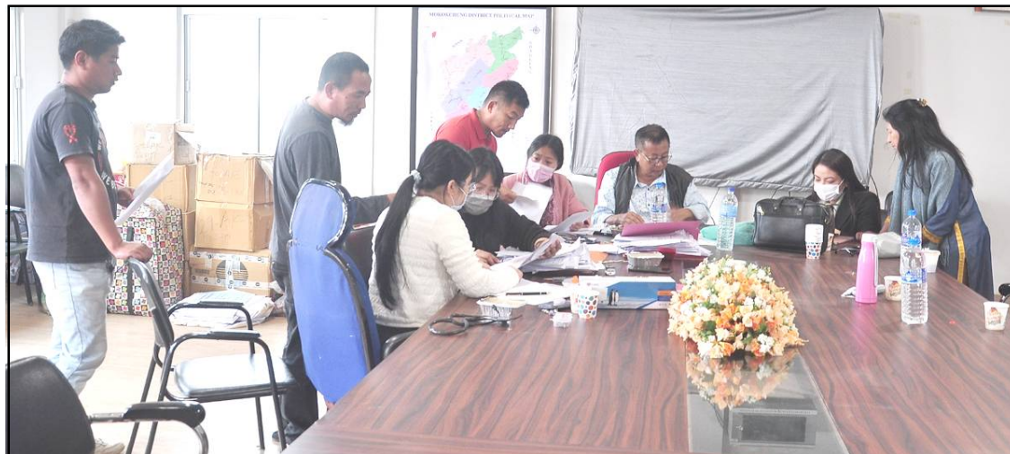
18th Lok Sabha Election 2024 nung poll duty atema shimba duty personnel tem medical ground nung leave agütsür alirtem April 1, 2024 nü ADC Planning, Mokokchung indang Conference Hall nung Medical Board ajanga temang tendangba noksa nung angur.

Iba training nung lanur 20 arua shilem agia liasü.