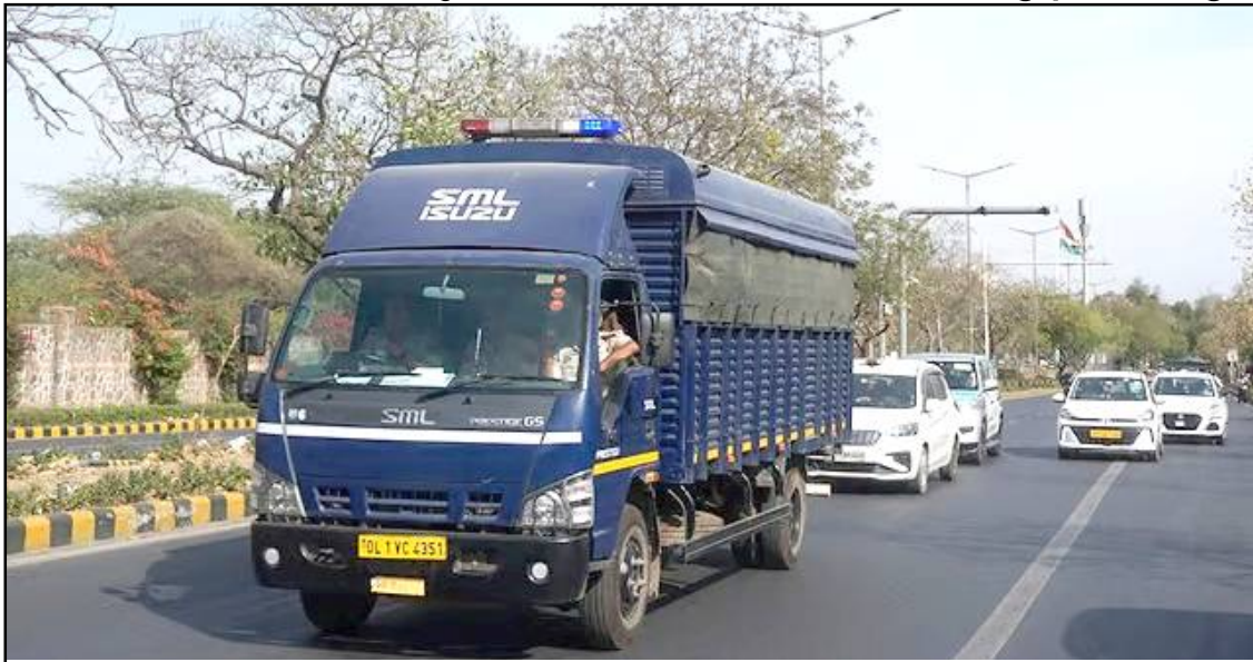
April 01, 2024 nü New Delhi nung aliba court ka nungi police van ka nung Delhi Chief Minister, Arvind Kejriwal, Tihar jail-i anir aodang tangokba noksa nung angur.

New Delhi, April 01 (Agencies): Delhi court kati April 15 tashi Delhi Chief Minister Arvind Kejriwal judicial ket nung ayutsü melaba sülen Amongnü pa Tihar Jail Number 2 nung puokogo.