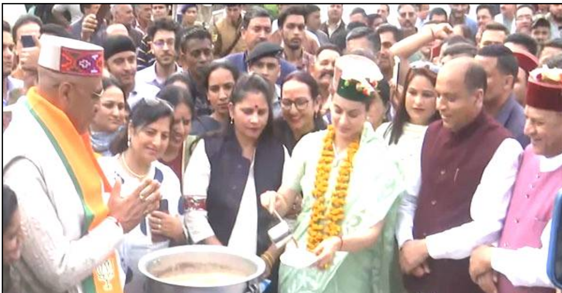
April 01, 2024 nü Himachal Pradesh kübok Mandi jila nung actress aser BJP candidate, Kangana Ranaut-i Lok Sabha election atema nüboyimdang lai süngo anganüa agütsüdang tangokba noksa nung angur. Taruba Lok Sabha election nung lai Mandi constituency nungi tokteptsü.

"Temelenshi tulu adokdar. Bendanglen nungi totzü alizükba anentsü aser iba linük ya tangar dak memetalokba linük 'Atmanirbhar Bharat' akümtsü," ta paisa shisem.