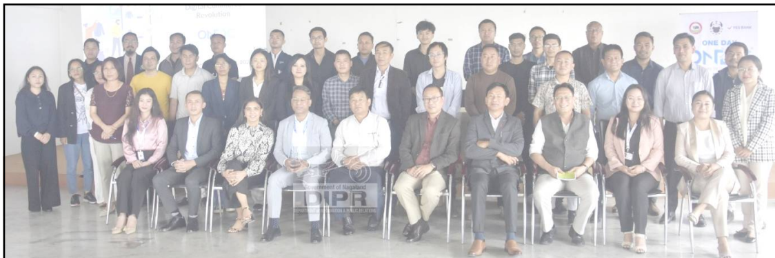
Open Network for Digital Commerce (ONDC) indang awareness sentong ka April 2, 2024 nü Directorate of Industries & Commerce, Kohima nung agidang tangokba noksa ka yangi angur.

Dimapur, Rongchii/April 02 (TYO): Open Network for Digital Commerce (ONDC) indang awareness sentong ka April 2, 2024 nü Directorate of Industries & Commerce, Kohima nung agia liasü.