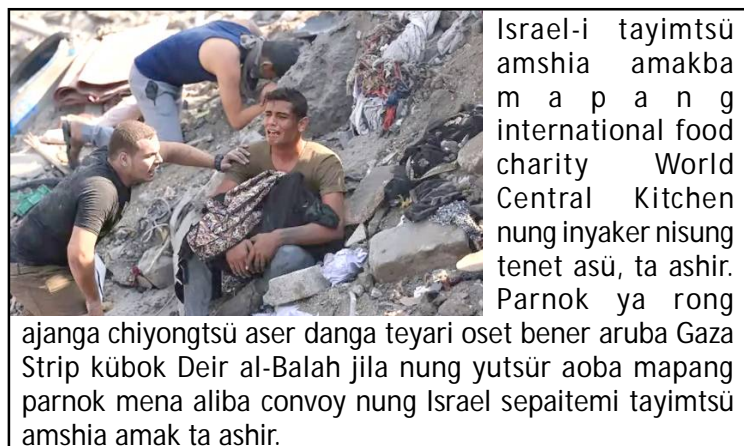
Israel-i tayimtsü amshia amakba mapang international food charity World Central Kitchen nung inyaker nisung tenet asü, ta ashir. Parnok ya rong

ajanga chiyongtsü aser danga teyari oset bener aruba Gaza Strip kübok Deir al-Balah jila nung yutsür aoba mapang parnok mena aliba convoy nung Israel sepaitemi tayimtsü amshia amak ta ashir.