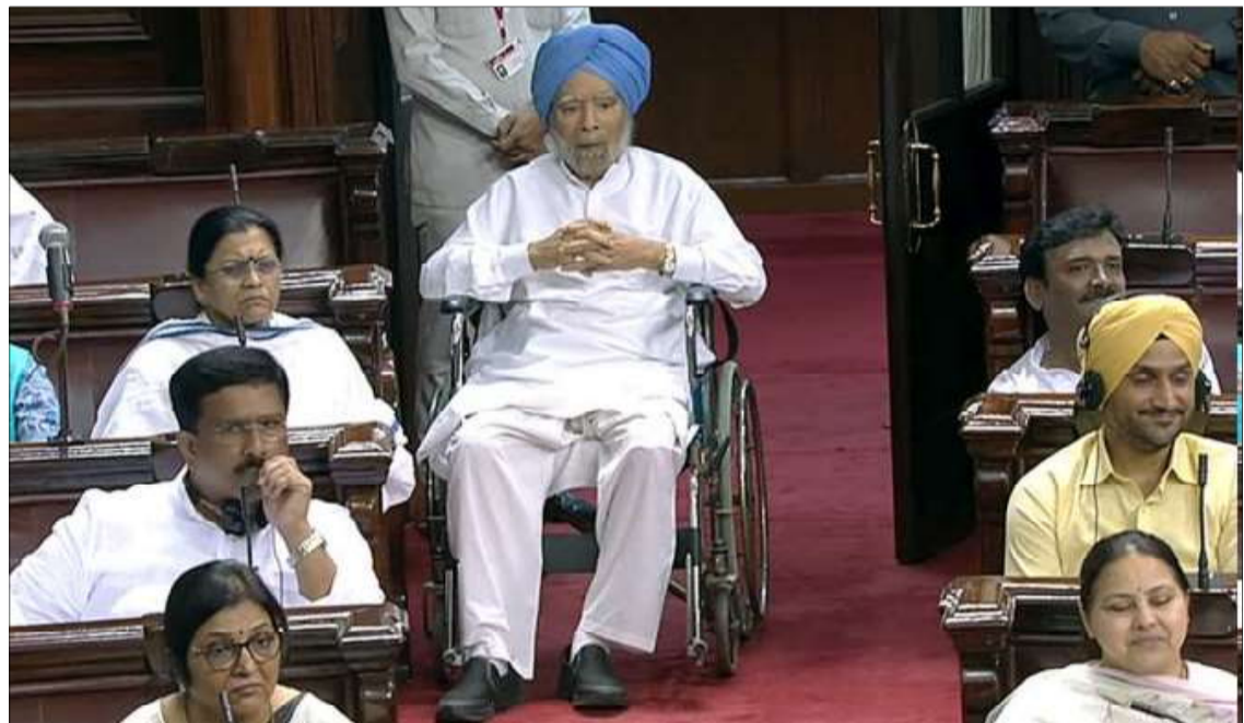
February 8, 2024 nü taoba Prime Minister Dr. Manmohan Singh-i Rajya Sabha nung adentsü atema arudang agiba noksa ka angur. (file)

New Delhi, April 2, 2024 (Agencies): Taoba Prime Minister aser Congress lennir tejen Dr. Manmohan Singh-i Mongulbarnü Rajya Sabha züngsem nungi sodi agiogo. Küm 33 tashi Parliament nung shilem agia aruba sülen pa kümsük agi tonger anisüngzüker.