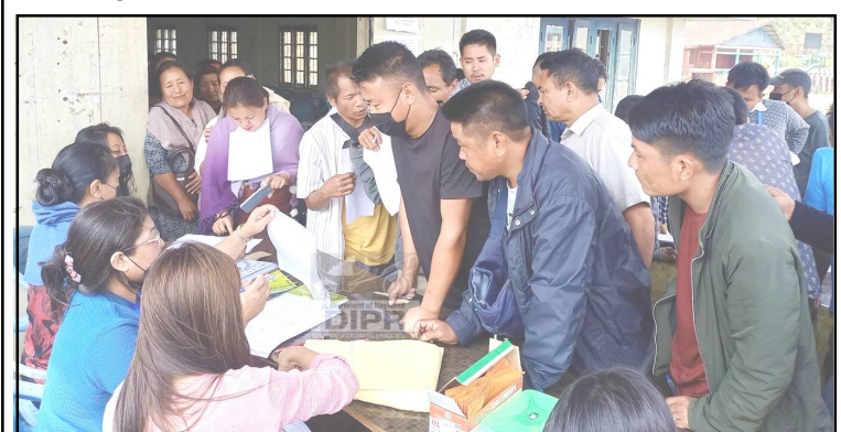
Lok Sabha election duty atema mapa alemtsü asoshi polling personnel (Grade IV) tem Town Hall, Peren nung April 2, 2024 nü tenüing zuluokba mapang tangokba noksa nung angu

Training nung madener aser aibelener nem The Representation of the People Act, 1951 indang Section 134 nung shia aliba ama temerenshi agütsütsü, ta sangdong ajangasa ashi.