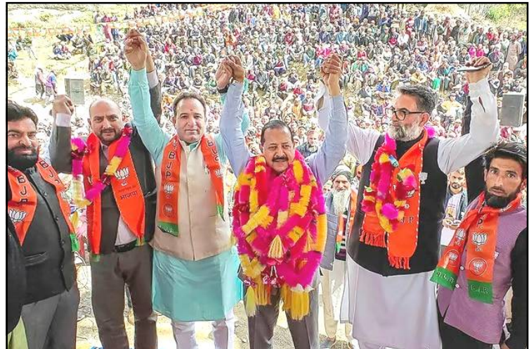
April 05, 2024 nü Kishtwar nung Union Minister aser BJP candidate, Jitendra Singh-i Lok Sabha election nung tokteptsü atema nüboyimdang tangokba noksa nung angur.

April 1 nü Israel nungeri anüinglen nungi Syria nung Iran consulate amakdang Iran nung general ana den officer pongu asü.