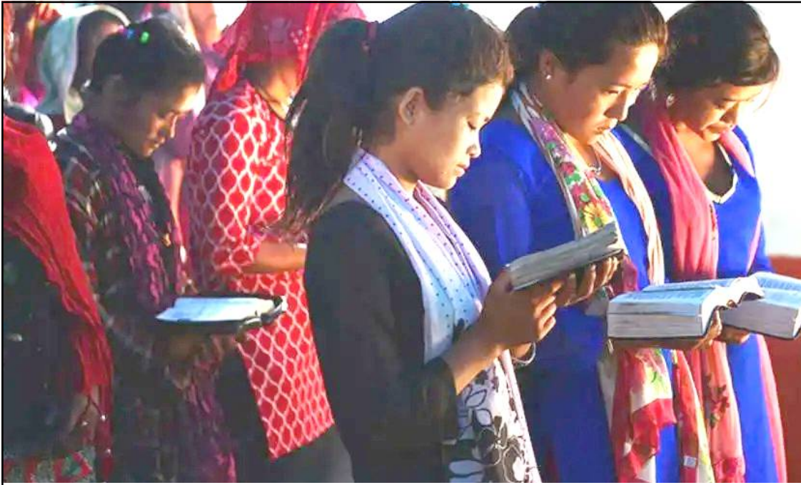
Nepal yimtiba, Kathmandu nungi kilometer 100 shi pilar aliba Lapa yim dak Nepali nunger Khristantem tekülem sentong ka nung tangokba noksa nung angur.

April 05, 2024: Nepal nung anti conversion ozüng kübok court kati Khristan pezü anema ken o akatsü tuyuba atema Khristan lenirtemi melabela metetdaksüogo.