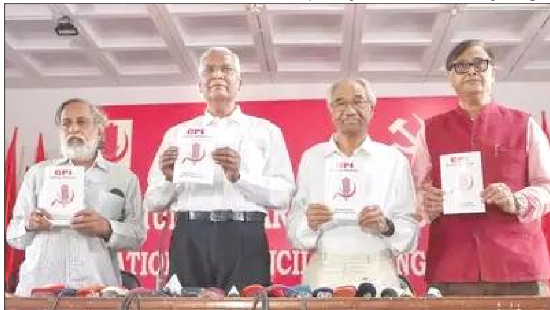
New Delhi, April 06, 2024: Honibarnü Communist Party of India (CPI) lenirtemi taruba Lok Sabha election atema party manifesto sayadang tangokba noksa nung angur.

New Delhi, Rongchii/April 06 (Agencies): Honibarnü Communist Party of India (CPI)-i taruba Lok Sabha election atema party manifesto sayaogo.