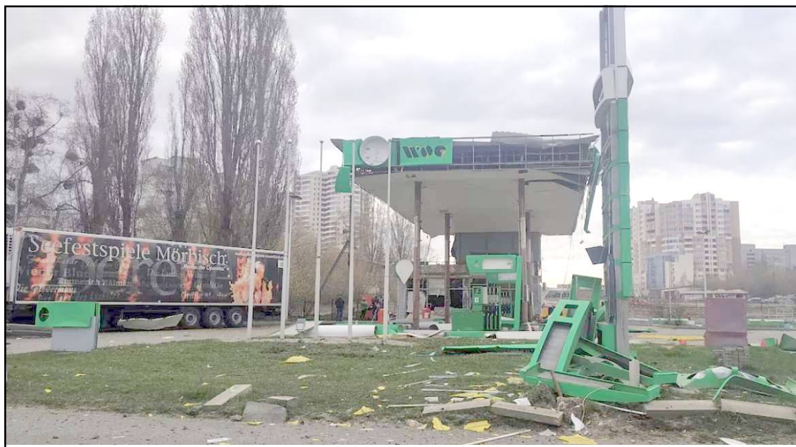
Russia-i missile amshia Ukraine amakba sülen fuel system ka raksar aliba noksa nung angur.

Kyiv, Rongchii/April 6 (Agencies): Russia-i drone amshia Ukraine kübok Kharkiv yimti amakba sülen nisung trok tepsetogo, ta local ketdangsürtemi metetdaksü.