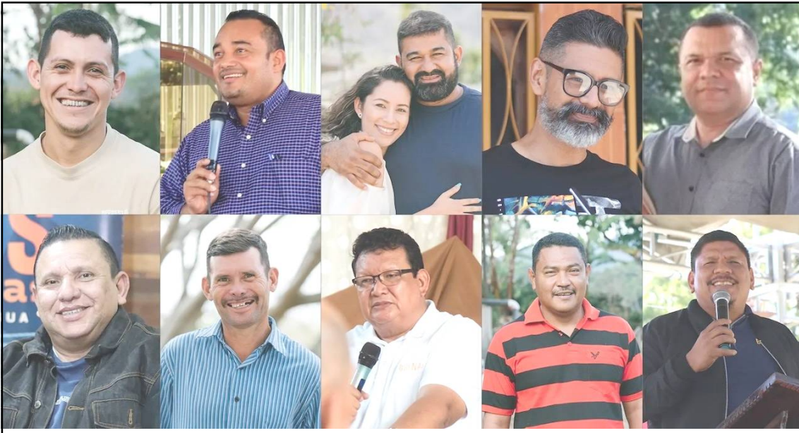
Nicaragua nung Protestant pastor tem noksa nung angur.

April 06, 2024: Nicaragua nung ketdangsertemi Evangelical telok ka den inyakba Protestant pastor 11 kum 12 nungi kum 15 tashi tepuokdak ayutsü obendang agütsüba den külemi pastor shia dang dollar sen senchi million 80 chiogo.