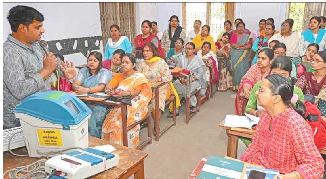
April 06, 2024 nü West Bengal kübok Birbhum district nung taruba Lok Sabha election atema polling ketdangsertem Electronic Voting Machines (EVM) aser Voter Verifiable Paper Audit Trail (VVPAT) machine amshiyim indang training agidang tangokba noksa nung angur.

Tan hopta tetenzüklena Chhattisgarh kübok Bijapur district nung police aser sepaitemi tetsür asem densema Maoists telungpur 13 khaseta liasü.