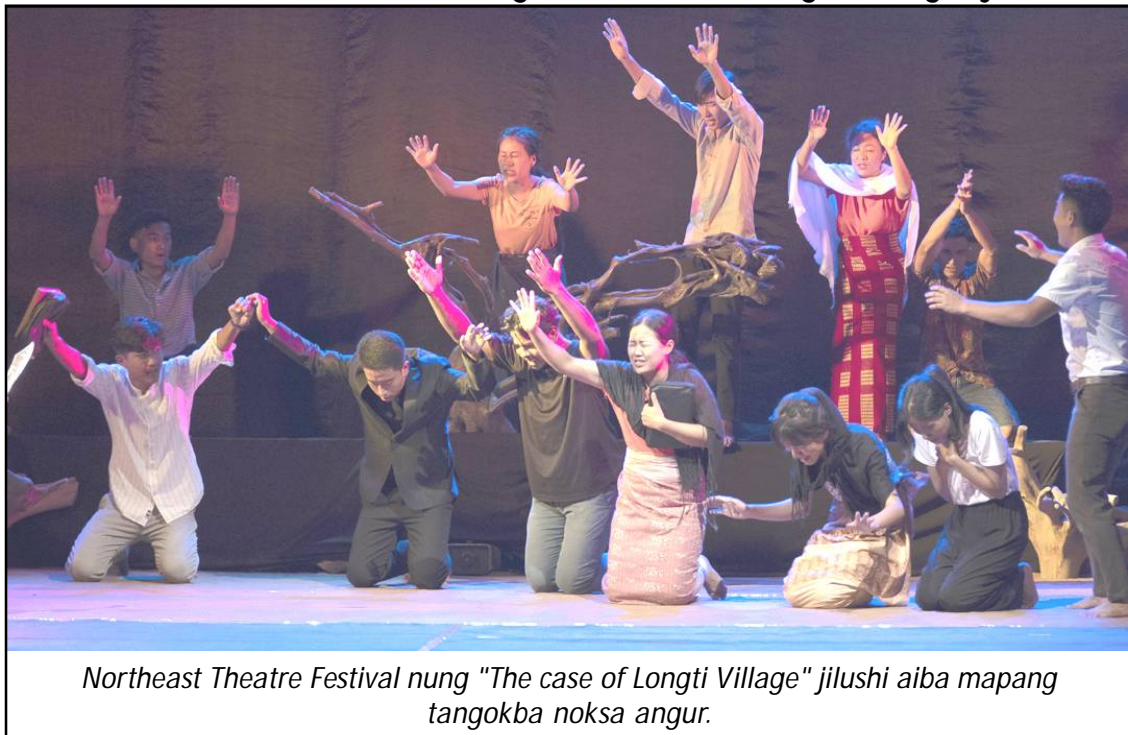
Northeast Theatre Festival nung "The case of Longti Village" jilushi aiba mapang tangokba noksa angur.

Dimapur, Rongchii/April 07 (TYO): National School of Drama, New Delhi ajanga ayongzüka Northeast Theatre festival, Poorvottar Rashtriya Natya Samaroh 2024 sentong New Delhi nung March 27-30, 2024 anogotem agia liasü.