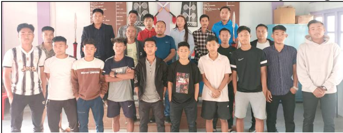
Par 10 den tsurabur, adianutem aser Marepkong Youth Association ketdangsurtem densema angur.