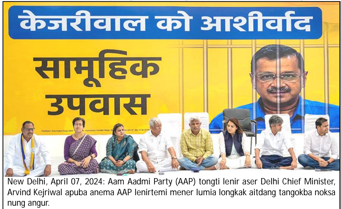
New Delhi, April 07, 2024: Aam Aadmi Party (AAP) tongti lenir aser Delhi Chief Minister, Arvind Kejriwal apuba anema AAP lenirtemi mener lumia longkak aitdang tangokba noksa nung angur.

New Delhi, April 07 (Agencies): Amongnü New Delhi nung BJP-i Delhi Chief Minister, Arvind Kejriwal CM menden nungi anenjang ta maneni takhangba agüja longkak aitdang metre 600 shi dang pilar AAP-ia par lenir Kejriwal apuba anema longkak aitogo.