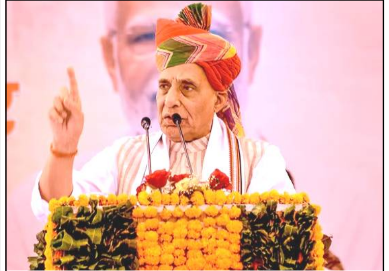
April 07, 2024 nü Bikaner nung Lok Sabha election atema nüboyim sentong ka nung Defence Minister, Rajnath Singh-i jembidang tangokba noksa nung angur.

Yaküm Karnataka assembly election nung Congress-i BJP madak takok ngua BJP sorkar atsüngdoka liasü.