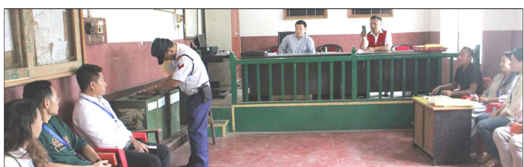
Dimapur Deputy Commissioner office nung essential worker kati Postal Ballot ajanga vote enoktsüba angur.

Dimapur, April 8, 2024 (TYO): April 8, 2024 nungi Dimapur Deputy Commissioner office nung essential workers atema postal ballots nung vote enoktsüba maparen tenzüker. Iba maparen ya EAC aser Nodal Officer for Postal Ballots Litsenthung Kikon ketdangsuba kübok inyaker.