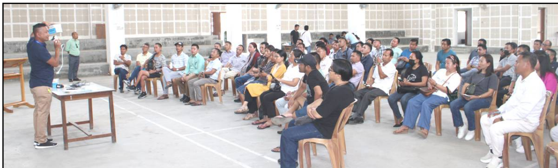
Dimapur Government College nung April 8, 2024 nü Lok Sabha Elections ketdangsür nem webcasting training agütsüba mapang tangokba noksa nung angur.

Dimapur, Rongchii/April 08 (Agencies): Aruya aliba Lok Sabha elections tajungtiba nung agitettsü mechi Dimapur nung operators atema webcasting training ka April 8, 2024 nü Dimapur Government College, Dimapur nung ayongzüka agia liasü.