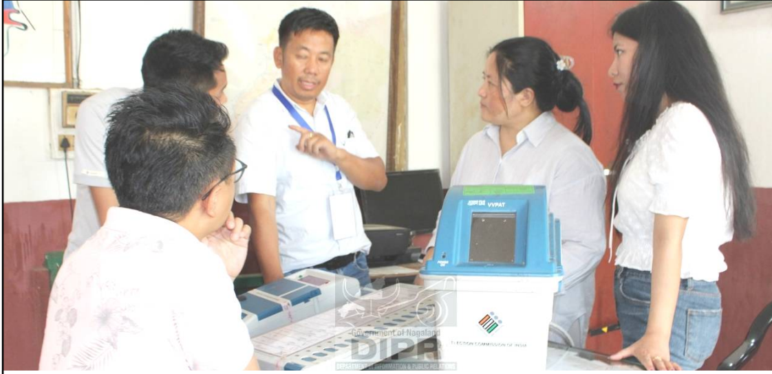
Dimapur nung polling personnel atema EVM/VVPAT facilitation centres amenokba mapang tangokba noksa angur.

Dimapur, Rongchii/April 09 (TYO): Aruya aliba Lok Sabha atema General Elections 2024 asoshi terenemshiba ka ama Dimapur nung aliba polling personnel tem dang Deputy Commissioner, Dimapur indang office telungzük nung aliba DB Court nung EVM/VVPAT Facilitation Centre amenokogo ta metetdaksü. Iba centre ya April 9 nungi April 17, 2024 tashi lapoka alitsü. Election agitsüba anogo nung inyaksü mapa, forms aser danga maparen mangatetjemi aliba angatetteptsü asoshi