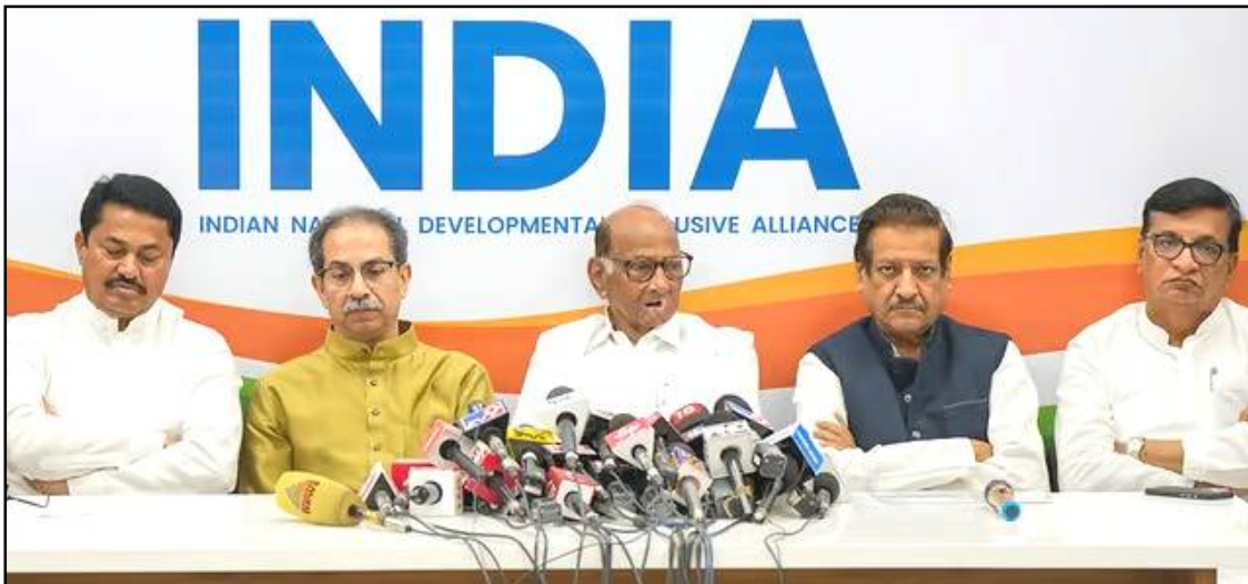
April 09, 2024 nü Mumbai nung Maha Vikas Aghadi (MVA) teloktepi ayongzükba osangbenertem senden ka nung Shiv Sena (UBT) tongti Uddhav Thackeray, Congress lenirtem- Nana Patole, Prithviraj Chavan aser Balasaheb Thorat nunger den NCP tongti, Sharad Pawar nungeri osangbenertem den jembidang tangokba noksa nung angur.