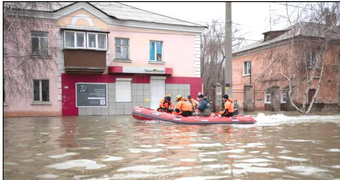
Ural River nung tzu tali ayimba ajanga tzumetsung adoka Orenburg region nung tanur 885 densema nisung 4,000 dak tema pei ki yutsur tesem balalai anir aotsüsa akum. Kazakhstan den arütsü anasa Orenburg region nung tzu nokdang laoa tzumetsung adokba atema teyari meshia Russia kübok Orsk yimti nung nüburtemi longkak aita liasü.

Israel-i Gaza amakdang nisung 33,000 dak tema tepsetogo aser item rongnung timba civilian lir, ta Hamas meyong health ministry ajanga ashir.