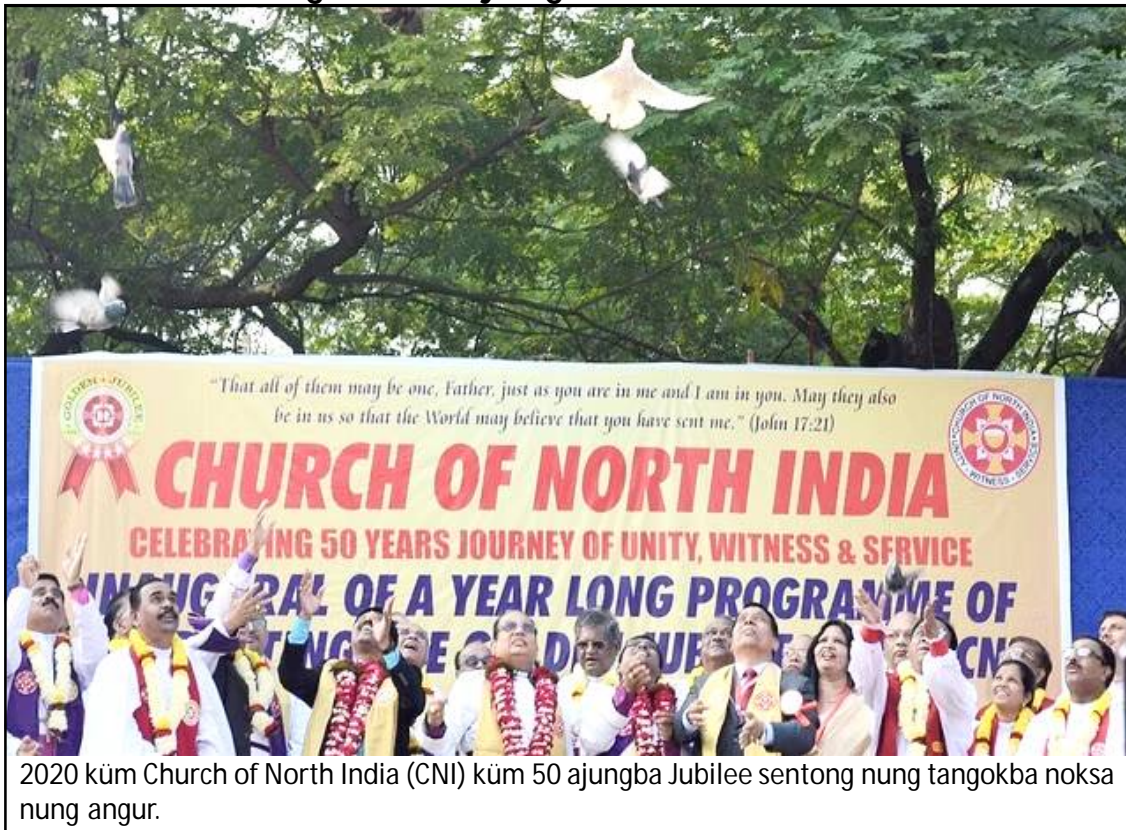
2020 küm Church of North India (CNI) küm 50 ajungba Jubilee sentong nung tangokba noksa nung angur.

April 09, 2024: India linük nung Foreign Contribution (Regulation) Act (FCRA) license 'renew' mesütsüba agi Khristan ministry aika timtemdar; March ita nunga Khristan melungtet telok Vision India indang FCRA license renew mesütsü.