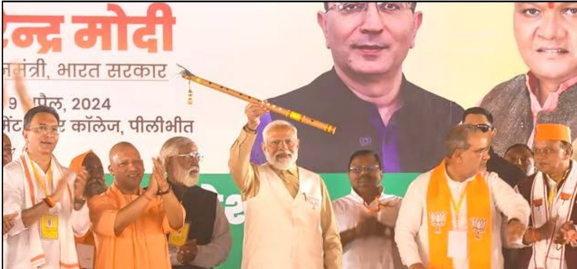
April 09, 2024 nü Pilibhit nung Lok Sabha election atema nüboyim sentong ka nung Ato kilonser Narendra Modi aser Uttar Pradesh Chief Minister, Yogi Adityanath na den tangartem tangokba noksa nung angur.

CEC Kumar-i linük tesem balala sema senzüdang Commando tem jagi pa meina jajatsü aser official sentong ajak nung pa nem security agütsüsü. Rajiv Kumar ya retired Indian Administrative Service (IAS) officer ka lir. 2022 küm May 15 nü pa India nung CEC 25buba aküm. 2020 küm September 1 nü pa election commissioner shima liasü.