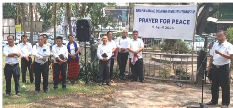
Dimapur nung Aor Reverend-temi Deputy Commissioner Office kima Nagaland nung aruya aliba Lok Sabha election nung yimjung nung nübertem ochishia shilem agitsü atema Tsüngrem dang taochi meshia sarasadem sentong ka agidang agiba noksa ka yangi angur.

Dimapur, Rongchii 9, 2024 (TYO): Dimapur Area Aor Ordained Minister Fellowship tanü India lima 18th Lok Sabha Election nung tiptema agitettsü atema Rongchii 9, 2014 anepdang 6.ako nungi 10 ako tashi DABA tenla kidang adenshia sarasadem kanga temoatsü agia liasü.