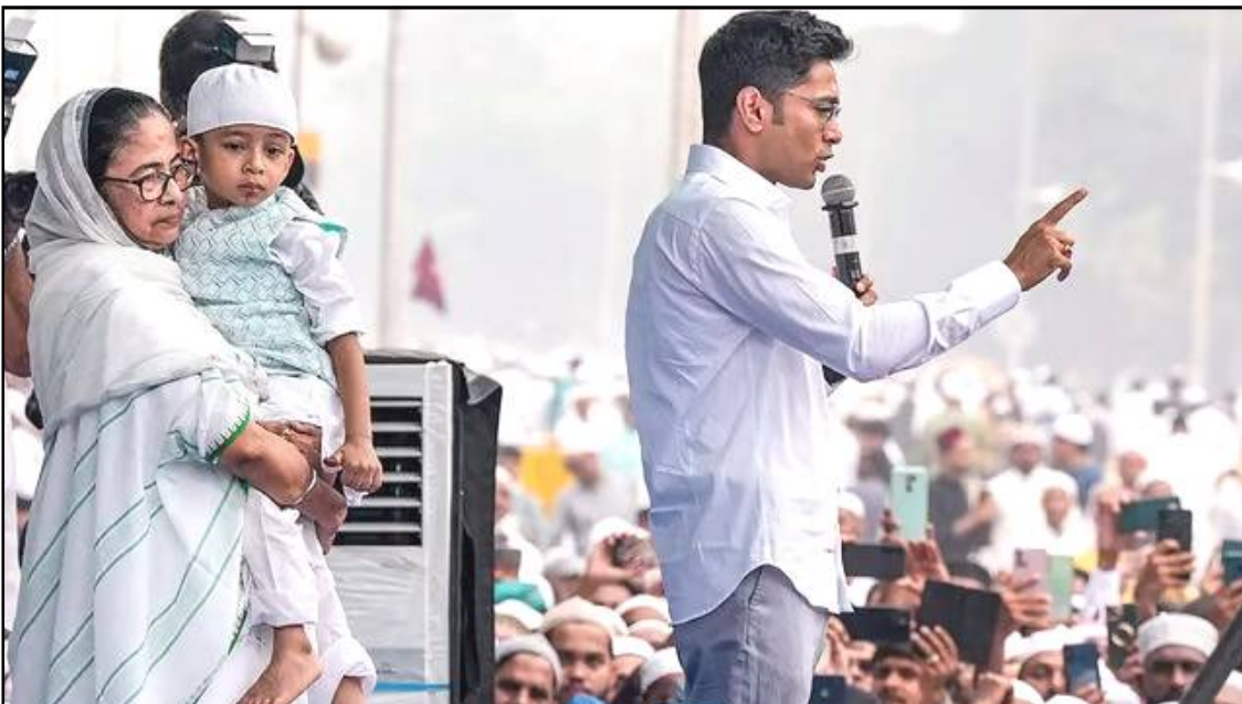
April 11, 2024 nü Kolkata nung Eid benjung sentong nung TMC General Secretary Abhishek Banerjee-i jembidang tangokba noksa nung angur. Ksa noksa nung West Bengal Chief Minister, Mamata Banerjee-a angur.