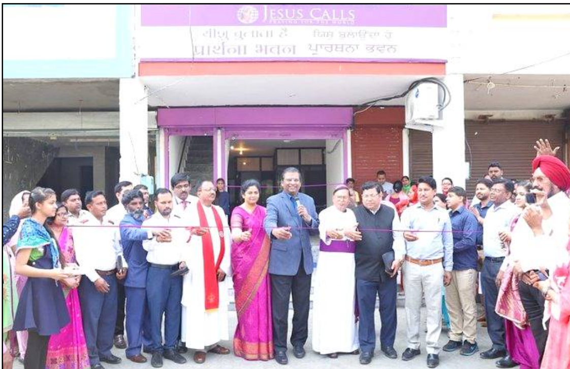
Jesus Calls Ministry-i Jalandhar nung India nung 108buba Prayer Tower semzükba mapang tangokba noksa nung angur.