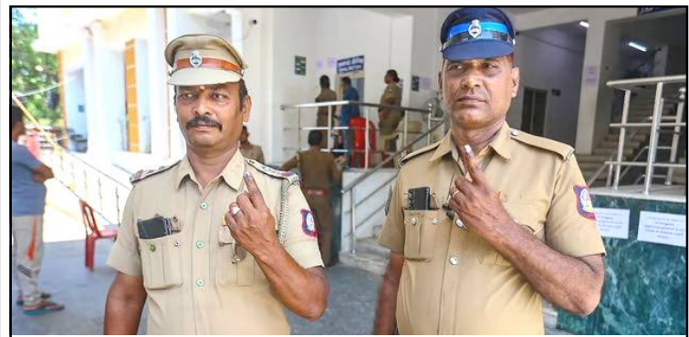
April 11, 2024 nü Chennai nung Lok Sabha election duty lemzüka aliba police anati postal ballot ajanga vote agütsüba sülen tangokba noksa nung angur.

Israel nung mapa inyakerterem nem itasen sen lakh 1.37 tashi agütsütsü, medical insurance, chiyungtsü, talidak aser ita shia bonus sen 16,515 agütsütsü.