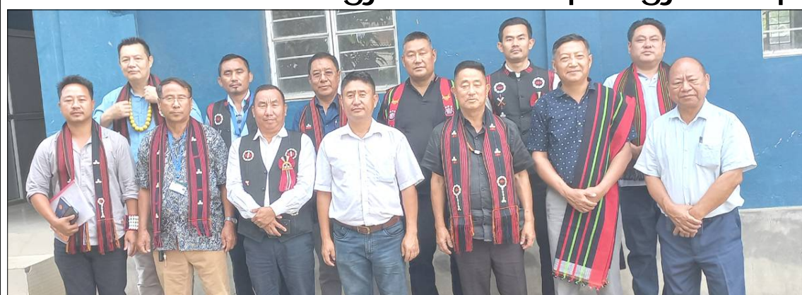
CPO aser WSH tsungta shisadokden senden ka CPO Hall, Chümoukedima nung April 11, 2024 nü amandang tangokba noksa.

Dimapur, Rongchii/April 11 (TYO): Chakroma Public Organisation (CPO) aser Western Sumi Hoho (WSH) tsungta shisadokden senden ka CPO Hall, Chümoukedima nung April 11, 2024 anüngdang 11:00 ako nung mena liasü.