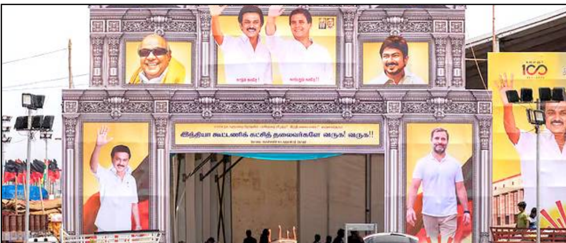
Coimbatore nung taruba Lok Sabha election magi tsüingda Congress leader Rahul Gandhi aser Tamil Nadu CM aser DMK tekolakba M.K.Stalin na lokti senden ka nung shilem magi tsüingda renemshiba noksa nung angur.

2019 küm delimitation sülen Budgam district nungi Shia pur timba aliba assembly menden ana densema tanga menden ishika bendenloktsü aser iba ajanga electoral landscape melenshia liasü. Taoba mapangba iba menden ya NC puri amokbanger aruogo aser Congress aser PDP natia iba menden nungi takok nguogo.