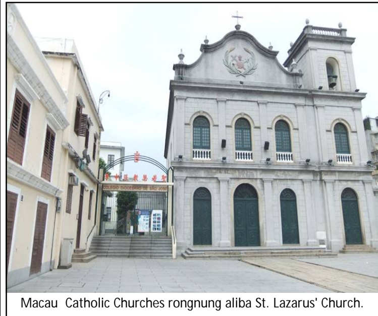
Macau Catholic Churches rongnung aliba St. Lazarus' Church.

Macau, Rongchii/April 12 (Agencies): Israel aser Hamas tsüngta raraba nung timtem ajururtem yaritsü asoshi Macau Catholic Church indang social service arm ajanga sen US$123,940 bendenogo, ta osang ka ajanga ashir.