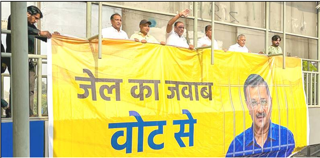
Aam Aadmi Party (AAP) pusemertemi party tekolakba aser Chief Minister Arvind Kejriwal pusema poster tem maloktsüba noksa nung angur. Kejriwal ya Delhi excise policy ken o nung April 15 nü tashi judicial custody nung ayutsü.