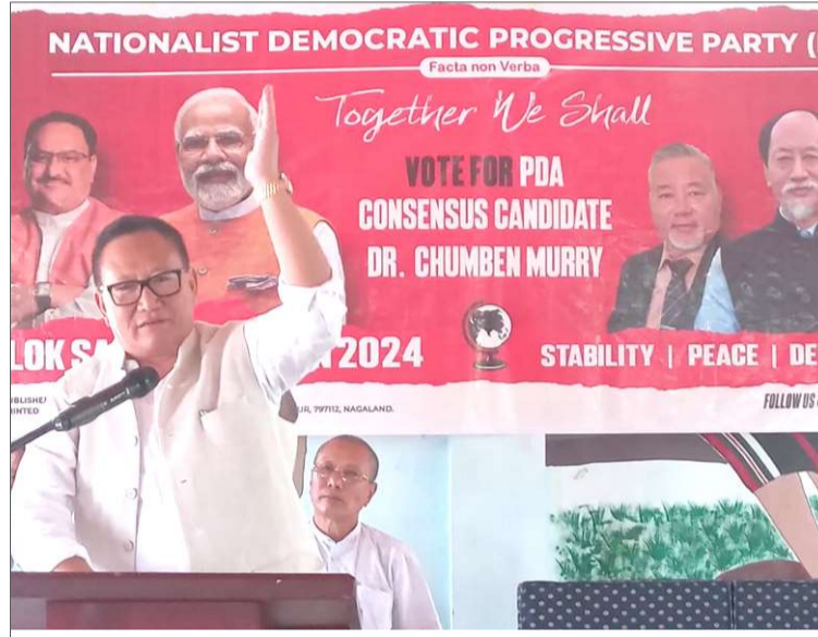
April 12, 2024 nü Peren kübok Ngwalwa jila nung T R Zeliang-i PDA consensus candidate Dr. Chumben Murry atema nüboyimba sentong nung o jembiba angur.

Dimapur, April 12, 2024 (TYO): NDPP ama regional party kati BJP ama national party ka den tesentaktep ayuba nung tai kecha mali ta Deputy Chief Minister T.R Zeliang-i ashi.