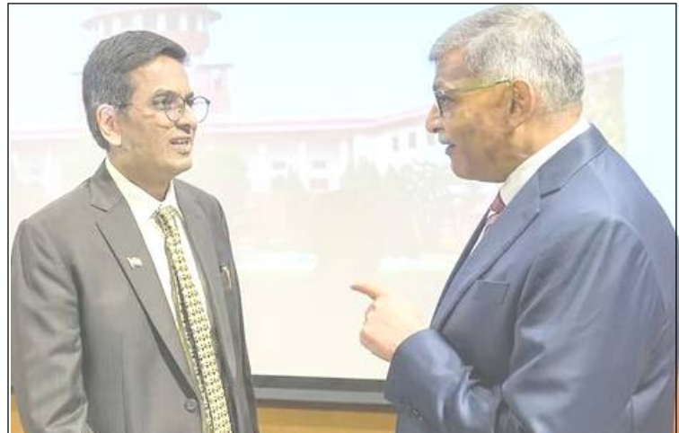
April 13, 2024 nü New Delhi nung anogo ananü 'Technology and Judicial Dialogue' conference nung Chief Justice of India, D Y Chandrachud aser Chief Justice of Singapore, Sundaresh Menon na tangokba noksa nung angur.

2022-23 kümsük nung India nung kaketshir lakh 2.6 United States-i oa liasü, aser ibaji 2021-22 kümsük den medemdangra kaketshir shilem 35 agi teimba US-i aoba liasü.