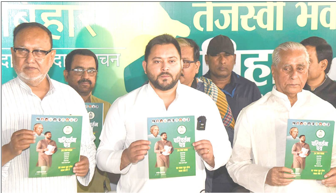
April 13, 2024 nü Patna nung RJD lenir, Tejashwi Yadav den party lenirtemi taruba Lok Sabha election atema 'Parivartan Patra' sayadang tangokba noksa nung angur.

Patna, April 13 (Agencies): Bihar nung Mahagathbandhan teloktep nung party tuluba, RJD-i taruba Lok Sabha election atema party manifesto sayaogo.