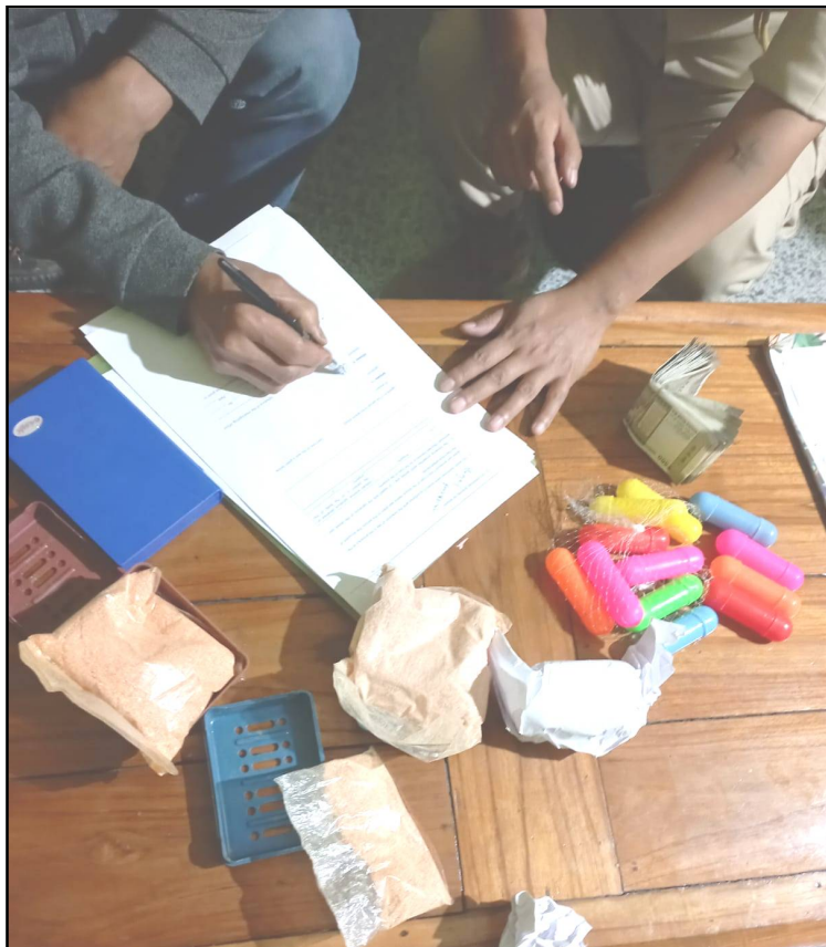
Imotiba, Nungshiyanger aser Sarenba Aier par asem ket nungi ngutetba Sun Flower(Brown Sugar) noksa.

Mokokchung, April/Rongchii 13 (TYO): Yimyu Ward Mokokchung nung April 12 aonung 10:00 ako meta Mokokchung Police-i Sun Flower(Brown Sugar) sen 100000 tema shi jenjang apu. Sun Flower(Brown Sugar) sen 100000 tema shi jenjang ya