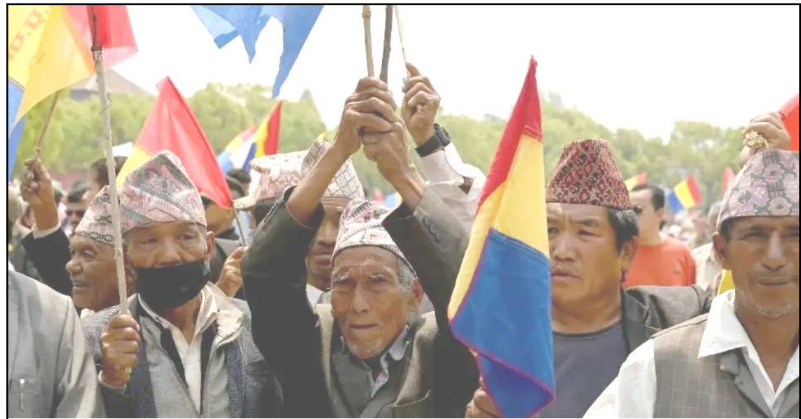
April 09, 2024 nü Nepal yimtiba, Kathmandu nung Rastriya Prajatantra Party (RPP) züngsemtem. Nepal nung secularism agienba sülen 'Hindu linük' ta sangdongtsü atema takhangba agüja longkak aيتدang tangokba noksa nung angur.