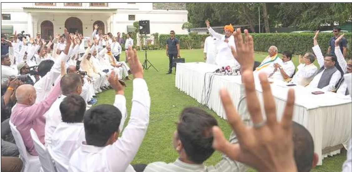
New Delhi, April 13, 2024: Lok Sabha election nung Other Backward Classes (OBC) organisation aikati Indian National Developmental Inclusive Alliance (INDIA) teloktep pusemstsü ta sangdongba sülen Congress Tir, Mallikarjun Kharge aser party lenir K.C. Venugopal nati osangbenertem den jembidang tangokba noksa nung angur.

"Kachchatheevu ya shibangadoker aliba ken o ka lir. Küm 50 tejaklen iba atema tezüngzüktep agia liasü. 2014 küm nungi Modi sorkar lir, süra kechiba tesüiba küm 10 tsüngda pai iba ken o mesüok? Tang China sepaitemi India nung litsü atsünga agiba agi parnoki tang iba ken o süoker," ta paisa shisem.