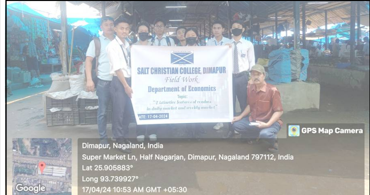
April 17 nü Department of Economics, Salt Christian College, Dimapur-i, "Distinctive features of vendors in daily market and weekly market" omen dak ajemdaker field work ka ayongzüka agiogo. Tesayurtem tawabangba kübok kaketshirtemi lendi nung yokyatsüyar 30 den parnok tebilemstü, anosotsü jenjang aser parnoki sen kwi aazüker iba indang asüngdanga sensaksema liasü.

Bodhbarnü 1-Inner Manipur Parliamentary Constituency kong April 19 nü Lok Sabha election agitsü lir iba atema District Election Office, Imphal West nung