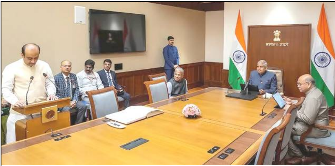
April 18, 2024 nü New Delhi nung linük tatong Tir aser Rajya Sabha Chairman, Jagdeep Dhankhar-i BJP lenir Dr. Sudhanshu Trivedi nem Rajya Sabha MP tenangzükba agidaksüdang tangokba noksa nung angur.