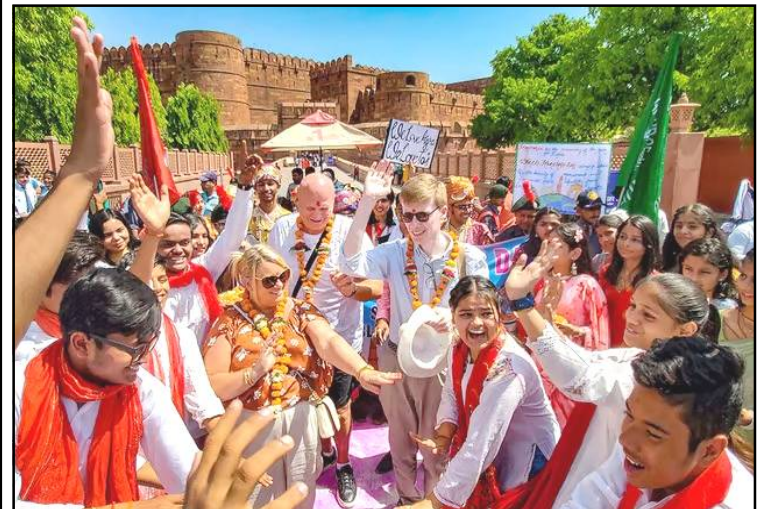
April 18, 2024 nü Agra Fort nung bendanger raliwalirtemi World Heritage Day amongdang tangokba noksa nung angur.

Ketdangsertemi ashiba agi, Maoists-i timtem agütsüba tesemtem nungsa Eklavya residential schools 121, ITI 43 aser skill development centre 38 lapoktsüogo.