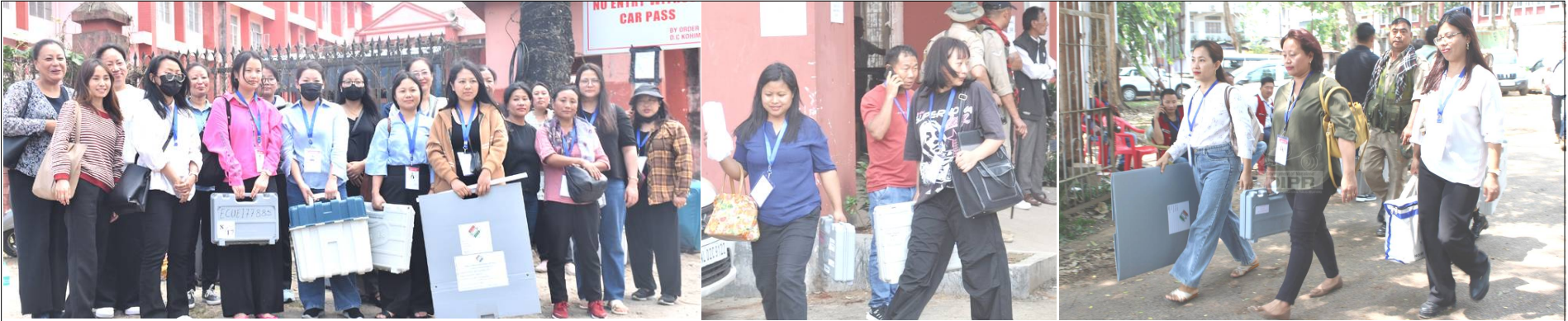
(Abelen) Tetsür kisung aliba polling team tem April 18, 2024 nü pei nem lemzüksüba polling station tem bushia maodang DC Office Complex, Kohima nung tangokba noksa ka angur. (Teyong) Deputy Commissioner, Mokokchung indang office nungi EVMs aser polling materials tem bener tetsür polling officer tem April 18, 2024 nü pei nem lemzüksüba polling station bushia aodang tangokba noksa ka angur. (Achiji) Dimapur DC office nungi EVMs aser polling materials tem bener tetsür polling officer tem April 18, 2024 nü pei nem lemzüksüba polling station bushia aodang tangokba noksa ka angur.

Dimapur, Rongchii/April 18 (TYO): Aruya aliba Lok Sabha elections atema Kohima district kübok polling personnel tem election nung amshitsü osetsüset abeni April 18, 2024 nü Deputy Commissioner, Kohima indang office-i arua liasü.