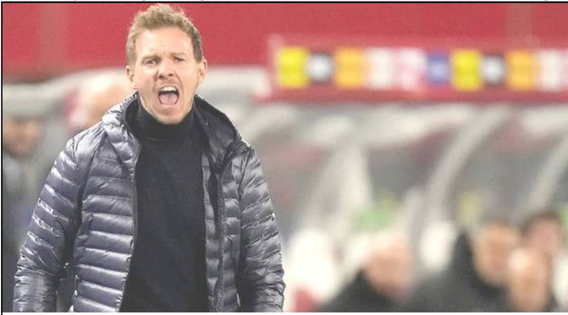
Julian Nagelsmann ya German national football team nung manager ka ama 2026 World Cup alema inyaksü contract atsülangogo.

Berlin, Rongchii/April 19 (Agencies): Germany football national team manager inyaksü atema Julian Nagelsmann contract 2026 World Cup alema atsülangogo.