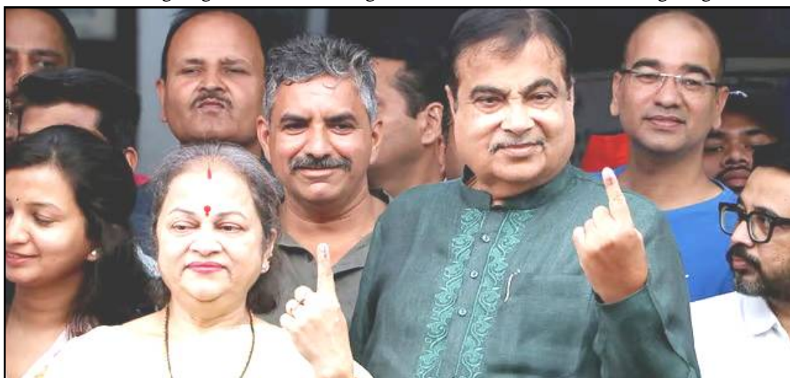
April 19, 2024 nü Nagpur nung BJP candidate, Nitin Gadkari aser pa kinüngtsü nati vote agütsüba sülen vote agütsüba temaitsü sayudang tangokba noksa nung angur. Union Minister Gadkari-i Nagpur Lok Sabha menden nungi toktep.

Hokolbarnü agiba Lok Sabha menden 102 nung 2019 küm Lok Sabha election nung NDA-i menden 41 aser Congress-i aniba UPA teloktepi menden 45 ngua liasü. Ajsüaka taküm election nungbo delimitation dak sendakba nung menden trok agienogo.