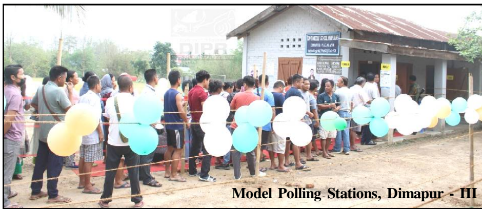
Model Polling Stations, Dimapur - III