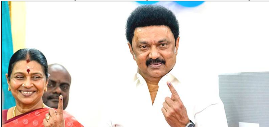
April 19, 2024 nü Chennai nung aliba polling station ka nung Tamil Nadu Chief Minister aser DMK tongti, MK Stalin den pa kinüngtsü nati vote agütsüba sülen temaitsü sayudang tangokba noksa nung angur. Tamil Nadu nung Lok Sabha menden 39 prongla atema election agiogo.

New Delhi, Rongchii/April 19 (Agencies): Hokolbarnü states aser union territories 21 nung Lok Sabha menden 102 atema election agiogo; West Bengal aser Manipur tesem kar nungbo rara adoka liasü, ta election ketdangsertemi metetdaksü.