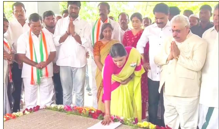
April 20, 2024 nü Kadapa nung Andhra Pradesh Congress Tir, YS Sharmila-i Kadapa Lok Sabha menden nungi tokteptsü atema nomination file asütsü lia lai tebu aser taoba mapang Andhra Pradesh Chief Minister, asür YS Rajasekhara Reddy nem akhüm agütsüdang tangokba noksa nung angur.