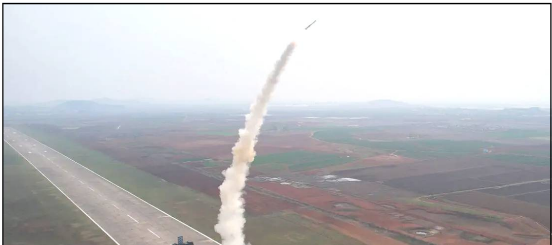
Honibarnü North Korea sorkari lemsatepba noksa ka nung "Hwasal-1 Ra-3 strategic cruise missile" ta nungja agütsür missile ka transporter erector launcher vehicle nungi yokba noksa nung angur.

Pyongyang, Rongchii/April 20 (Agencies): North Korea-i strategic cruise missile ka atema "super-large warhead" ka tendangogo, ta state media sangdong ka ajanga metetdaksü. North-isa anti-aircraft missile tapu balaka tendangogo, ta kasa sangdong ajanga metetdaksü.