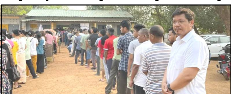
18th Lok Sabha election mapang Meghalaya nung Tura Assembly Constituency kübok Walbakgre polling station nung vote agütsütsü atema Meghalaya Chief Minister Conrad Sangma nokdaka aliba noksa nung angur.

Tura, Rongchii/April 20 (Agencies): 18th Lok Sabha election nung vote agütsütsü atema Meghalaya Chief Minister aser National People's Party (NPP) tir Conrad Sangma pa kisüng Tura nung aliba polling station-i ao aser pa indang vote agütsütsü ghonda asem