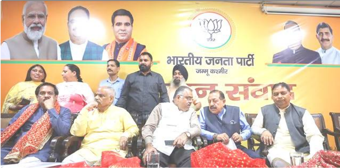
April 20, 2024 nü Jammu nung BJP senden ka tembangba sülen BJP National General Secretary, Tarun Chugh aser Union Minister Jitendra Singh na den tangartem noksa nung angur.