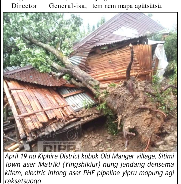
April 19 nü Kiphire District kübok Old Manger village, Sitimi Town aser Matriki (Yingshikiur) nung jendang densema kitem, electric intong aser PHE pipeline yipru mopung agi raksatsüogo

Director General-isa, Northeast nung NECTAR-i achaayangba scheme balala indang metetdaktsü aser lanurtem dang item scheme tem maangka agitsü ajungshiba den, NECTAR-i raw materials kechi angur iba dak ajemdaker unit aser plant tem amenoktsü atema takokba tashi teyari agütsütsü ta tenangzükbaga agütsü.