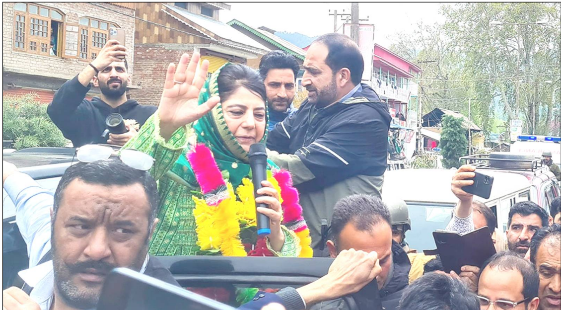
April 20, 2024 nü Anantang district nung PDP Tir aser taoba mapang Jammu & Kashmir chief minister, Mehbooba Mufti-i Lok Sabha election nüboyim sentong ka nung shilem agidang tangokba noksa nung angur.