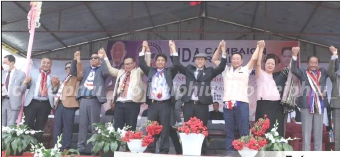
Manipur nung NPF candidate atema Nagaland CM & Dy CM nungeri nübu yimtsüba mapang tangokba noksa angur.

Imphal, Rongchii/April 21 (Agencies): Nationalist Democratic Progressive Party (NDPP) lenir aser Nagaland Chief Minister Neiphiu Rio aser Deputy Chief Minister Tadtui Rangkau Zeliang nungeri Honibarnü Manipur nung Lok Sabha election nübuyim nung shilem agia liasü. NDPP ya Nagaland nung BJP aser Naga People's Front indang coalition partner lir. NDPP lenir ana yagi Manipur nung Senapati district kübok Maram Bazaar nung nübuyimba sentong nung jembia liasü. Parnoki NPF candidate Kachui Timothy Zimik bhukuma liasü, shiba scheduled tribes asoshi wazüka aliba Outer