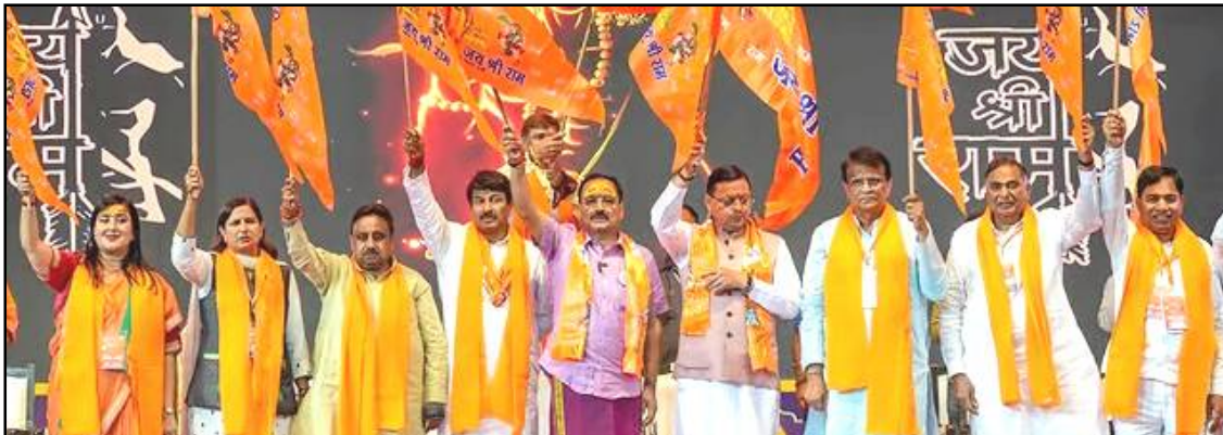
April 21, 2024 nü New Delhi nung Uttarakhand Chief Minister Pushkar Singh Dhami aser Delhi BJP Tir, Virendra Sachdeva na den Delhi nung Lok Sabha election atema BJP candidate tem- Bansuri Swaraj, Kamaljeet Sehrawat, Praveen Khandelwal, Manoj Tiwari, Ramvir Singh Bidhuri aser Yogender Chandolia nunger tangokba noksa nung angur.

Rajasthan nung Lok Sabha menden 25 lir. April 19 nü election mezüngbuba shilem nung menden 12 atema election agiogo aser tanüngba menden 13 atema April 26 nü election agitsü.