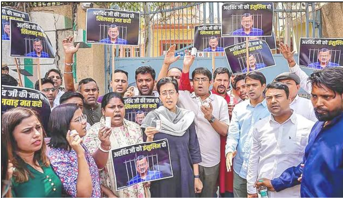
Tihar Jail nung ketdangsertemi Delhi Chief Minister Arvind Kejriwal nem 'insulin' magütsür, ta tai tonglokja April 21, 2024 nü New Delhi nung Tihar jail kima Delhi Minister Atishi den AAP züngsemtemi 'insulin' amer longkak aitdang tangokba noksa nung angur.