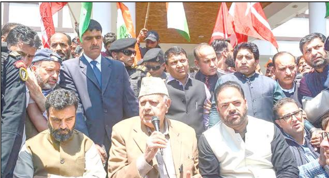
April 25, 2024 nü Srinagar nung National Conference Tir Farooq Abdullah aser J&K Congress Tir, Vikar Rasool nati osangbenertem den jembidang tangokba noksa nung angur.