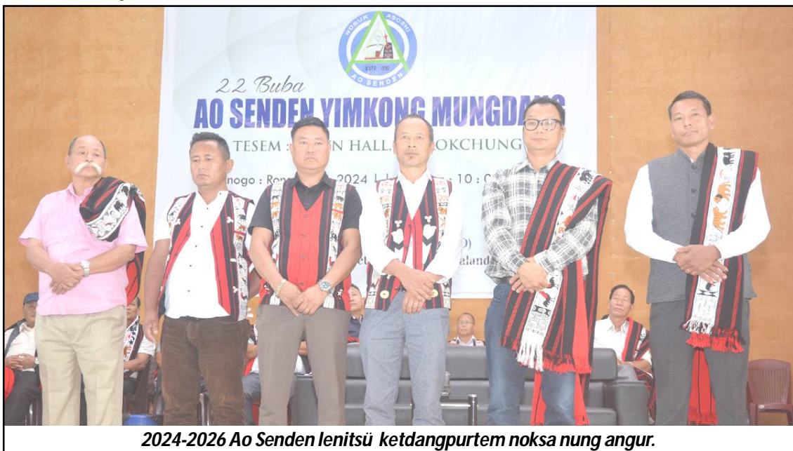
2024-2026 Ao Senden lenitsü ketdangpurtem noksa nung angur.

Melenshitsuäba luyim kar lemsatepdang, rongsenketzüng ajungkettsü asoshi rongsen bendenba yimya asenyanglutsüla. Tensa den apet aluyimba yimya melenshitsuäba, asenokji aluyimba tsütsü meyiptsüba dang kechiyong asen lima ali peria kar aser tziü mopung (climate) kanga tesütep. Kechi lu yimdir yimaka tensa den apet technology tasen amshia tulujunga züsentettsütsüla, ta ashi. Asenyanglutsüba temela masütsü, ibai adoktsü asoshi tongtibangsa tamang katetba, tazüokba, shitak langzütetba, tajung züsentetba, marketing aser tetoktepba nela adoktsü nungdaker, ta paisa shisem.