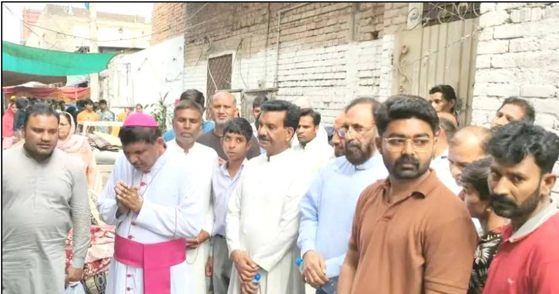
Faisalabad nung tongti putir, Indrias Rehmat leniba nung Khristan lenirtemi April 22 nü Akbarabad semdanga Khristanem ajurudang tangokba noksa nung angur.

April 25, 2024: Central Pakistan nung Khristan kibong aika pei kidang nungi meindokba sülen item Khristanem yaritsü atema Arogo kati senotsü lenmang bushitsüdar.