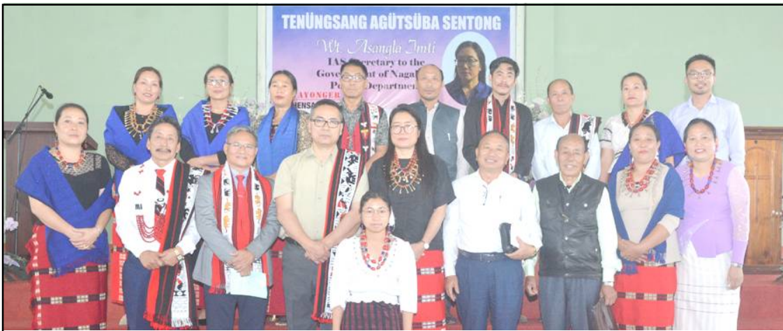
Khens yimdeni ayongzüka Asangla Imti IAS nem tenüngsang agütsüba sentong nung tongti shilem agirtem külemi tangokba noksa nung angur. Mokokchung, 27th April, 2024

Khensa, April 28 (TYO): Khensa yimer rongnung mezüngbuba Indian Administrative Service (IAS) jenjang tongtetla Asangla Imti IAS, Secretary to the Government of Nagaland, Power Department nem tenüngsang agütsüba sentong ka Khensa yimdak Multipurpose Community Hall nung meraketa kaogo. Iba sentong ya Khensa Village Council-i ayongzü.