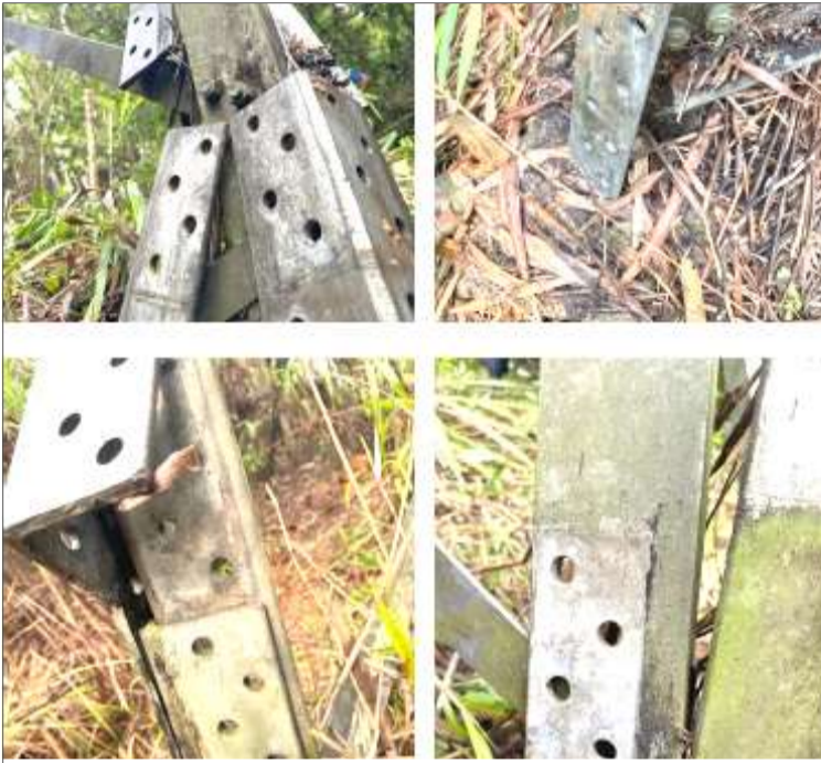
Wokha - Sanis Transmission Line nung tower ka nungi nuts & bolts agizüker aliba noksa nung angur.

Dimapur, April 28, 2024 (TYO): Nisung kari tower osettem auyaba ajanga Wokha - Sanis Transmission Line nung tower AP No. 16 laogo ta Department of Power-i metetdaksü.