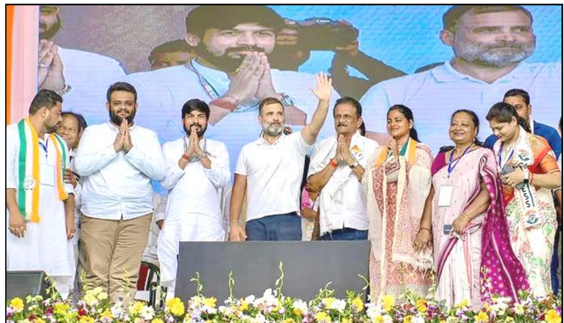
April 28, 2024 nü Kendrapara, Odisha nung Lok Sabha election atema nüboyim sentong ka nung Congress lenir, Rahul Gandhi adenba noksa nung angur.

Hokolbarnü North 24 Parganas district kübok Sandeshkhali nung Central Bureau Investigation (CBI), bomb detection squad, National Security Guard (NSG), central paramilitary forces aser West Bengal Police-i mita oa liasü.