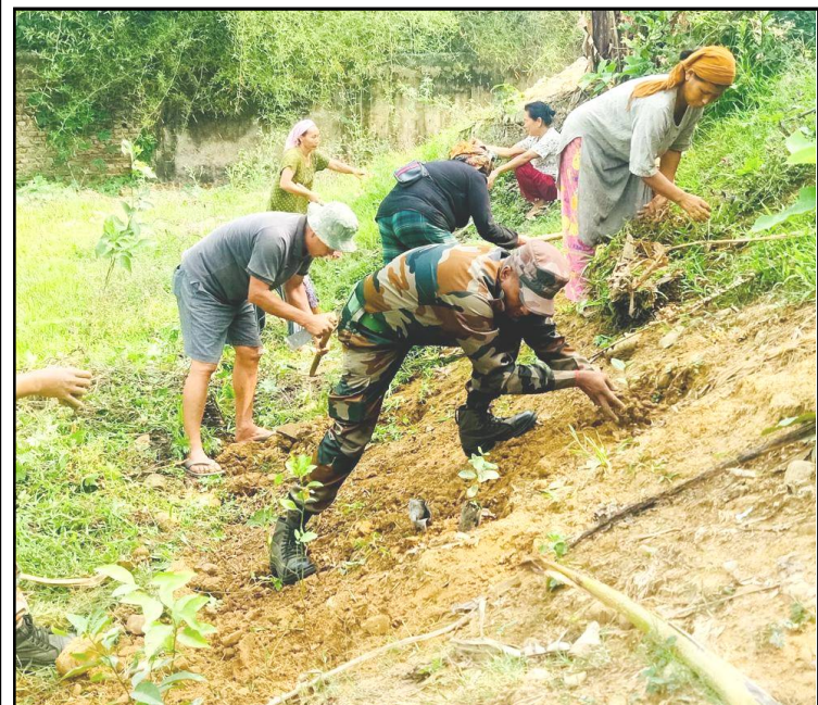
Libajen wazüka ayuba nunga nendaka inyakba temaitsü sayua Assam Rifles temi April 29, 2024 nü Selouphe village nung süngdong atemba sentong ka ayongzuka liasü. Iba sentong nung Selouphe yimtsüing nungi GBs aser council chairman-i anir nisung 30 shi arua süngdong aika atem.