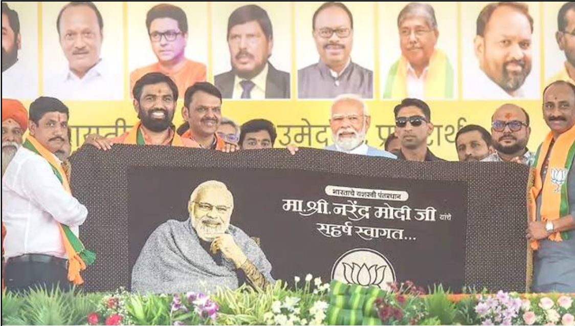
April 29, 2024 nü Solapur nung Lok Sabha election nüboyim sentong ka nung Ato kilonser Narendra Modi aser Maharashtra Deputy Chief Minister Devendra Fadnavis na den BJP lenirtem tangokba noksa nung angur.