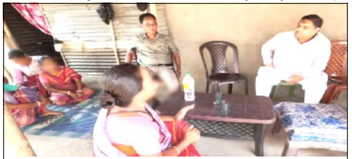
National Commission for Protection of Child Rights (NCPCR) chairperson Priyank Kanoongi-aniba teloki tanur tetsür kinungertem den ajurutepdang agiba noksa ka angur.