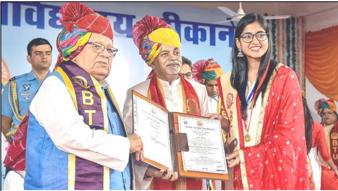
April 29, 2024 nü Bikaner nung Bikaner Technical University (BTU) convocation sentong nung Rajasthan Angh, Kalraj Mishra adenba noksa nung angur.

"Bihar nung Lok Sabha election osang ajanga aika süngmangtsü, ta ni aiben jembia aruogo. Nüburtemi 'Mahagathbandhan' yaritsü. Ato kilonseri tesüiba küm 10 nung Bihar nung NDA sorkari inyaktetba indang jembitsüsa kecha mali," ta paisa metetdaksü.