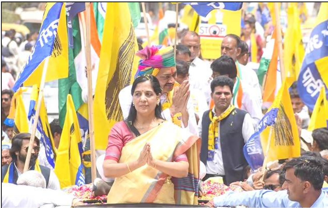
May 02, 2024 nü Gujarat kübok Bhavnagar nung Delhi Chief Minister Arvind Kejriwal kinüngtsü, Sunita Kejriwal-i Bhavnagar constituency nungi AAP candidate, Umesh Makwana atema nüboyimtsü dang tangokba noksa nung angur.