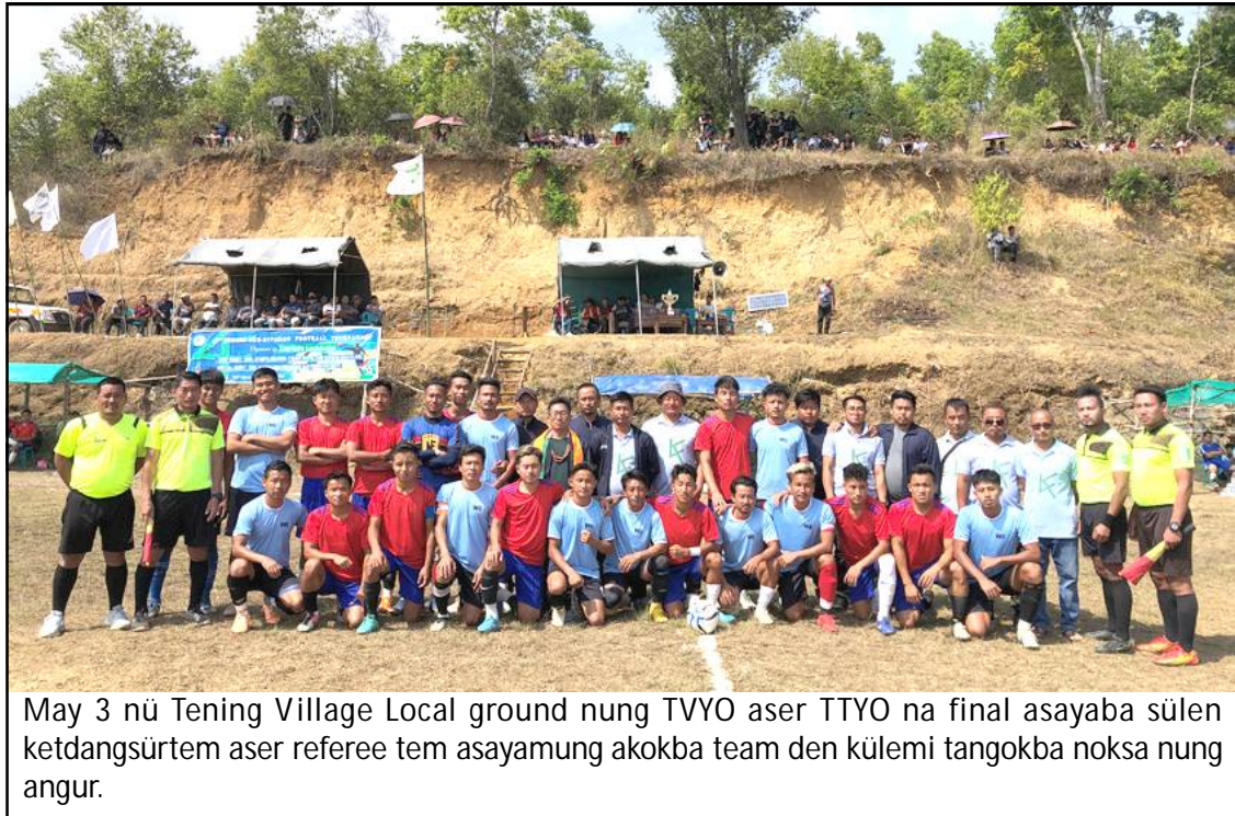
May 3 nü Tening Village Local ground nung TVYO aser TTYO na final asayaba sülen ketdangsürtem aser referee tem asayamung akokba team den külemi tangokba noksa nung angur.