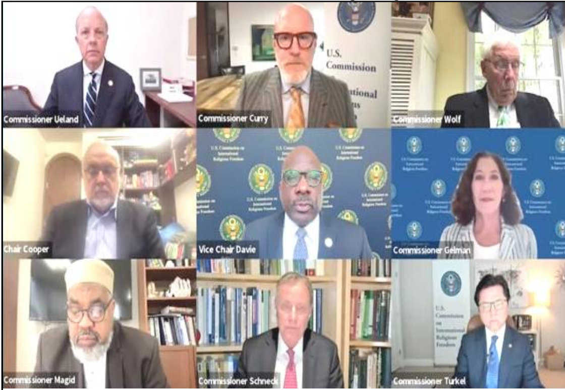
May 1, 2024 nü United States Commission on International Religious Freedom (USCIRF)-i Religious Freedom report sangdongba sülen Commissionertem-i jembidang tangokba noksa nung angur.

Washington, D.C, Monupii/ May 03 (Agencies): Bodhbarnü (May 1) United States Commission on International Religious Freedom (USCIRF)-i parnoki küm shia sangdongba Religious Freedom report sangdongogo. USCIRF-i U.S. State Department dang tamangba yimsü temeden anema inyakba atema linük 17 Countries of Particular Concern (CPC) nung züngoktsü atema benok. Linük 17 ji Afghanistan, Azerbaijan, Burma (Myanmar), China, Cuba, Eritrea, India, Iran, Nicaragua, Nigeria, North Korea, Pakistan, Russia, Saudi Arabia, Tajikistan, Turkmenistan aser Vietnam linüktem lir. Alima nung yimsü temeden dak sendakba nung osang renema US state Department nem metetdaksütsü atema International Religious Freedom Act of 1998 (IRFA) ajanga USCIRF ya jurila commission ka ama tenteta liasü. IRFA-i ashiba agi, küm shia United States Tiri tamangba