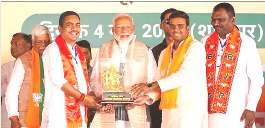
May 04, 2024 nü Palamu district nung Lok Sabha election nüboyim sentong ka nung BJP lenirtemi Ato kilonser Narendra Modi nem sempet ka agütsüdang tangokba noksa nung angur.