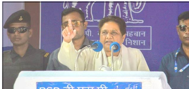
May 04, 2024 nü Agra nung Lok Sabha election atema nüboyim sentong ka nung BSP tongti lenir, Mayawati-i jembidang tangokba noksa nung angur.

Hassan Lok Sabha menden nung candidate lir. April 27 nü pai linük toktsür ao. Pa indang advocate-i pa SIT matsüngdangi arutsü atema anogo tenet meshi saka ibaji temzüng nung mali, ta shia magizük. Karnataka Chief Minister, Siddaramaiah-i ketdangsertem dang iba ken o nung zübazülema inyakra mesüra menora ibajibo magizüktetsü, ta shiogo. Paise, iba ken o nung shilem agia alirtem nem temerenshi tulu agütsütsü, ta metetdaktsü. "Prajwal Revanna tekeraba nung apütsü atema inyaktü. Iba ken o nung shilem agia alirtem nem temerenshi tulu agütsütsüla," ta chief minister-i metetdaktsü.