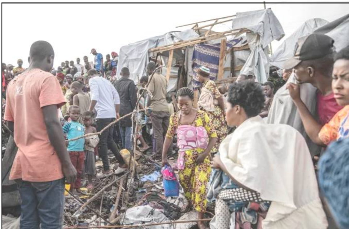
Democratic Republic of the Congo nung North Kivu province kübok Goma yimti tezülen camp ka nung bomb pokloktsüba sülen nüburttem adenshia aliba noksa nung angur.