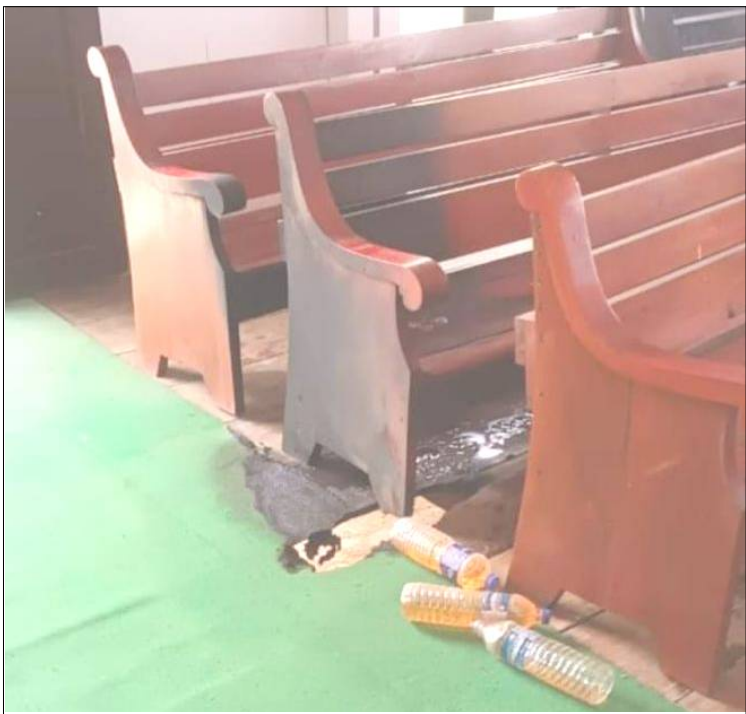
Kinünger yimtak May 3 nü tenla kidang menden aser atem arongba noksa nungji angur.

Mokokchung, May/Monupii 3 (TYO): Kinünger yimtak May 3 anepdang 1:30 ako nungi 2:00 ako meta mapang kasa nungdang mi adoka ki ana arong, iba ki ana