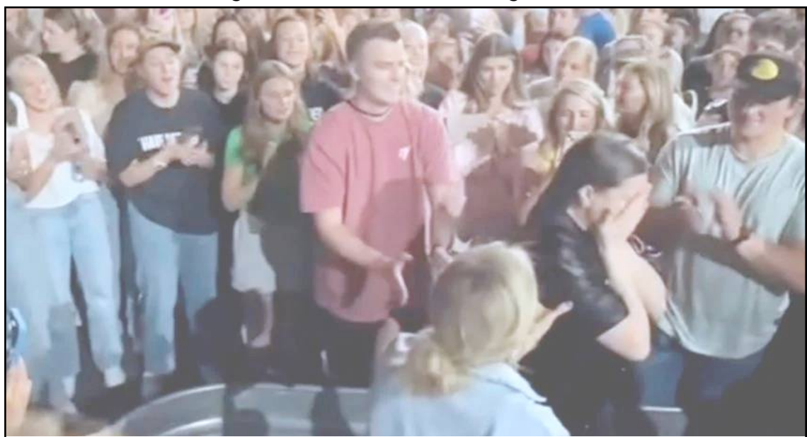
Tan hopta Tennessee nung ayongzükba Unite US sentong nung kaketshirtem baptidang tangokba noksa nung angur.

May 04, 2024: Yaküm Auburn University campus nung tanela asentenshi milak tuluka jangruba sülen maneni university campus pezü nunga asentenshi milak jangrua kaketshir meyrjang aikati Yisu Khrista agizükogo.