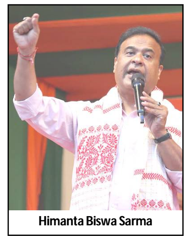
Himanta Biswa Sarma

Guwahati, Monupii/May 6 (Agencies): Assam chief minister Himanta Biswa Sarma, shibai Assam nung nüboyimba sentong Deobarnü tembangogo, pai iba tajangshiba ya temeshi aini aoba mesüka liasü ta ashi. Anogo 40 tsüingda CM Sarma-i Assam kübok tesem balala sema senzü aser iba mapang lokti senden aser road show 117 nung shilem agia liasü.