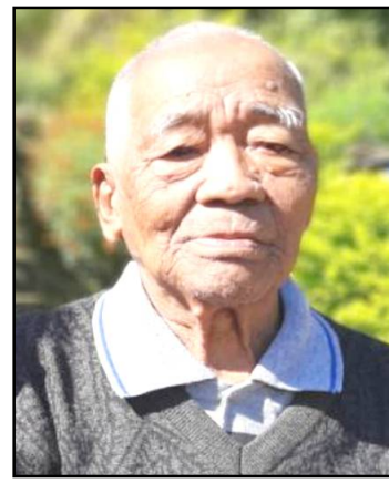
"Ni rara tajungji raraogo, ni alizüng tonga asemogo, ni tamangji yuogo" 2 Timoti 4:7.