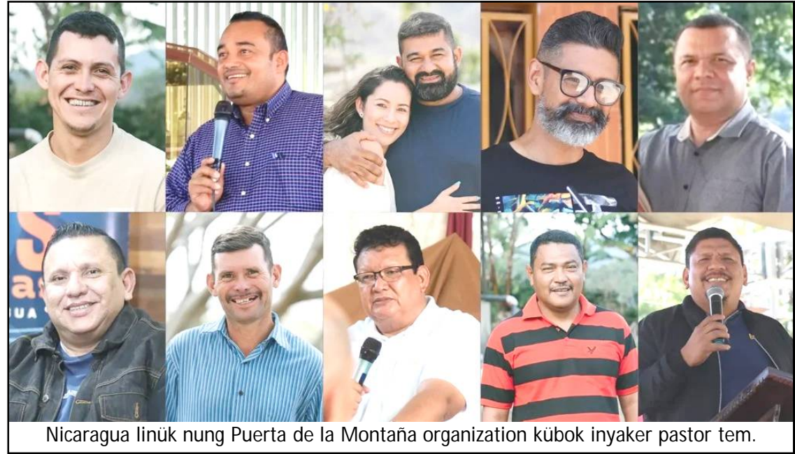
Nicaragua linük nung Puerta de la Montaña organization kübok inyaker pastor tem.

May 06, 2024: ADF International-i mepishiba nung ajemdaker Inter-American Commission on Human Rights-i Nicaragua sorkar dang parnoki pua aliba pastor 11 health anepalutsüsü, akhümtsübutüsü aser kümzüka ayutsü mepishia metetdaksüogo.