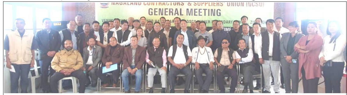
Nagaland Contractors & Suppliers' Union (NCSU) lokti senden Kohima Village VDB Hall nung May 7, 2024 nü amendang tangokba noksa.

Dimapur, Monupii/May 07 (TYO): Nagaland Contractors & Suppliers' Union (NCSU) Head Office Kohima lokti senden May 7, 2024 nü Kohima Village VDB Hall nung mena liasü.