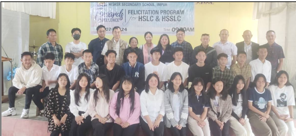
CMHSS, Impur nung takok angur kaketshirtem nem tetushi agütsüba sentong temer kelen takok angur kaketshirtem, ABAM lenirtem, Managing Board pur, school Principal, tesayurtem aser tsüraburtem külemi tangokba noksa nungji angur.