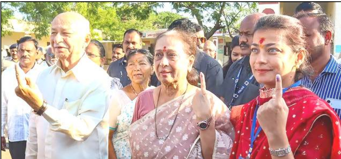
May 07, 2024 nü Lok Sabha election shilem tasembuba agiba anogo nung Karad nung Congress lenir, Sushilkumar Shinde den par kibong züngsemtemi vote agütsüba sülen tangokba noksa nung angur.

"Ato kilonseri tribal nüburtem meyong tzü, arem aser ali industrialists 14-15 nem agütsüner. Pa küm 10 yimsüsüba mapang nung pai nisung 22 billionaire kümdaktsüogo. Onoki takok ngura onoki nisung crore aika lakhpati kümdaktsütsü aser sensaker tetsürtem nem küm shia sen lakh kaka agütsütsü," ta paisa nangzük.