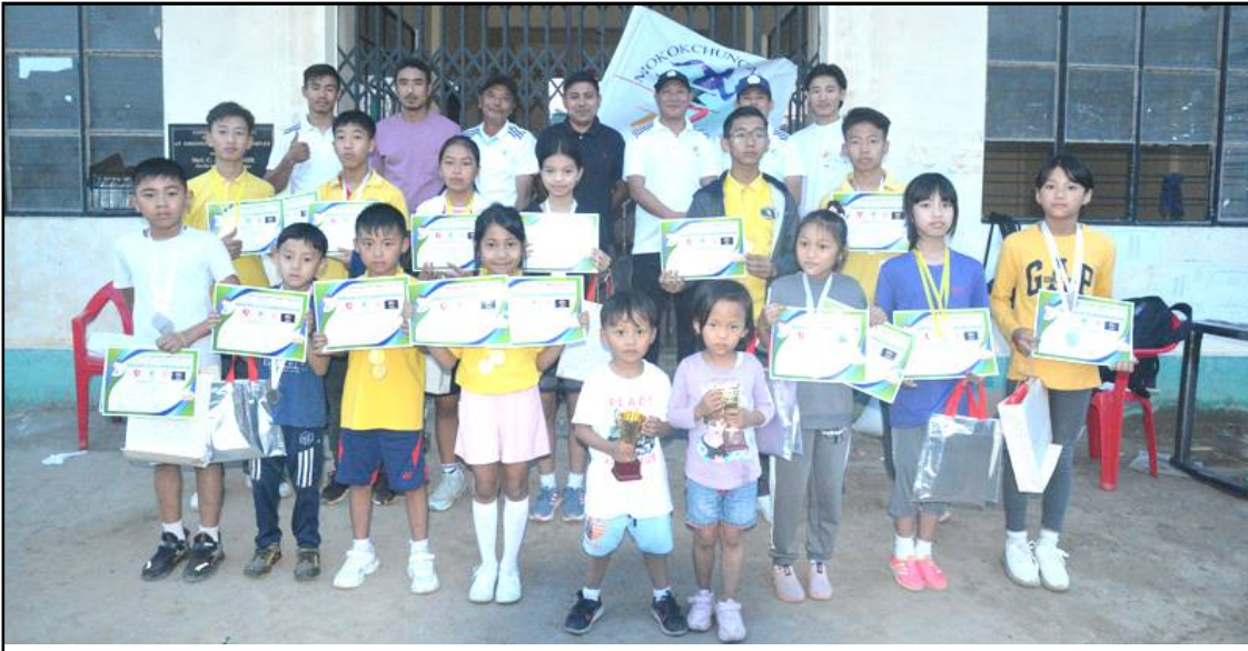
"Believe in your dreams" omen dak rangloker 'Kids Athletics Day' nungtem Mokochung Athletics-i ayongzüka Mokochung Imkongmeren Sports Complex nung tanurtem asoshi asemtepba sentong ka akaba mapang asemtepba telemsa balala nung takok angurtem den tayongertem külemi tangokba noksa nung angur. Asemtepba arishi küm telemsa yamai liasü - arishi küm 4-7, 8-11 aser 12-14. Takok angur mezüing aser tanabuba jenjang nem senpet medal den certificate aser gift hamper agi senpetsü. Mokochung, 7th May, 2024.