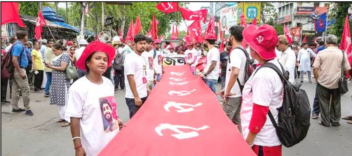
May 09, 2024 nü Kolkata nung CPI(M) züngsemtemi Lok Sabha election nung party candidates atema nüboyimdang tangokba noksa nung angur.

licence aliba factory ka lir, ta kasa osang ajanga metetdaksü. Iba lendong atalokba osang angashiba sülen Tamil Nadu Chief Minister, M K Stalin-i iba lendong nung asür kinüngertem den mangyim jashi lemsatopba den külemi district ketdangsertem dang yirua alirtemji tajungtiba nung yariang, ta tuyuogo.