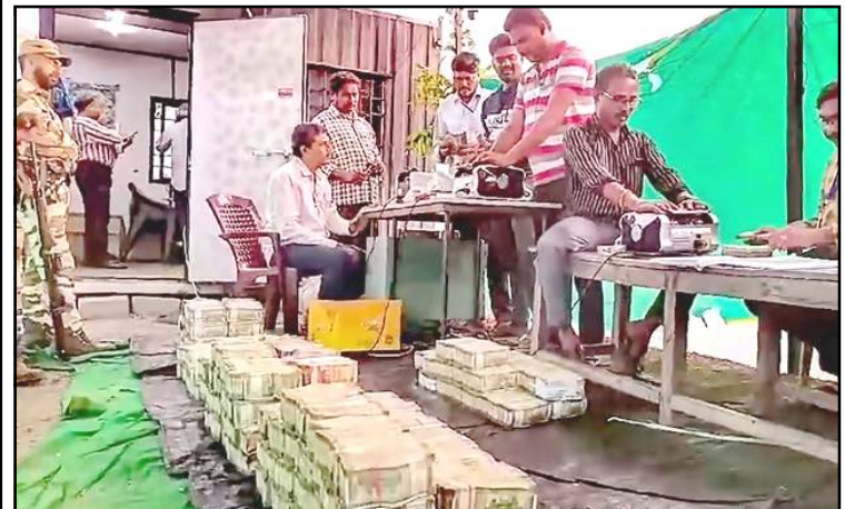
May 09, 2024 nü Krishna district, Andhya Pradesh nung police-i truck ka nungi sen crore 8.5 apuba sülen sen azüngdang tangokba noksa nung angur.

May 13 nü Telangana nung Lok Sabha menden 17 prongla atema election agitsü.