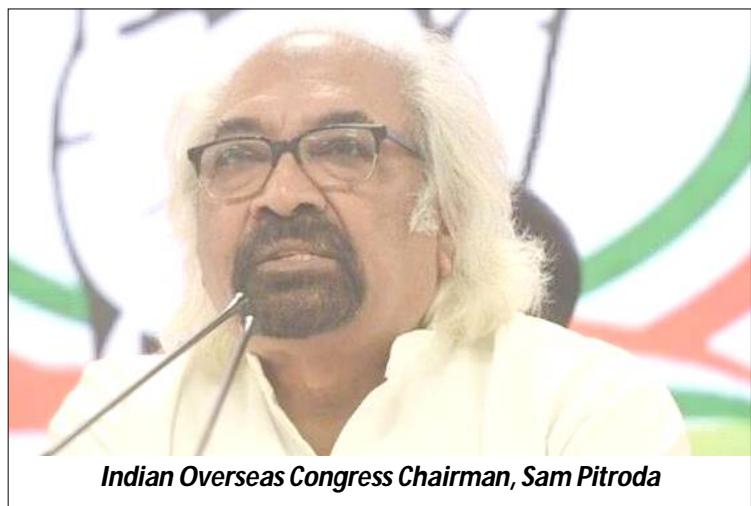
Indian Overseas Congress Chairman, Sam Pitroda

Dimapur, Monupii/May 12 (TYO): India nung nisung kin balala aliba indang taoba Indian Overseas Congress Chairman Sam Pitroda-i rateta ashiba All India Congress Committee (AICC) ajanga magizükba ama Nagaland Pradesh Congress Committee (NPCC)-ia pai pa tangatetba nung iba o jembiba aser yangji Congress Party shilem kecha mali, ta Deobarnü sangdong ka ajanga ashi.