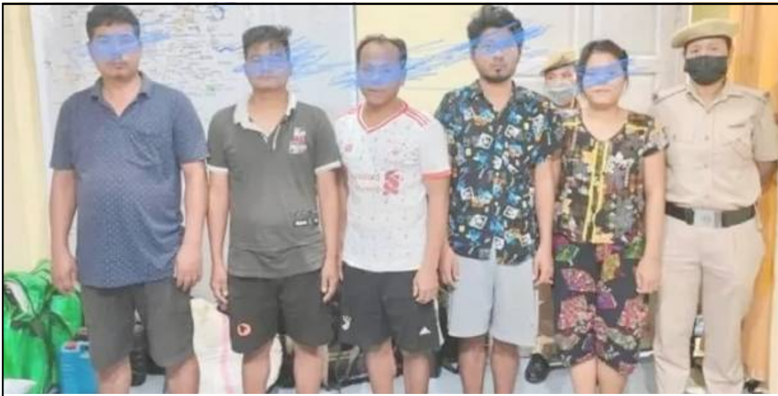
Myanmar nungertem Churachandpur district nung apuba noksa nung angur.

Imphal, Monupii/May 12 (Agencies): Manipur kübok Kamjong district nung kuli kaket tejangja maliba Myanmar nunger shirnok tang tashi nung jangjar lir, parnok rongnung 15 süogo, 359 pei mulungka nung Myanmar-i meyipaogo aser tanungba 5,457 district nung camp balala nung jenoka lir. Myanmar nung tang mepetmesü tulu adoker aliba ajanga nüburtem aika Manpur-i senoka aitar, ta ketsürtemi Deobarnü metetdaksü. Migrant 5,457 ya iba tesem nung aliba nüburtem nungi pilar camp ti nung jenoka lir. Item camp tem ya yimtsung balala nung committee temi achaayangdar aser chiyongsü aser teningdakba oset balala District Administration-i agüja arudar. Migrant tem nem District Administration-i identity card agütsüogo aser camp tem nung nisung kwi ali aji jangjatsü