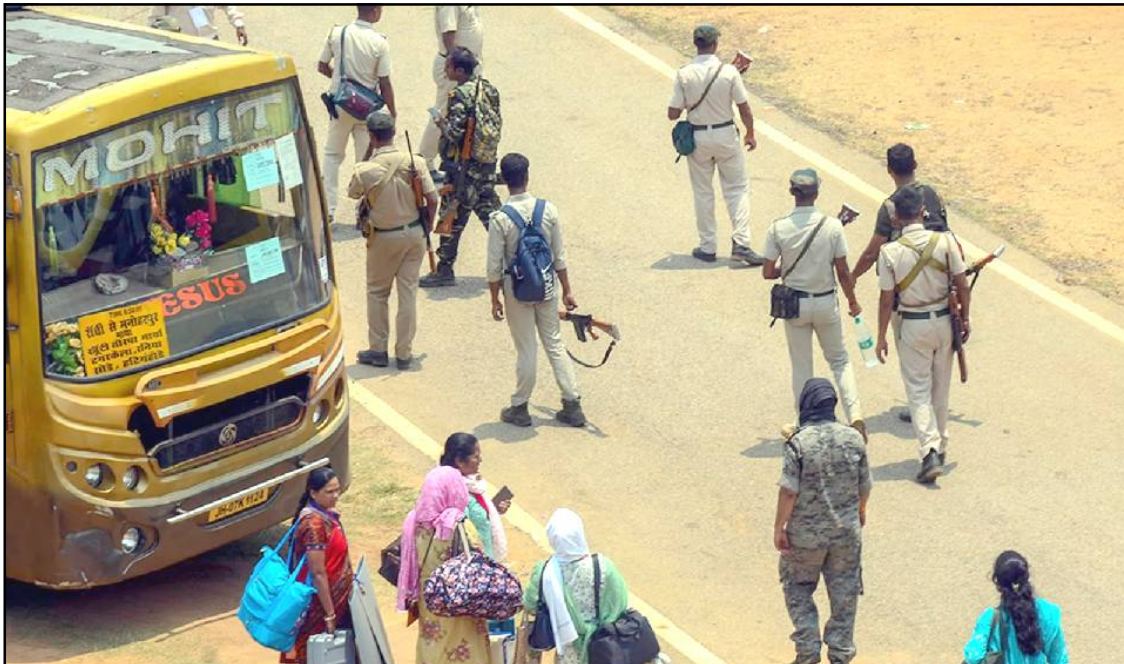
Lok Sabha election shilem pezübuba agitsü anogo ka lia May 12, 2024 nü Jharkhand state kübok Khunti nung sepaitem aser polling official tem EVMs aser election dak sendakba oset balala bener polling stations-i apusodang tangokba noksa nung angur.