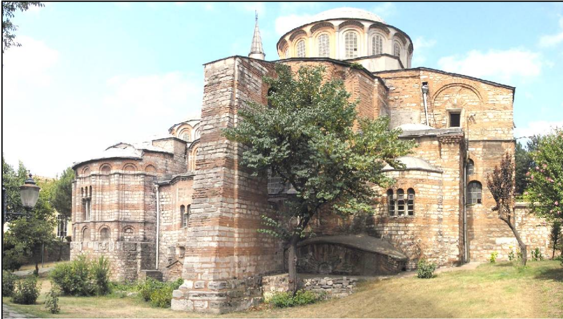
Turkey nung Aso 4buba mapang Constantine the Great-i asüba Church of the Holy Saviour noksa nung angur.

May 12, 2024: Akhidang Byzantine mapang aliba Tenla ki ka agi mosque kuma yanglushiba tekülem ki ka Turkey Tir, Recep Tayyip Erdogan-i semzüksüogo.