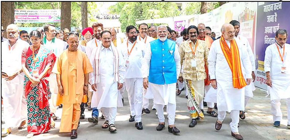
Mongolbarnü Ato Kilonser Narendra Modi Varanasi nung nomination file asür aruba noksa nung angur. Pa meina Home Minister Amit Shah, BJP tir J P Nadda, UP CM Yogi aser NDA lenirtem oa liasü.

New Delhi, Monupii/May 14 (Agencies): Ato Kilonser Narendra Modi-i Lok Sabha elections atema Mongolbarnü Varanasi nungi pa indang nomination file süogo.