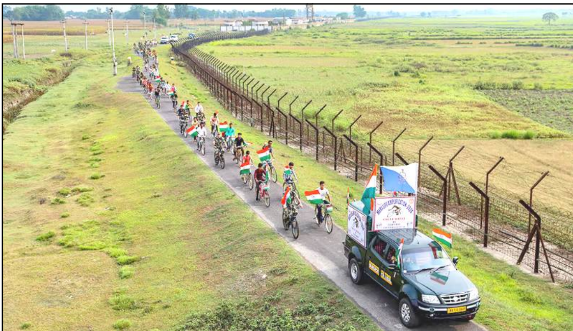
Indian Border Security Force (BSF) personal tem den lanurtem cycle rally ka nung shilem agiba noksa nung angur. Tzü wazüka ayutsü, education aser tzü mopung mereka ayutsü asoshi tangazükba agütsütsü nukjidong nung Iba rally ya West Bengal kübok Pariyal yimtsü nung ayongzüka agia liasü.