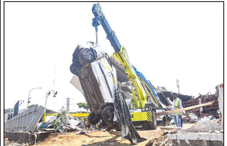
Mumbai kübok Ghatkopar nung sign board ka chirepba tesem nung tekümzükba maparen balala inyakba noksa nung angur. Iba lendong nung nisung 14 asü aser nisung 76 yirua liasü.

Mumbai, Monupii/May 14 (Agencies): Hombarnü Mumbai kübok Ghatkopar