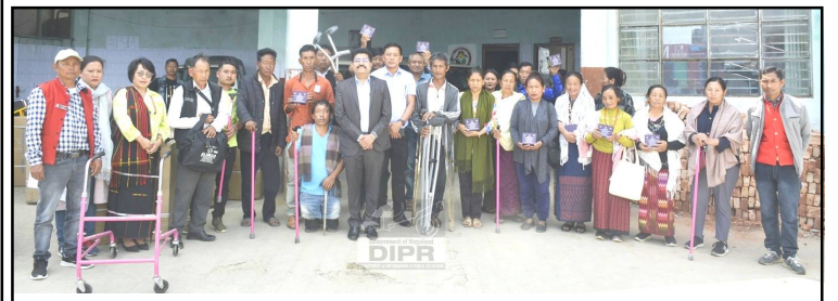
Deputy Commissioner, Zunheboto ajanga May 13, 2024 nü Ministry of Social Justice & Empowerment kübok ADIP Scheme ajanga Zunheboto district nung teyari oset balala lema agütsüba noksa nung angur.