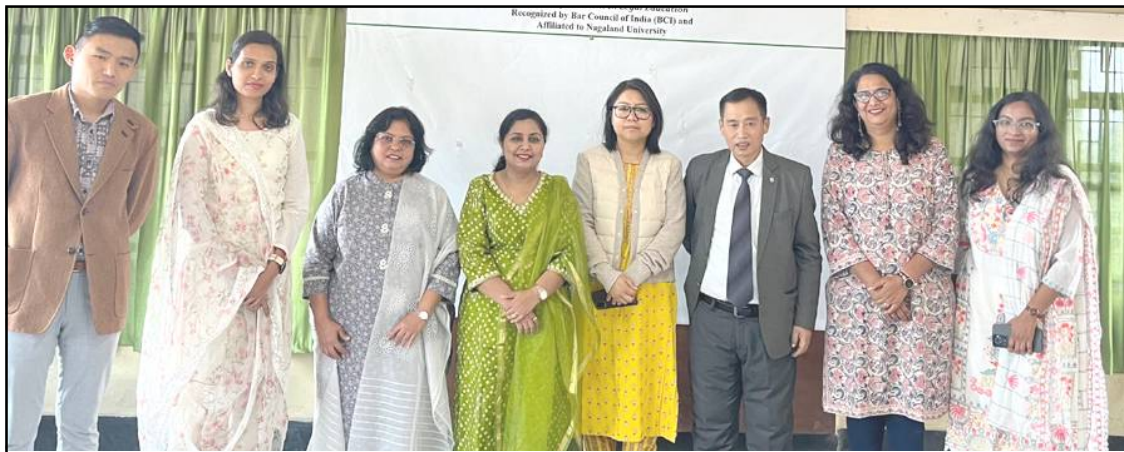
Nagpur Govt. Law College aser Kohima Law College nungi tesayurtem May 14, 2024 nü Kohima Law College nung kaketshirtem den sensaksema mapang tangokba noksa ka angur.

Dimapur, Monupii/May 14 (TYO): Nagpur Govt. Law College nungi professor pungo arua May 14, 2024 nü Kohima Law College nung azünger aser tesayurtem den sensaksema liasü.