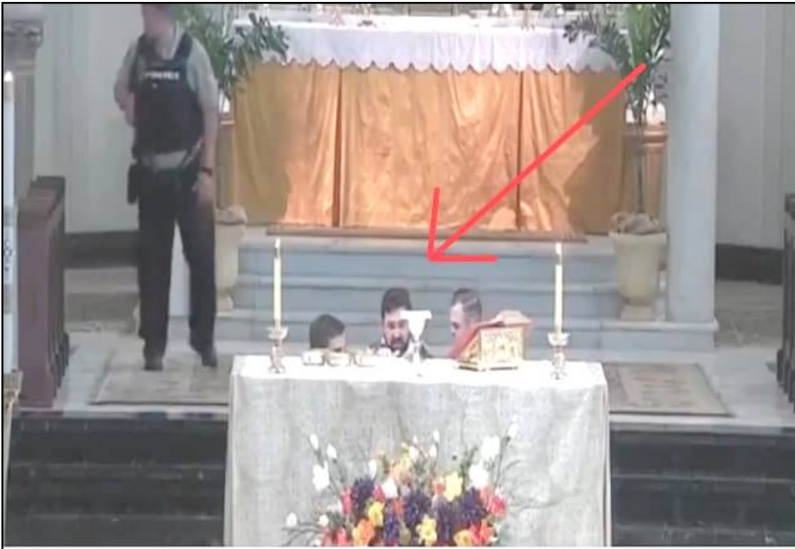
Louisiana state kübok jila tilaka nung aliba St. Mary Magdalen Catholic Church telungi tekülem mapang tanur ka prangbong bener aitba sülen arogo putir atsüka aliba noksa nung angur.

Abbeville, Monupii/May 14 (Agencies): Louisiana nung lanur ka rifle bener tekülem ki tesülen aliba kishi ajanga aittsü merangba yong iba tekülem sentong nung dena alirtem kanga aoksatep.