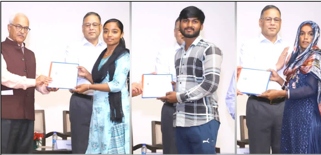
New Delhi, May 15, 2024: Bodhbarnü New Delhi nung Union home secretary, Ajay Kumar Bhalla-i Citizenship (Amendment) Act kübok senso certificates agütsüdang tangokba noksa nung angur. CAA kübok tang mezüng nisung 14 nem senso certificates agütsüogo.