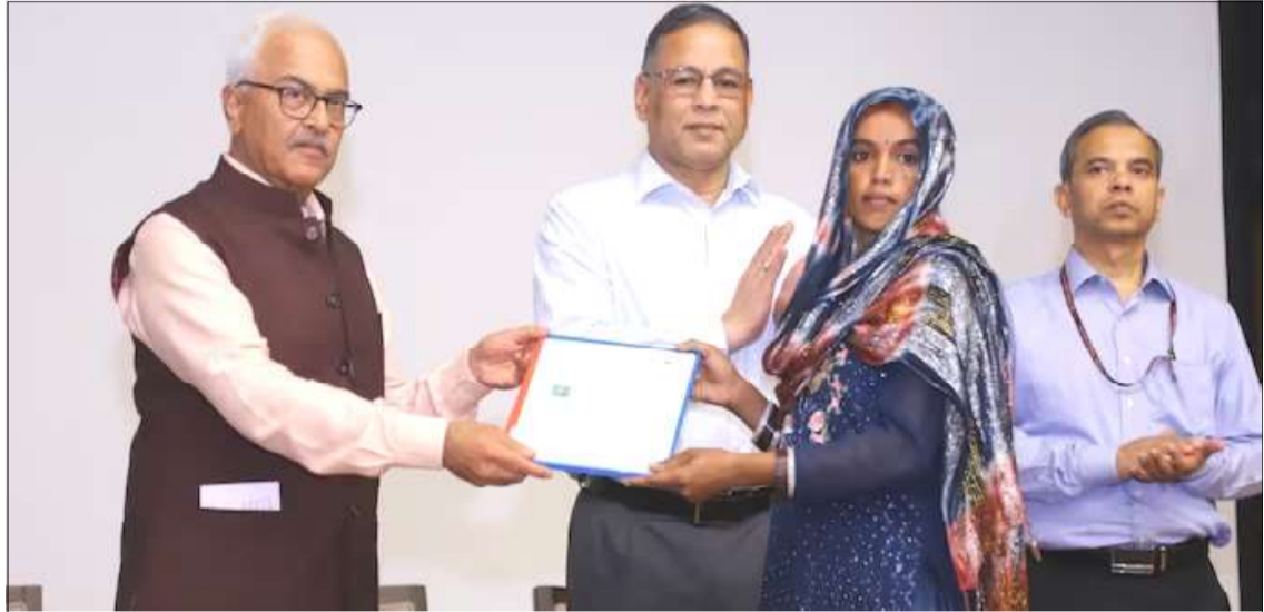
May 15, 2024 nü New Delhi nung Union Home Secretary Ajay Kumar Bhalla-i citizenship certificates agütsüba angur.

Dimapur nung mozü ayokertem putetra ozüng tesashi agi merenshütsü ta NSCN-IM-isa metetdaksüogo.