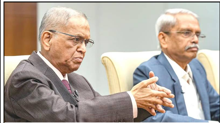
May 15, 2024 nü Bengaluru nung Infosys Science Foundation trustee, N.R. Narayana Murthy-i osangbenertem den jembidang tangokba noksa nung angur.