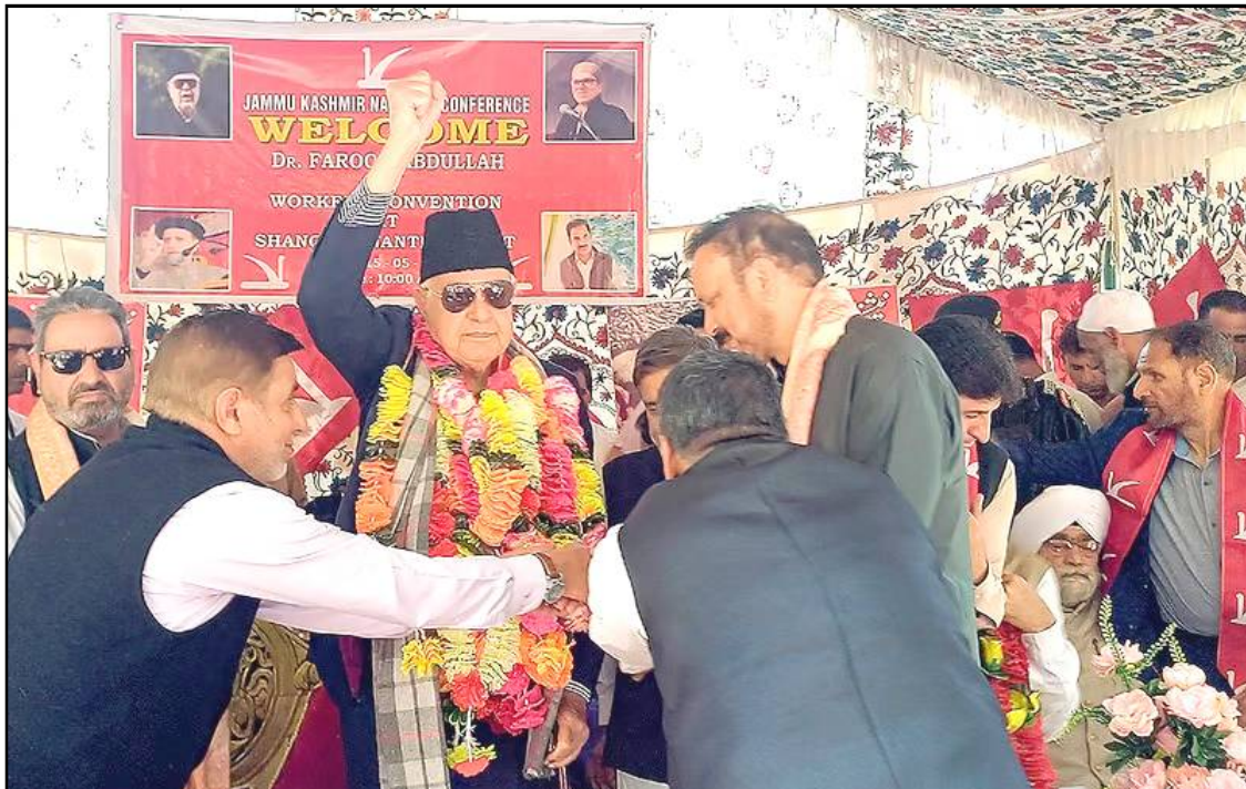
May 15, 2024 nü Anantnag district nung Lok Sabha election nüboyim sentong ka nung National Conference Tir, Farooq Abdullah agizükdang tangokba noksa nung angur.

Akhilesh Yadav-i, "June 4 nungi mapang tajung tenzüktsü aliba atema ni osangbenertem nem tenüngsang agütsür. Iba anogoji osangbenertem sademsadema inyaksü jenjang anguba anogo asütsü. Uttar Pradesh nung INDIA teloktepi menden 79 nung takok angutsü. Menden ka nung dang tokteper aser iba mendenji 'Quito' nung lir," ta ashi.