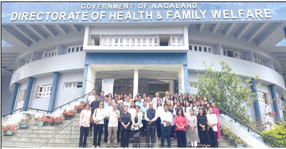
Medical Officers, Community Health Officers aser Staff Nurses tem atema anogo ka National Quality Assurance Standard (NQAS) orientation sentong May 15, 2024 nü Conference Hall, DoHF, Kohima nung agi.

Dimapur, Monupii/May 15 (TYO): Medical Officers, Community Health Officers aser Staff Nurses tem atema anogo ka National Quality Assurance Standard (NQAS) orientation sentong May 15, 2024 nü Directorate of Health and Family Welfare indang Conference Hall, Kohima nung agia liasü.